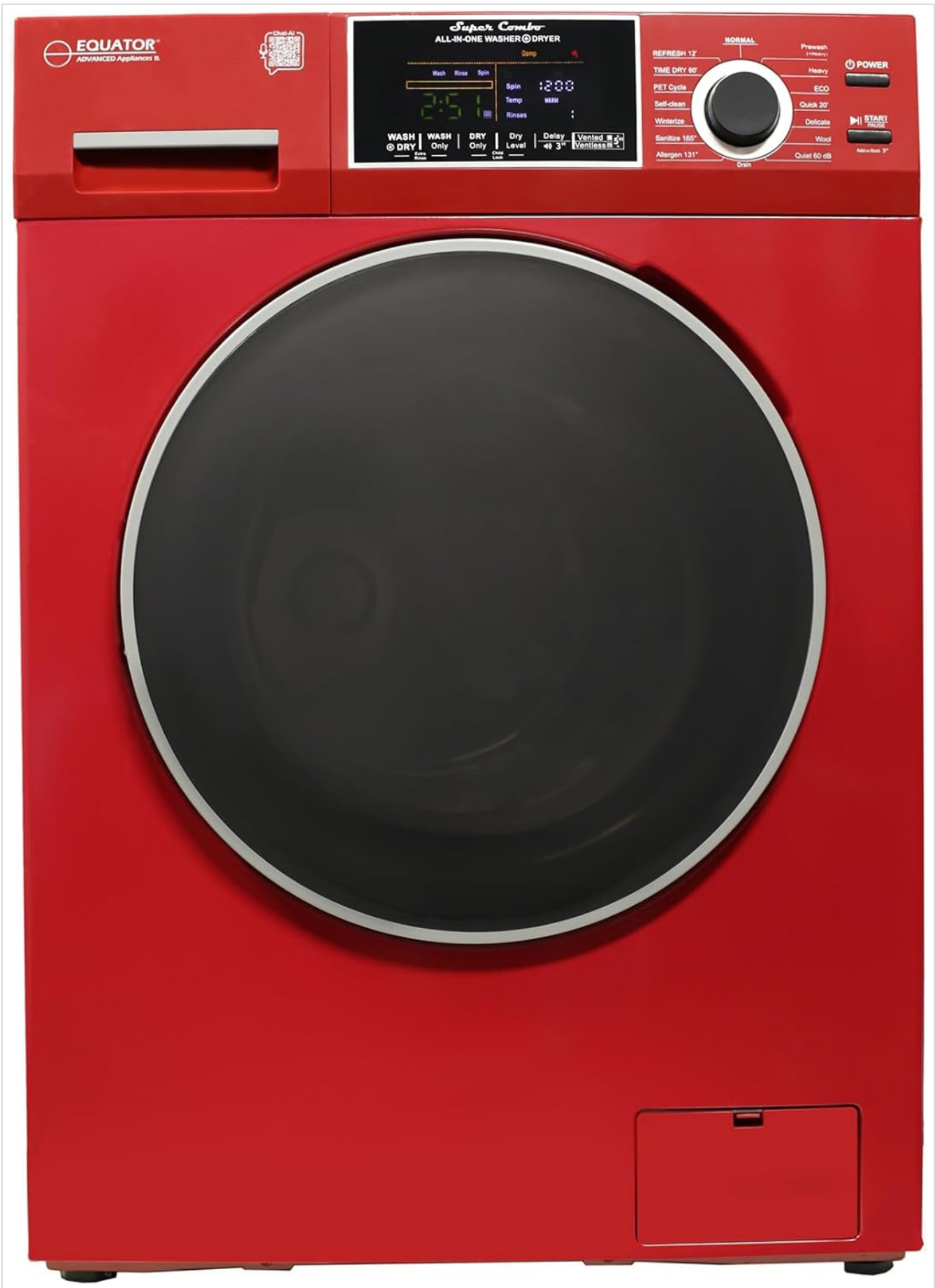
Image: Equator All-in-One Compact Washer Dryer Combo (Merlot color) showing its compact design.