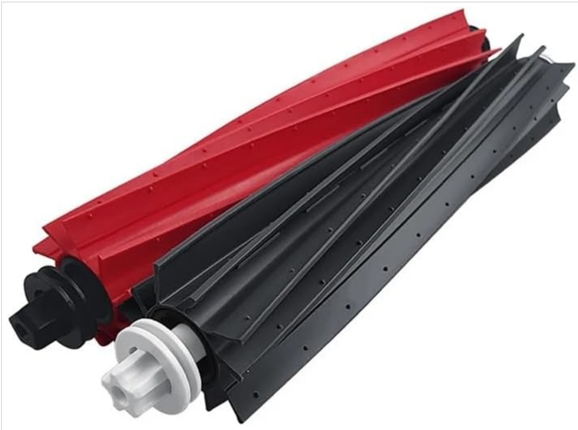
Image shows two main brushes, one red and one black, highlighting their design and compatibility with the Roborock P10S Pro.