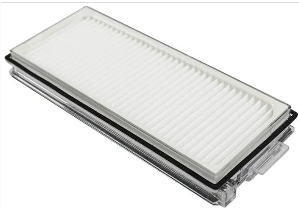
Image shows a rectangular HEPA filter with its pleated white filter material, designed to fit the Roborock P10S Pro dustbin.

Open the dustbin compartment on your robot. Remove the dustbin, then open the dustbin cover to access the filter. Remove the old HEPA filter and insert the new one, ensuring it sits flush. Close the dustbin cover and reinsert the dustbin into the robot.