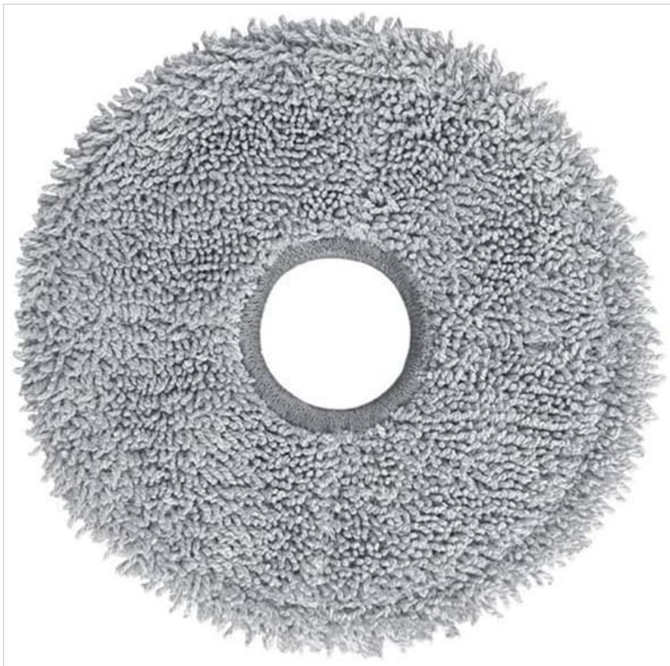
Image displays a circular grey microfiber mop pad, designed for effective floor cleaning.

Attach the mop cloth to the mop pad holder on the underside of the robot. Ensure the cloth is securely fastened, typically using Velcro or a sliding mechanism, so it does not detach during operation.