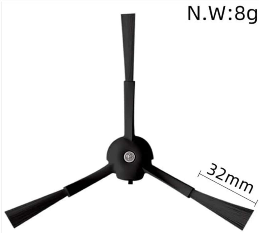
Image displays a black three-armed side brush, indicating its net weight of 8g and a brush arm length of 32mm.