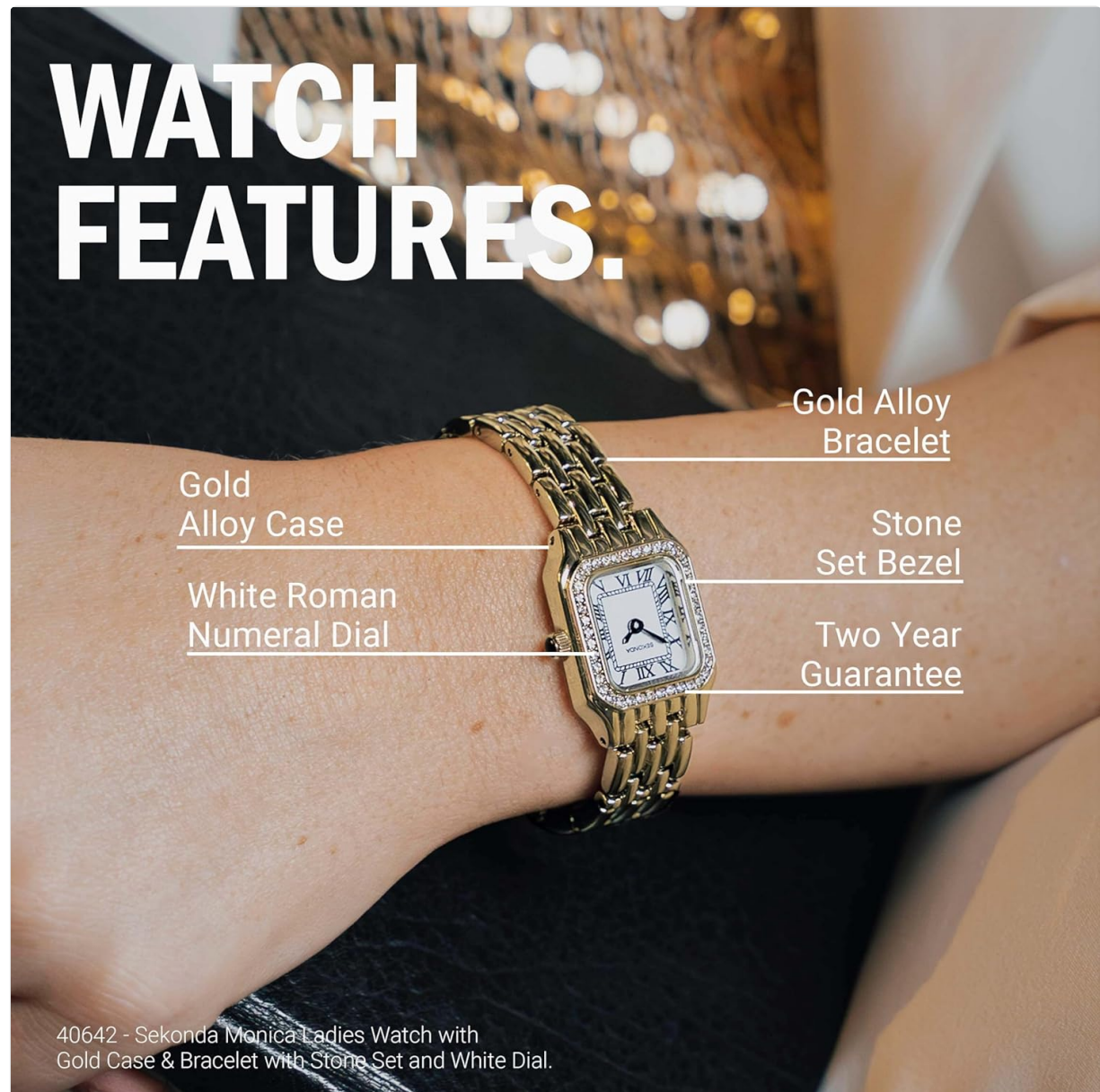
Figure 3: Key features of the Sekonda Monica watch.

begins to lose time, the battery may need replacement. Battery replacement should be performed by a qualified watch technician to prevent damage to the movement or case.