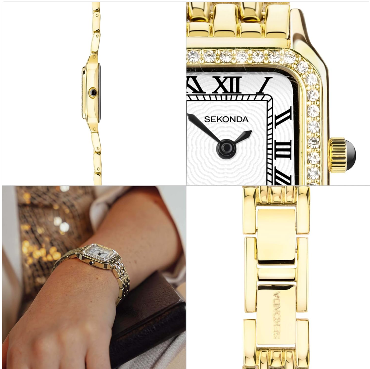
Figure 2: Detail of the watch crown for time adjustment and the bracelet clasp.