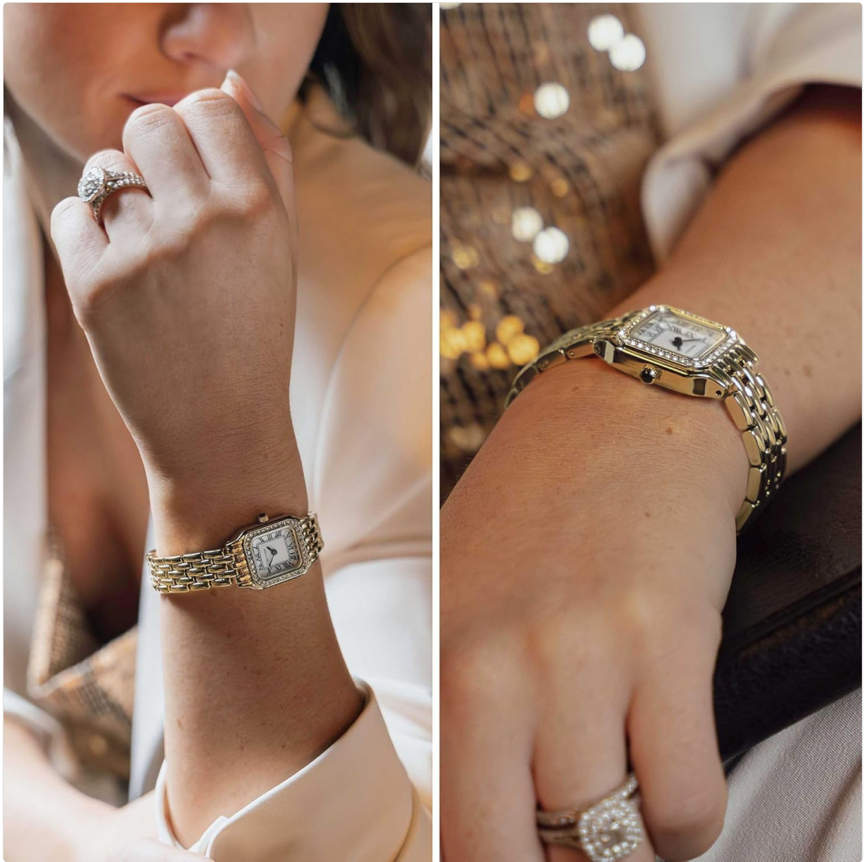
Figure 1: Sekonda Monica Ladies Watch, highlighting its overall aesthetic.