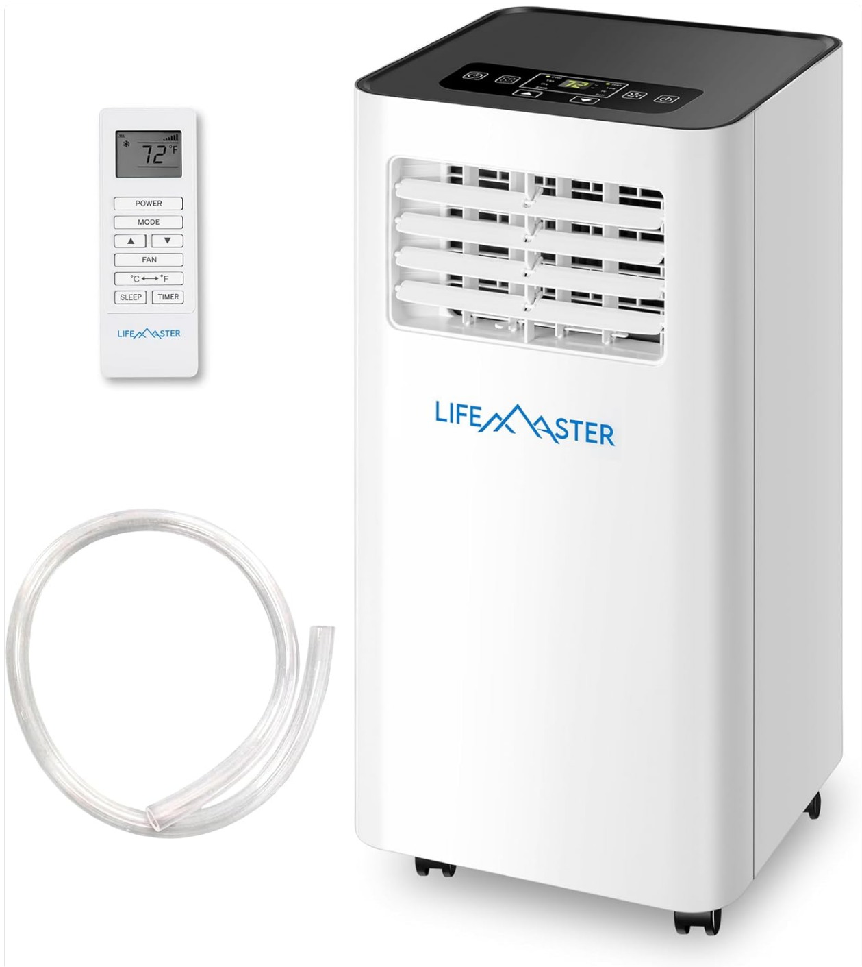
Figure 1: Lifemaster 12,000 BTU Portable Air Conditioner with included remote control and drain hose.