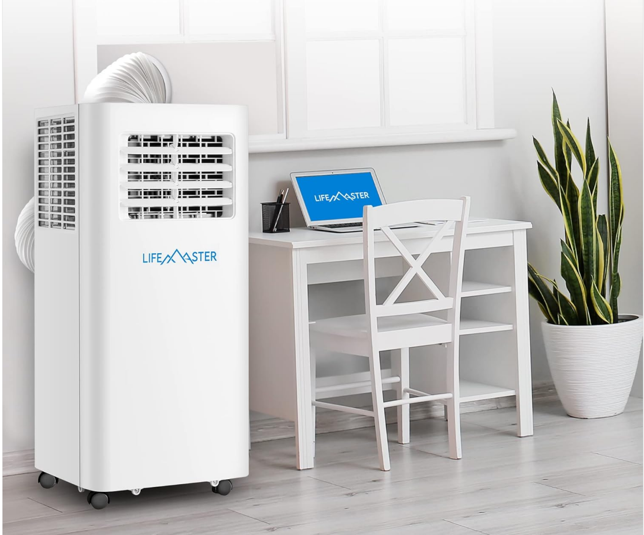
Figure 4: The portable AC unit is shown with its exhaust hose properly installed in a window, ready for operation.

Video 1: This video demonstrates the setup process of the Lifemaster Portable Air Conditioner, including connecting the exhaust hose to the unit and installing it in a window. It highlights the ease of assembly and the unit's compact design.