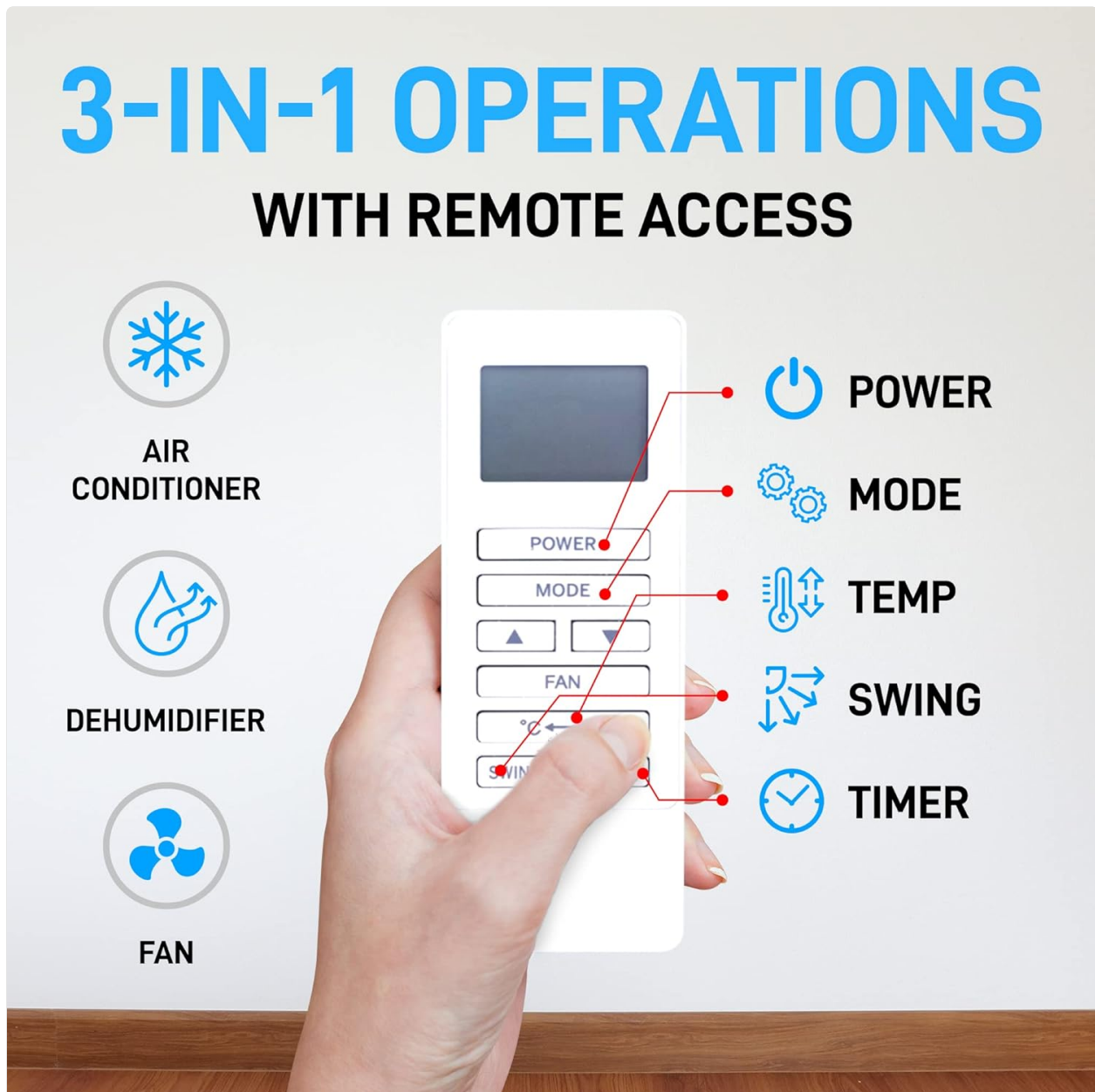
Figure 5: Detailed view of the remote control, showing buttons for Power, Mode, Temperature adjustment, Fan speed, Swing, Sleep, and Timer functions.