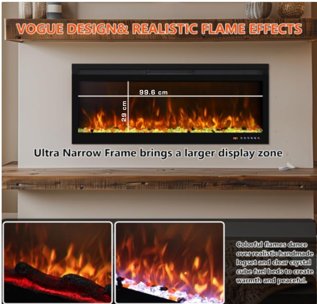
Image: A detailed view of the fireplace highlighting its ultra-narrow frame and key dimensions (e.g., 99.6 cm width, 29 cm height of display area), indicating its sleek design and larger display zone.