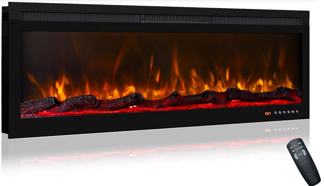
Image: The Mystflame BI42R electric fireplace showcasing both blue and orange flame effects, highlighting its versatile aesthetic.