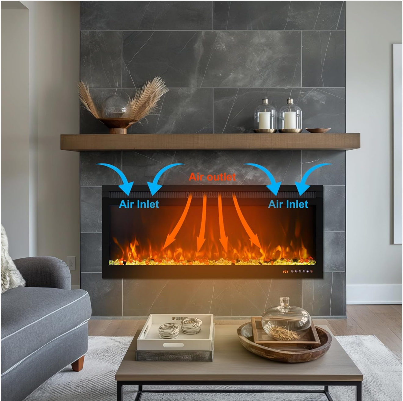
Image: A diagram illustrating the air inlet and air outlet locations on the fireplace, crucial for proper heat distribution and ventilation.

The Mystflame BI42R fireplace supports both wall-mounted and recessed installation. Choose the method that best suits your space and aesthetic preferences.