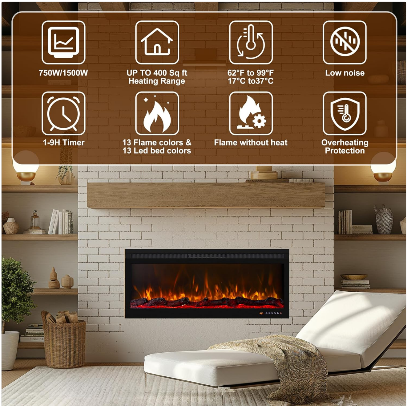
Image: An infographic detailing key features such as 750W/1500W heating, up to 400 sq ft heating range, 1-9 hour timer, low noise operation, 13 flame and LED bed colors, flame without heat option, and overheat protection.