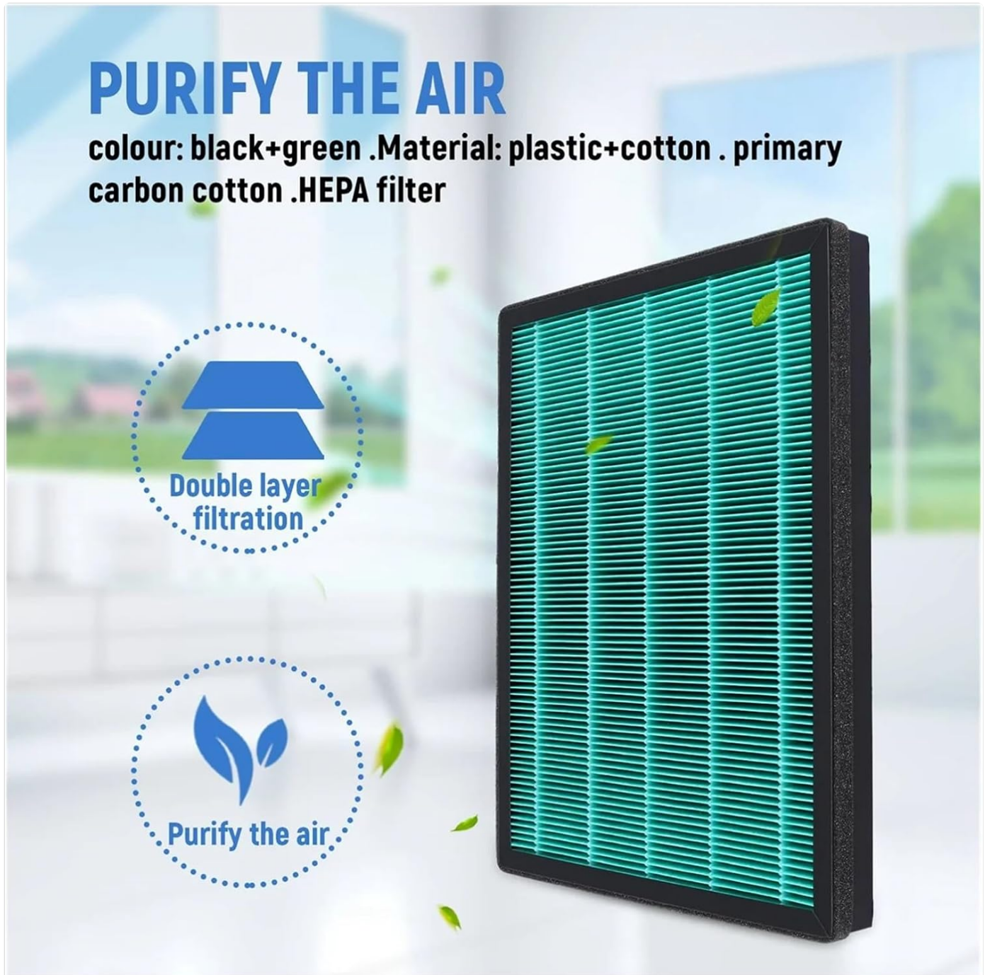
Figure 5.1: The dual filtration system effectively purifies the air.