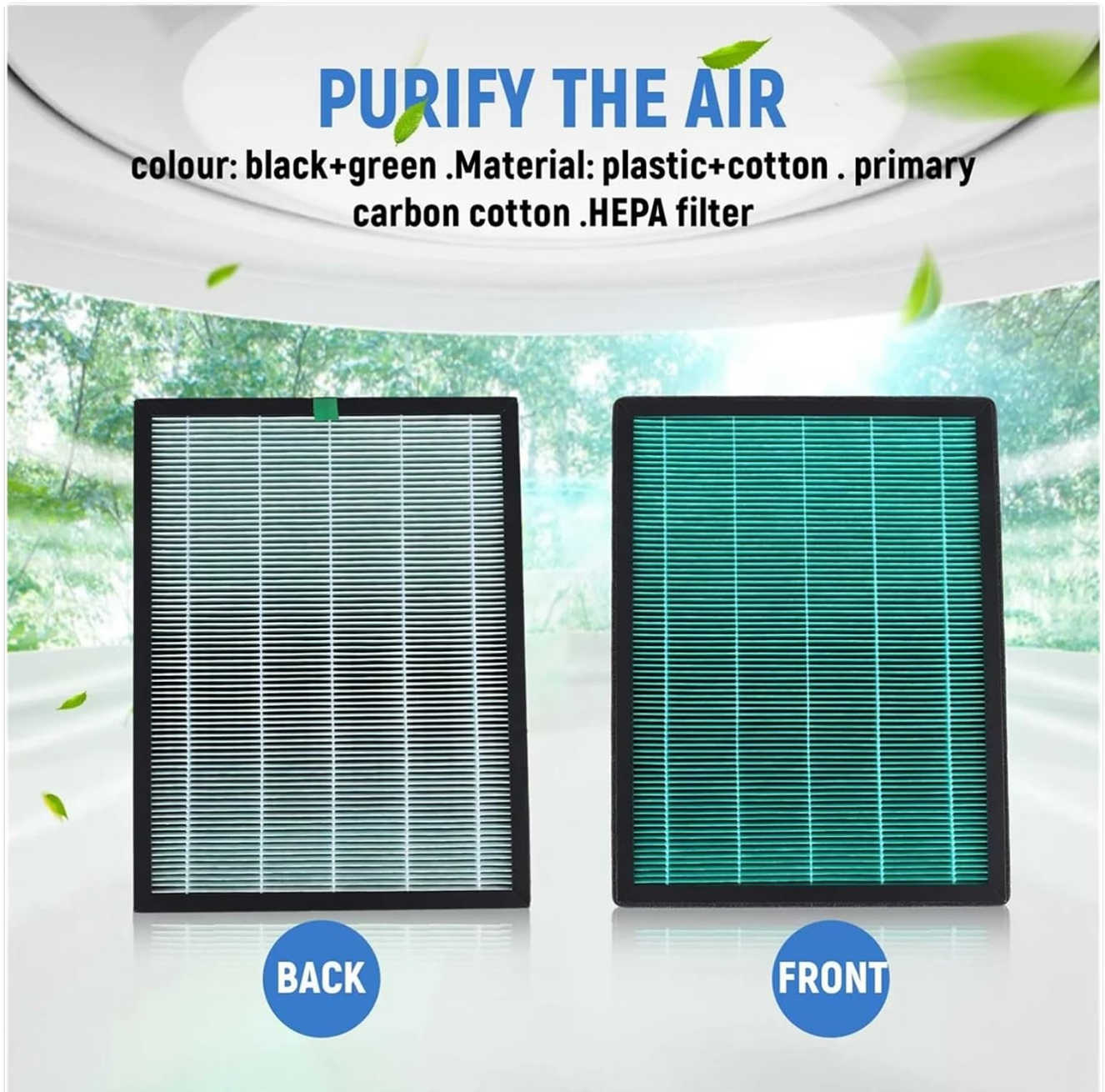
Figure 4.1: Front and back view of the HEPA filter. Ensure correct orientation during installation.