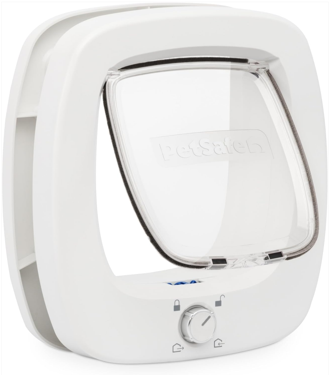
Image: The PetSafe Large Cat Flap 2.0 in white, showcasing its sleek design and clear flap.