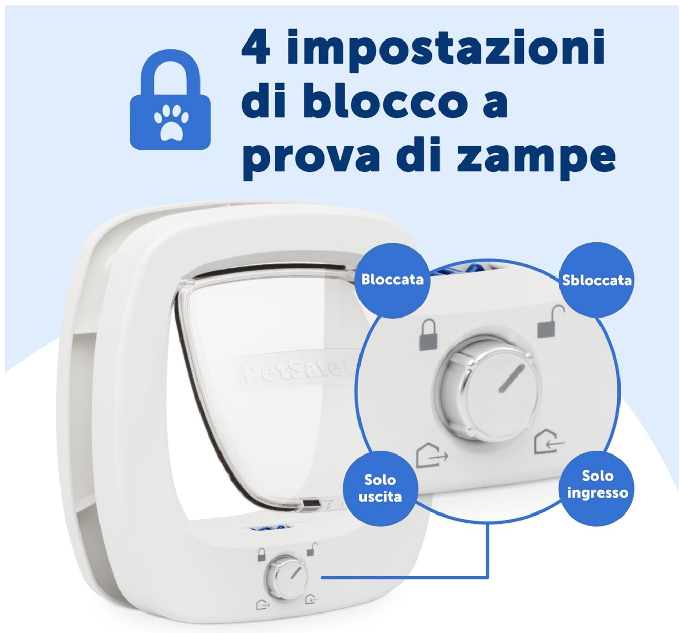
Image: A detailed diagram showing the four lock settings (locked, unlocked, entry only, exit only) on the PetSafe cat flap's Push-&-Turn knob.