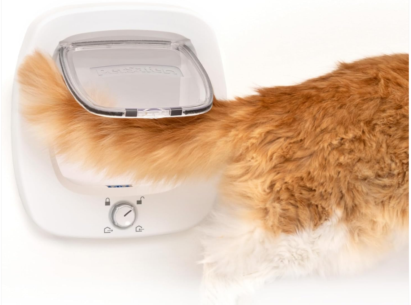
Image: A cat's tail passing through the PetSafe cat flap, illustrating the GentleClose technology that allows the flap to close gently and quietly.