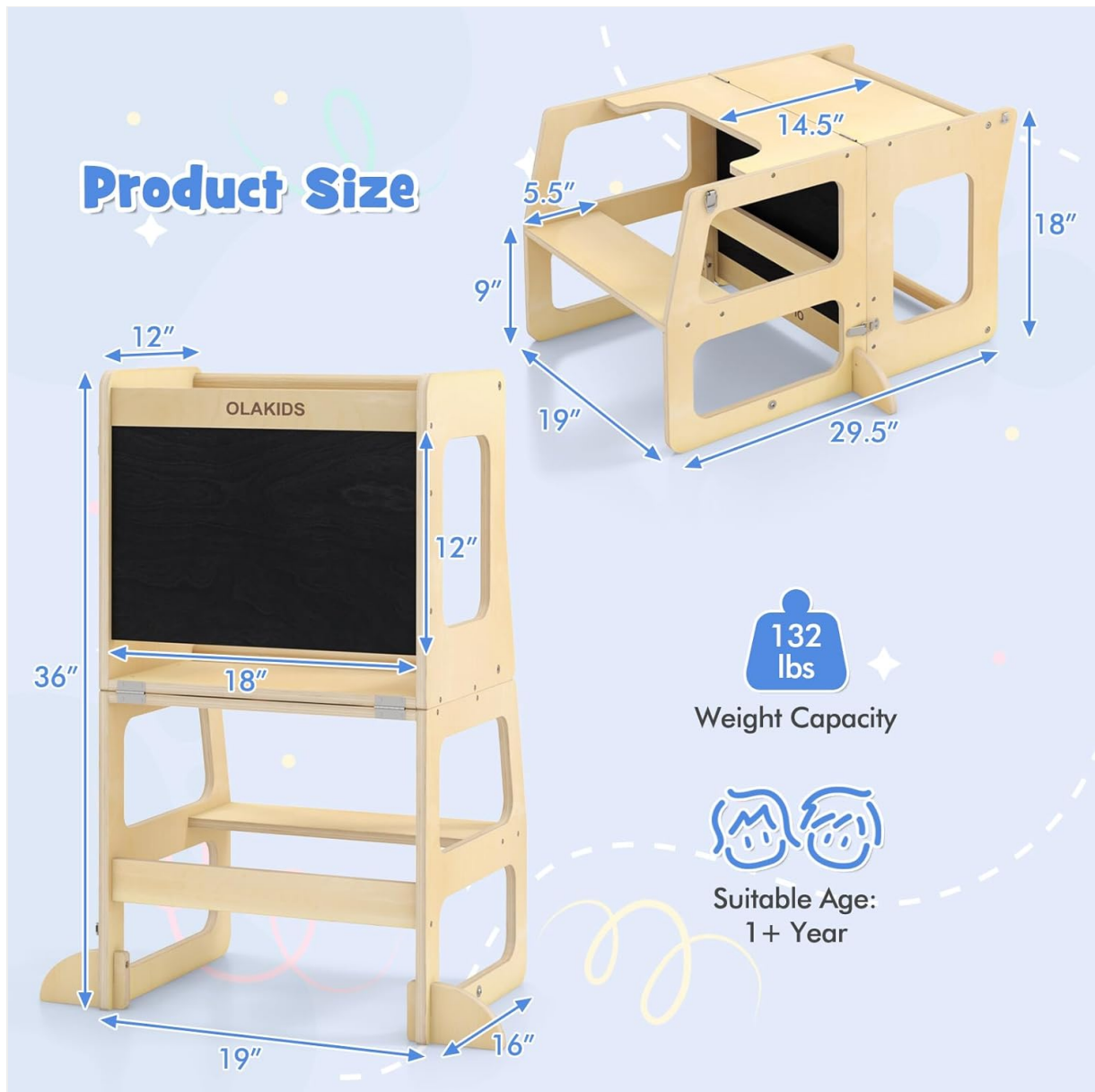
Figure 8: Product dimensions and specifications.