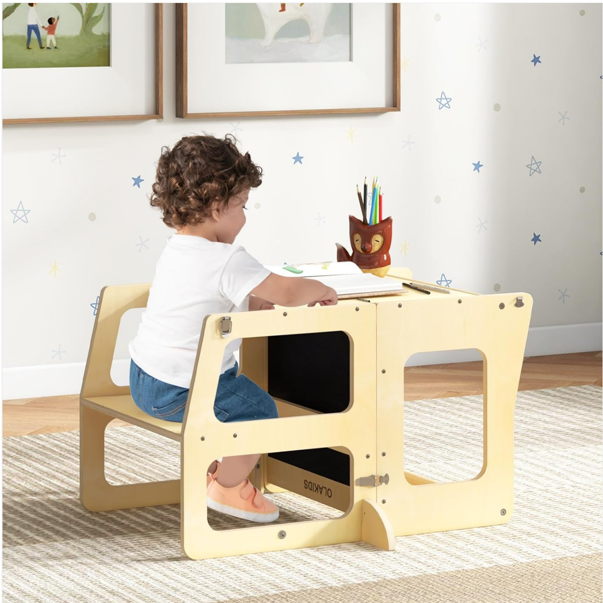
Figure 7: Child using the tower in desk mode.