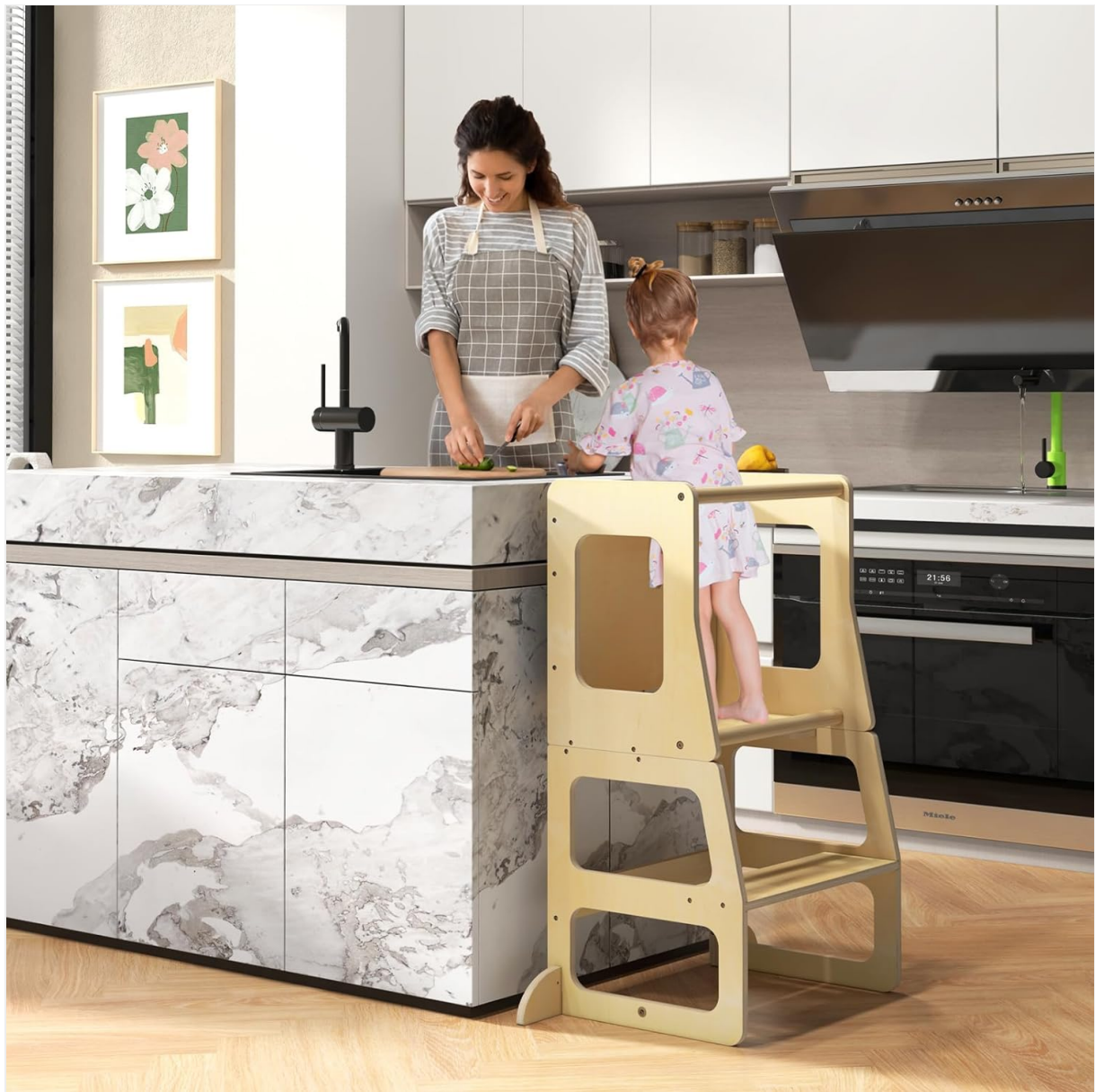
Figure 4: Toddler Tower in use as a kitchen helper.