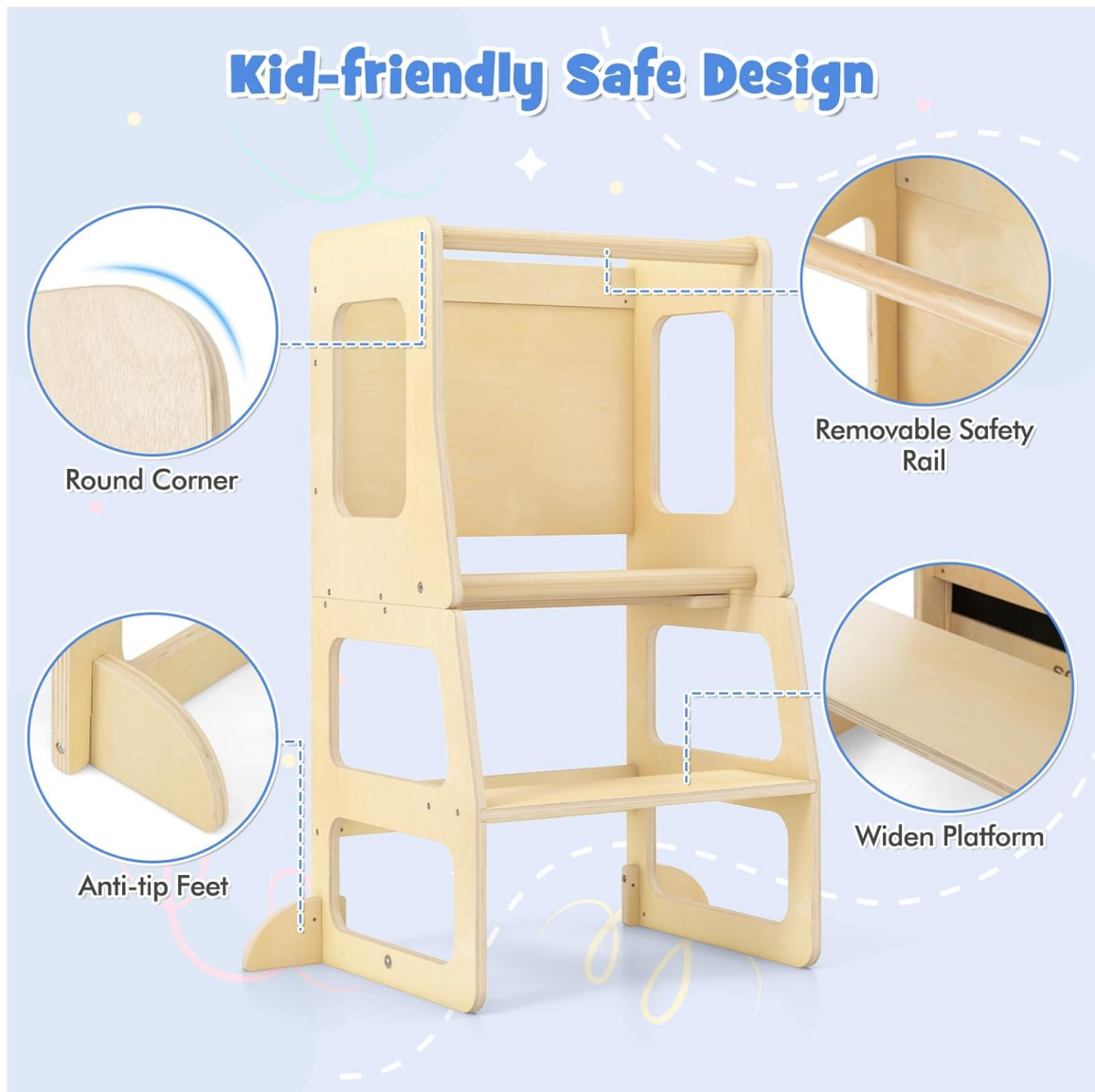
Figure 3: Key safety features including anti-tip feet.