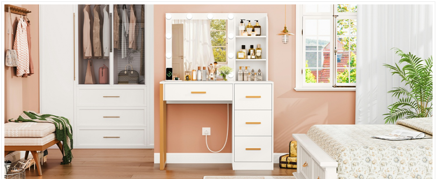
Figure 4: Visual guide to the three lighting modes (Cold White, Warm White, Warm Yellow) and brightness adjustment.