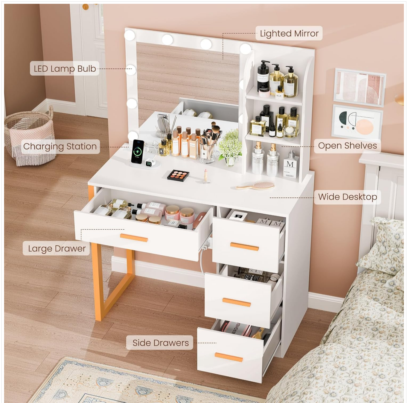
Figure 1: Exploded view of vanity desk components, showing the main desk, drawers, mirror, and shelves.