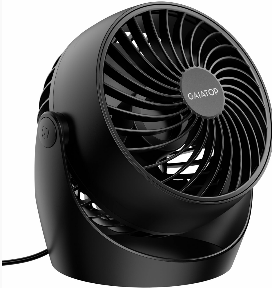
Figure 4.1: Front view of the Gaiatop AF-01 Desk Fan.