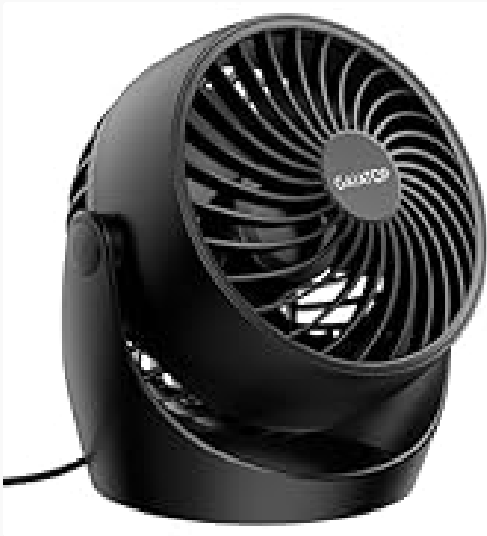
Figure 3.1: Packaging contents including the fan, AC plug, and user manual.