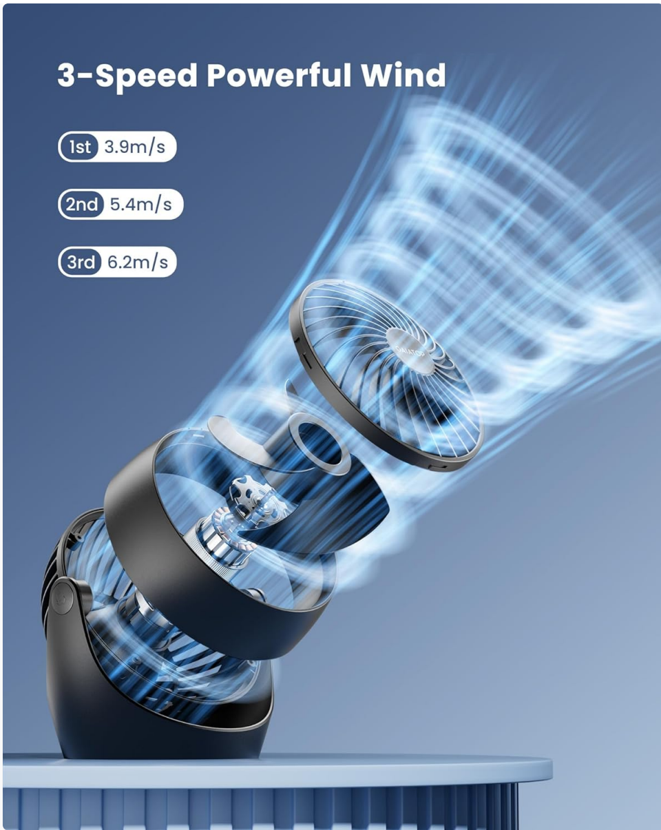
Figure 6.1: Illustration of the three fan speeds and their wind velocity.