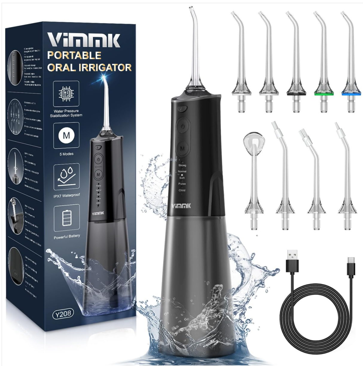
Figure 1.1: Vinnik Cordless Water Dental Flosser (Model Y208) and included accessories.