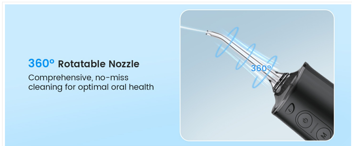
Figure 5.1: Simple steps for effective use of the Vimmk Water Flosser.