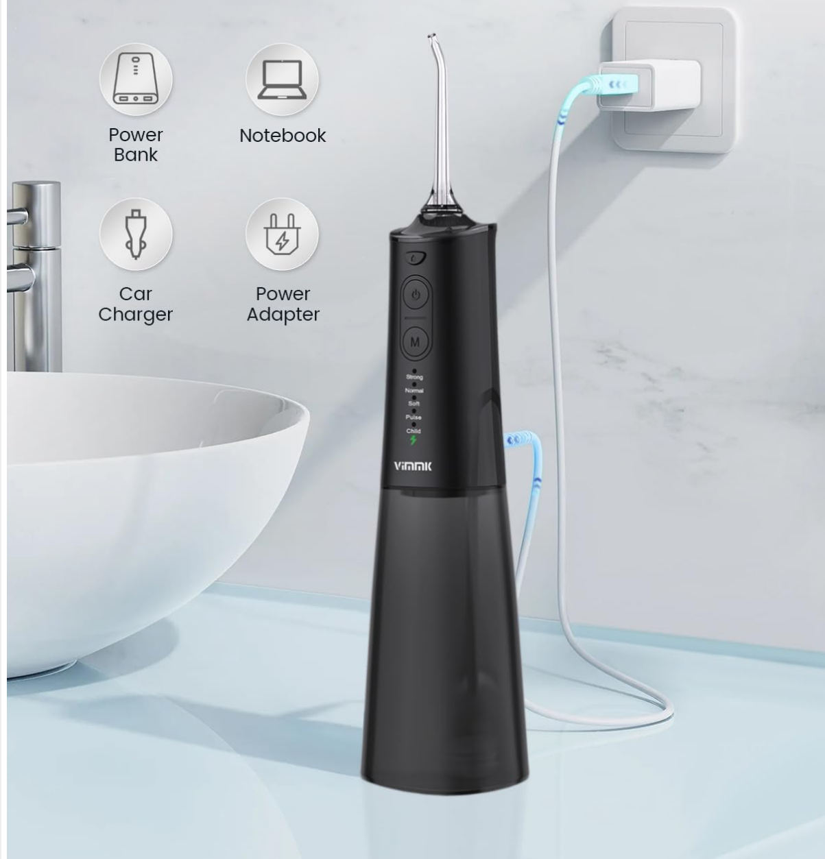
Figure 4.1: Charging the Vimmk Water Flosser. A full charge provides up to 21 days of use.