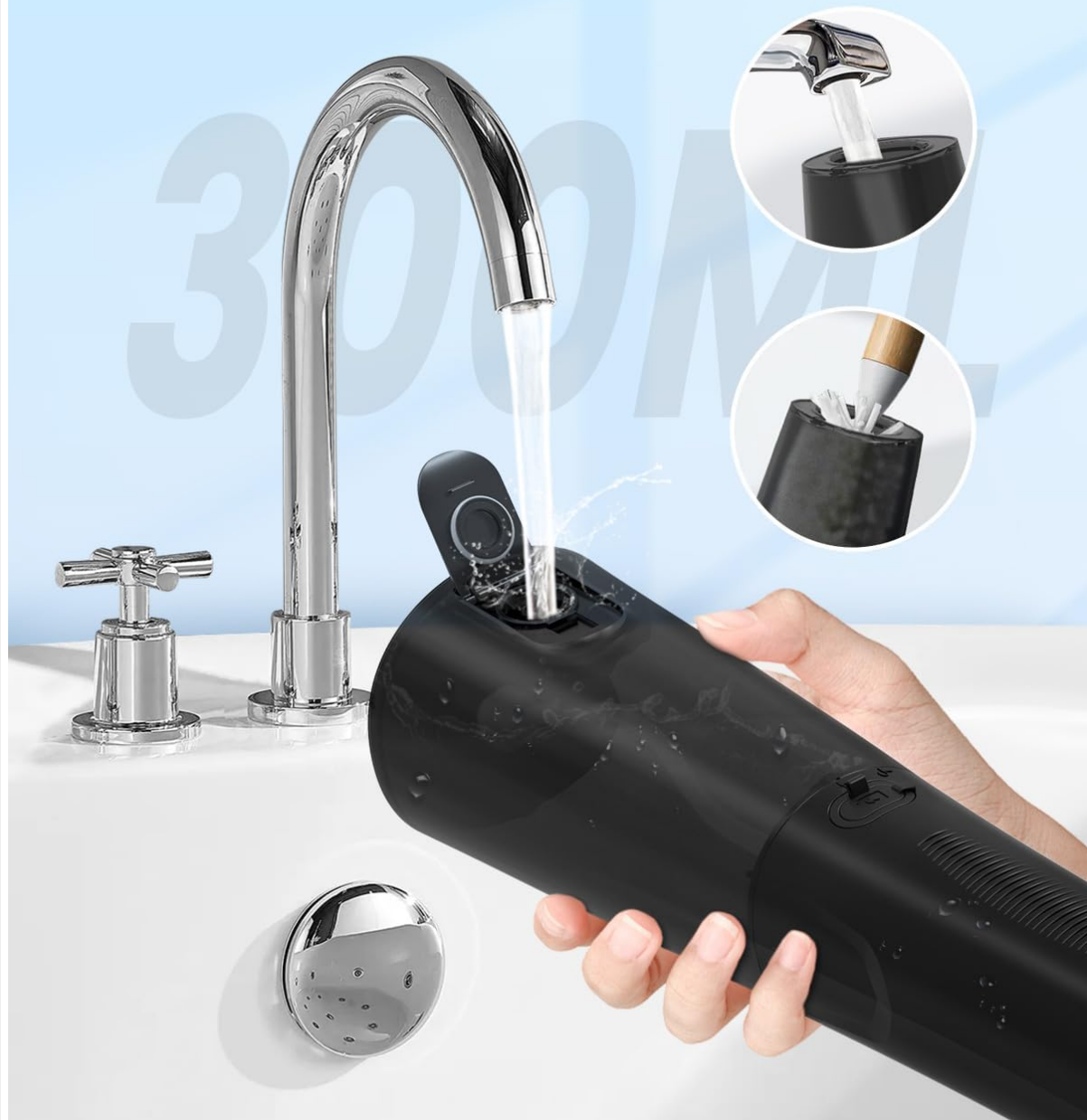
Figure 4.2: The 300ML detachable water tank is easy to fill and clean.