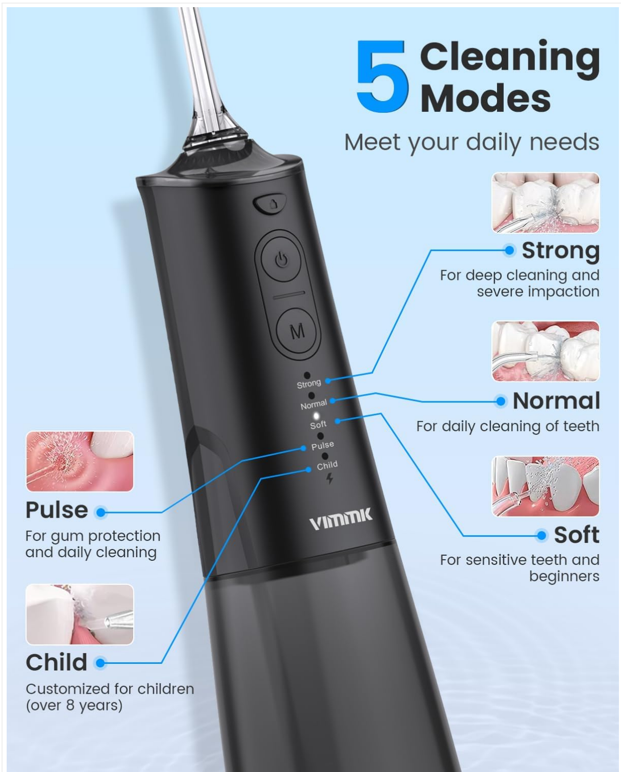
Figure 2.2: Five distinct cleaning modes cater to different oral care needs, from deep cleaning to sensitive gums.