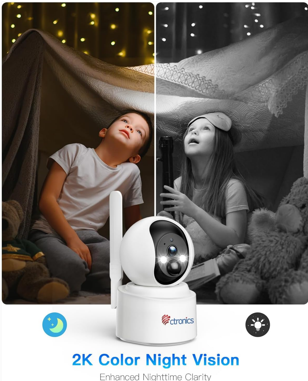
Image 6.4: Enhanced 2K color night vision for clear images in darkness.