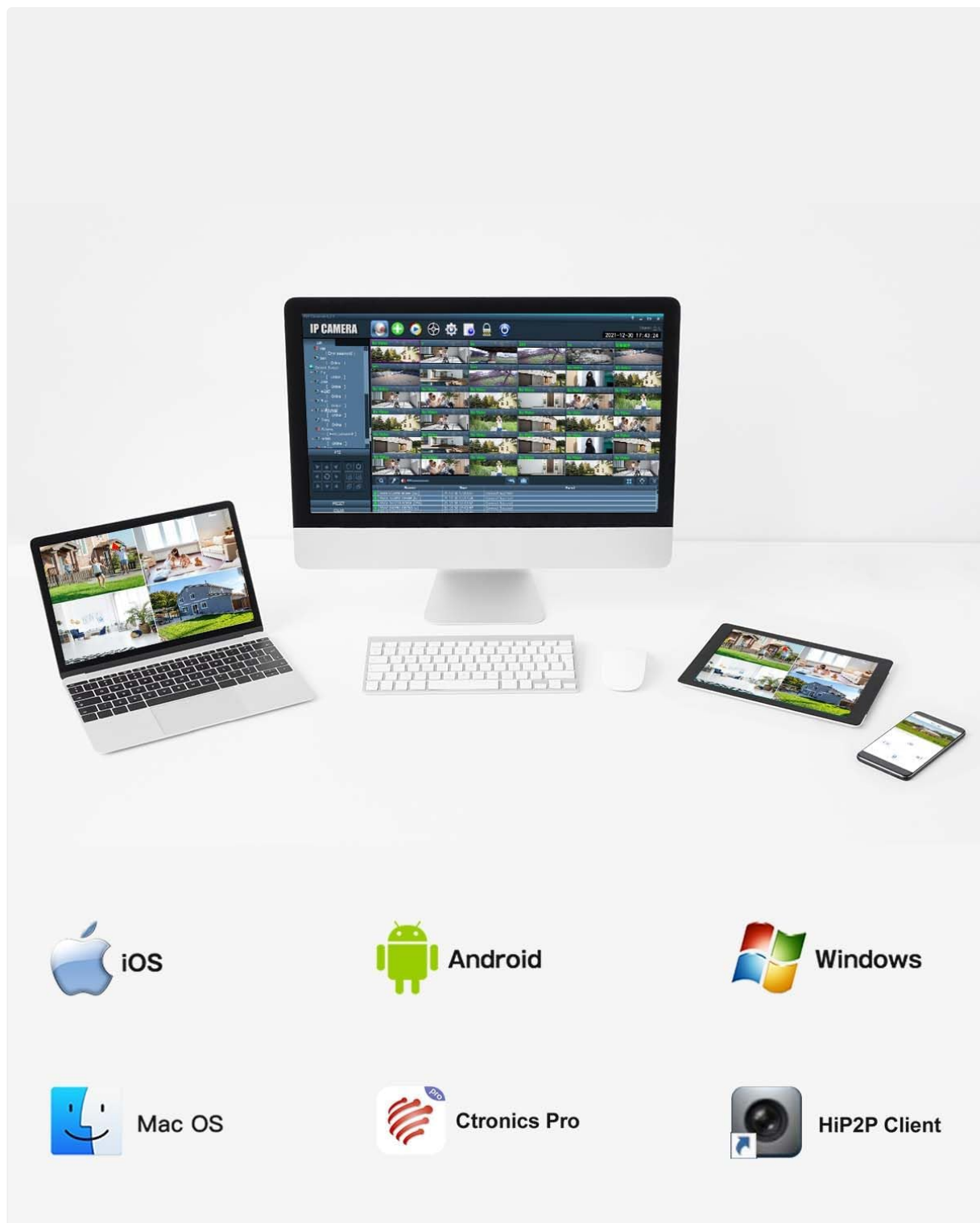
Image 6.6: Access your camera from multiple devices and operating systems.