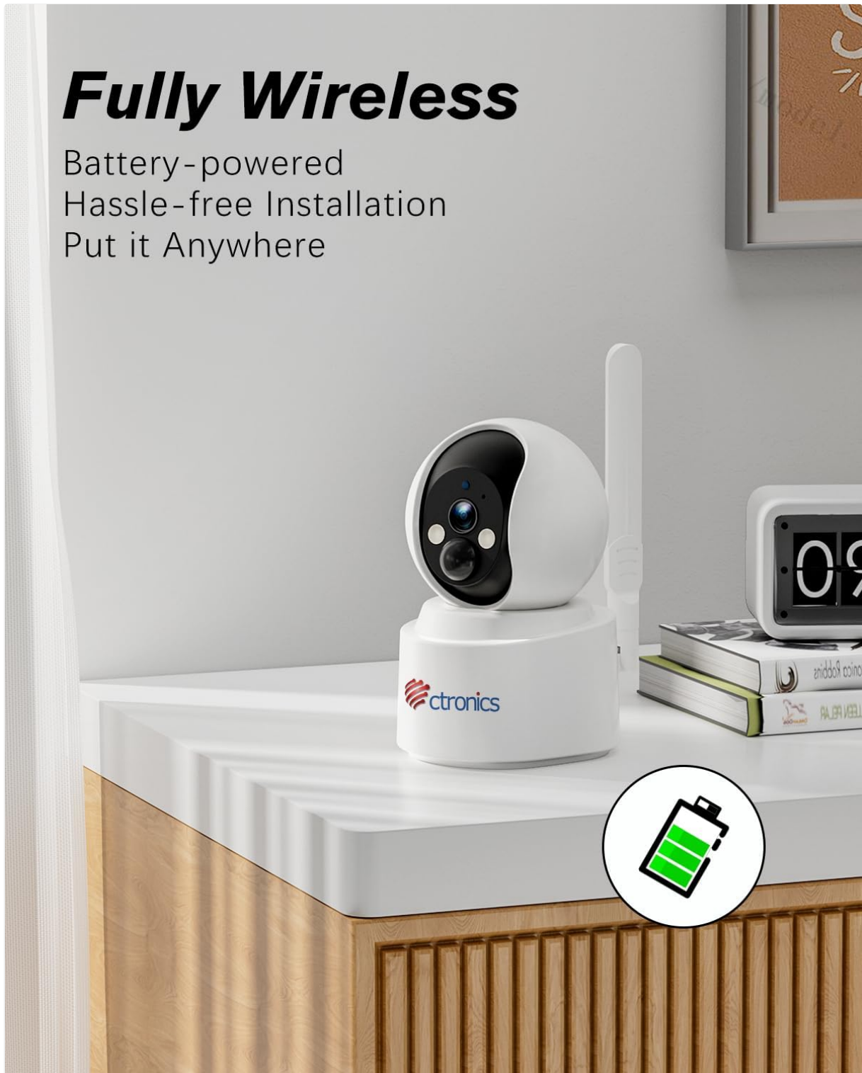
Image 5.1: The camera's fully wireless design allows flexible placement.

Battery-powered Hassle-free Installation Put it Anywhere