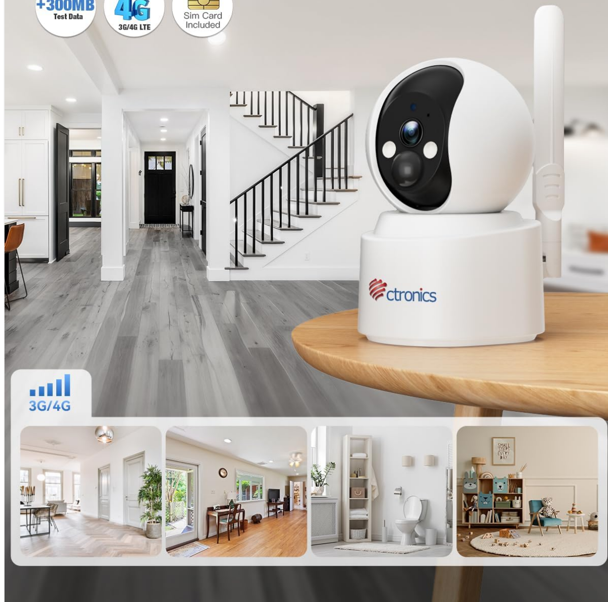
Image 5.2: The camera operates via 3G/4G LTE, eliminating the need for WiFi.