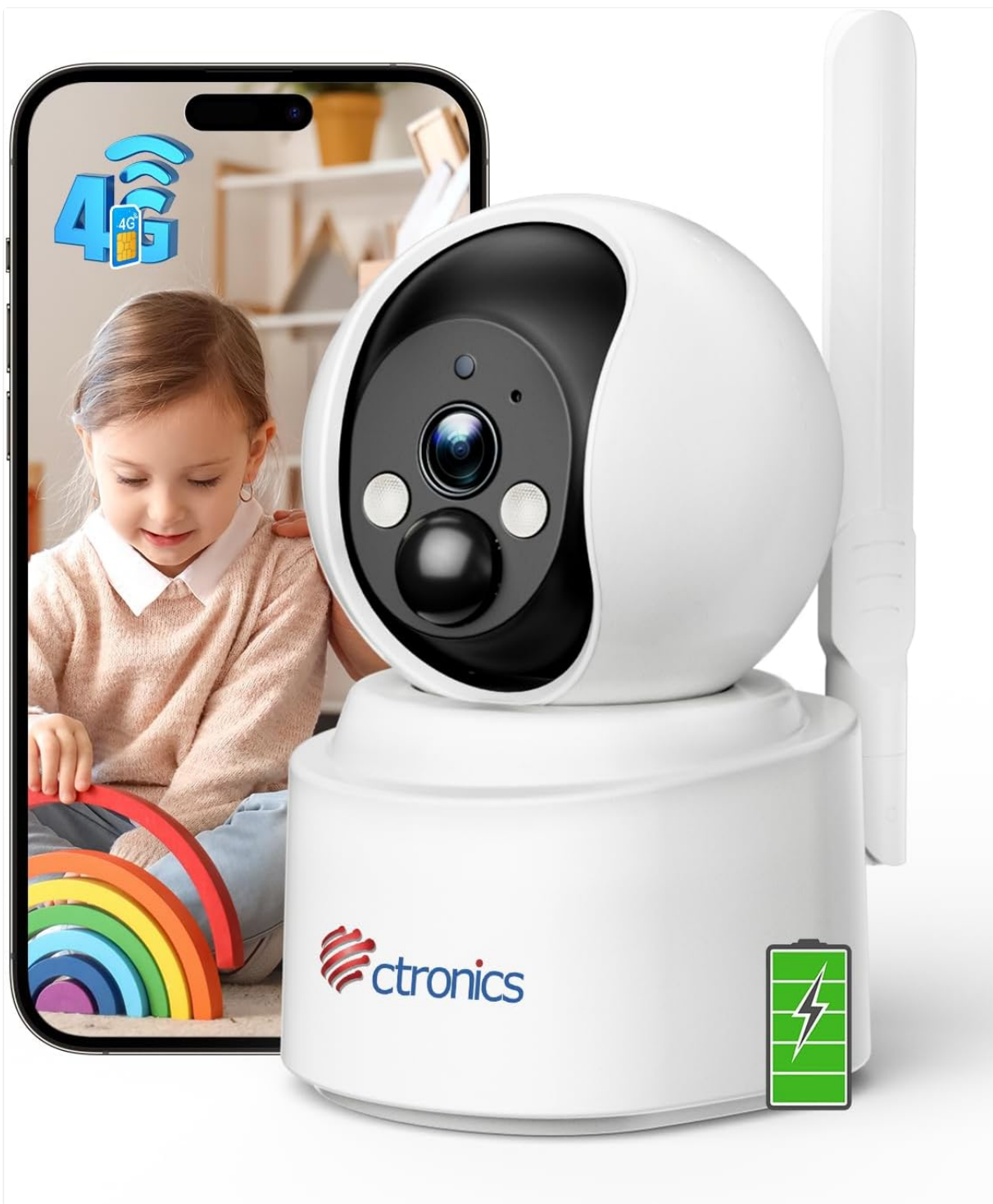
Image 1.1: Ctronics CTIPC-500C 4G LTE Battery-Powered 2K Indoor PTZ Security Camera.