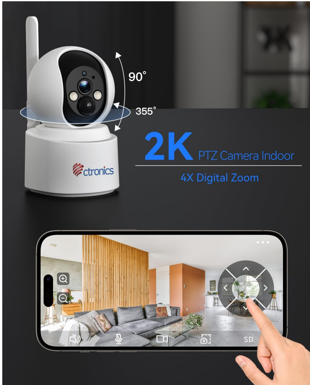
Image 6.1: PTZ controls and 4x digital zoom for comprehensive coverage.

Open the Ctronics app and select your camera to access the live view. Use the on-screen controls to pan (355° horizontally) and tilt (90° vertically) the camera lens. You can also use the 4x digital zoom feature to get a closer look.