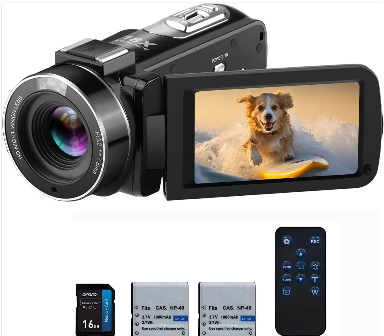
Figure 1: ORDRO B320 1080P Camcorder.