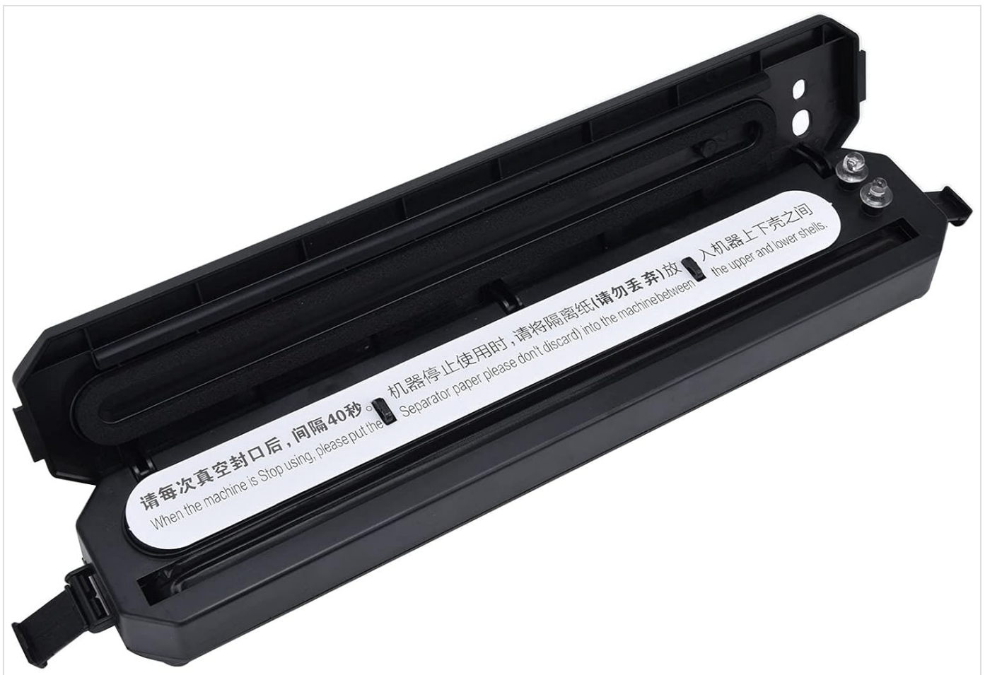
Image: The vacuum sealer with its lid open, revealing the sealing bar and the area where the vacuum bag is placed.