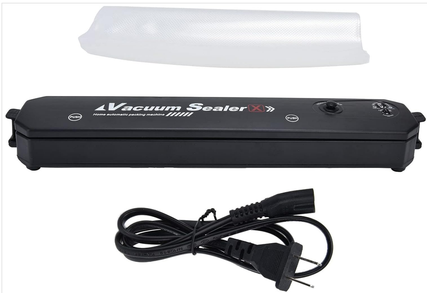
Image: The vacuum sealer machine, along with the included vacuum bags and power cord.