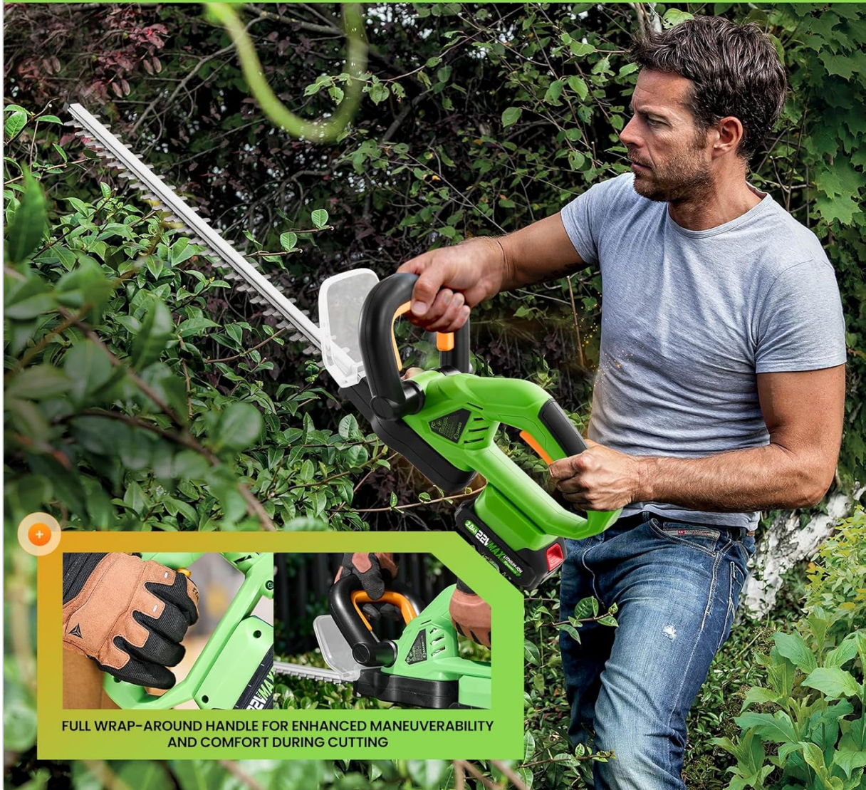
Figure 4: The lightweight and ergonomic design ensures comfortable use for extended periods.

Your browser does not support the video tag.