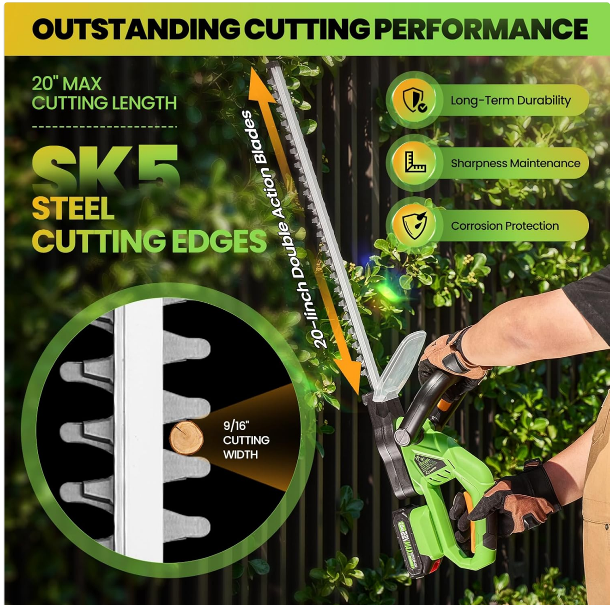
Figure 3: The 20-inch dual-action blades provide efficient cutting for branches up to 9/16 inches thick.