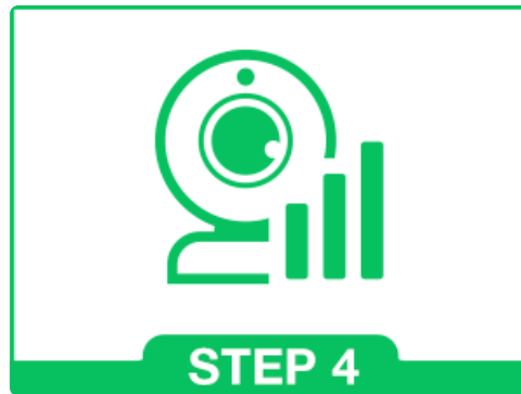
Image: Step-by-step guide for joining EIoTCLUB and managing your account via the app.