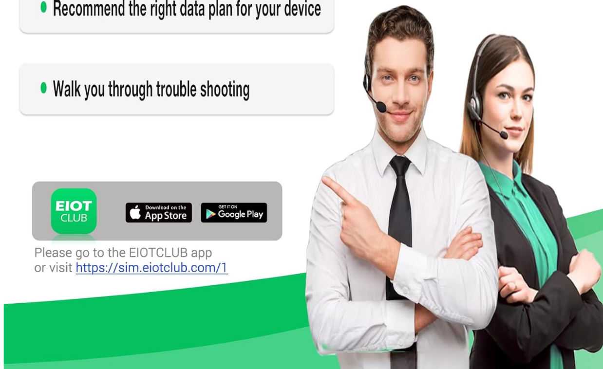
Image: EIOTCLUB support assists with usage, data plans, and troubleshooting.

Please go to the EIOTCLUB app or visit https://sim.eiotclub.com/1