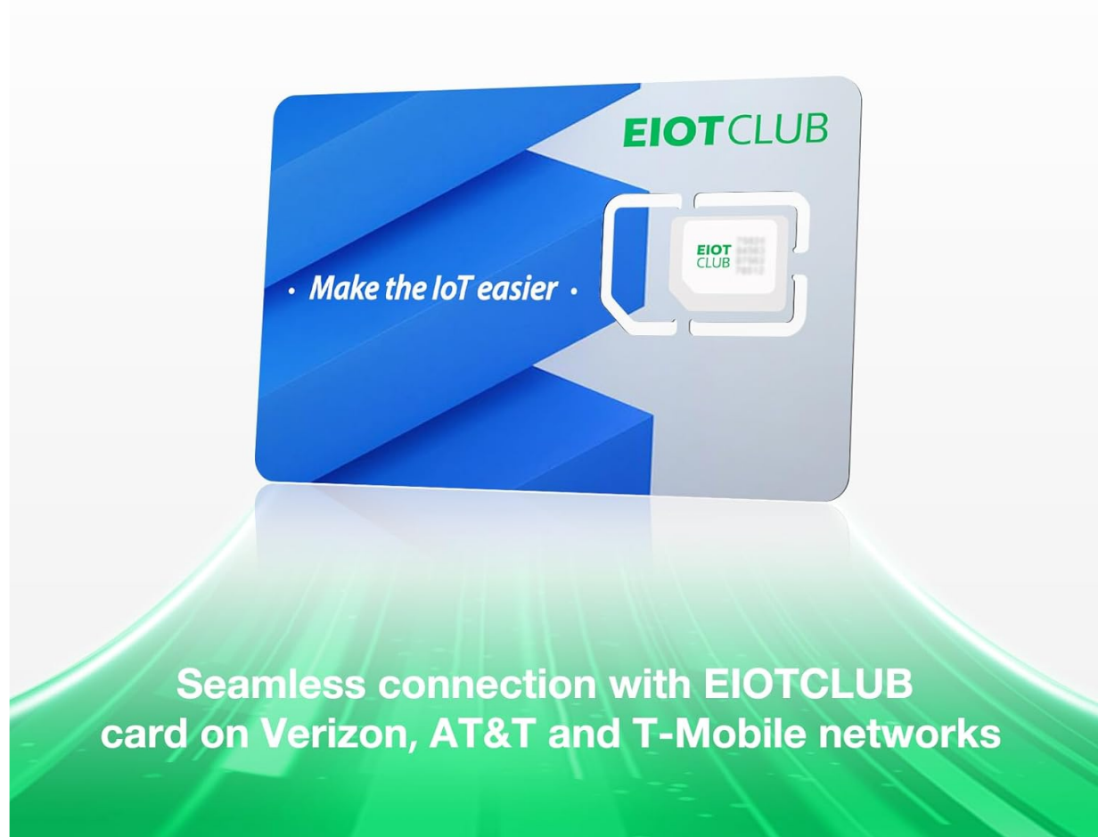
Image: The EIoTCLUB SIM card automatically selects the best network for stable connectivity.