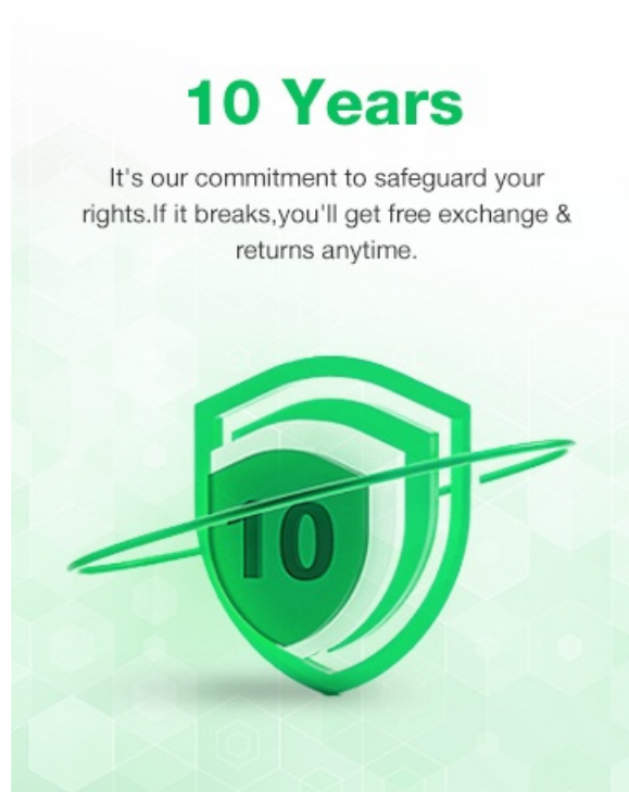
Image: EIOTCLUB's 10-year commitment for product reliability.

The EIOTCLUB SIM card comes with a 10-year warranty . This commitment ensures free exchange and returns if the product breaks, safeguarding your rights for an extended period.