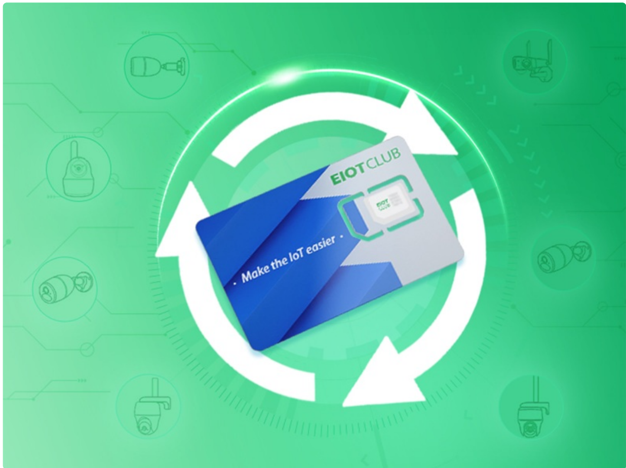
Image: The EIoTCLUB SIM card is available in Standard, Micro, and Nano sizes for universal compatibility. Video: An informational video explaining the features and benefits of the EIoTCLUB Triple Play SIM card.