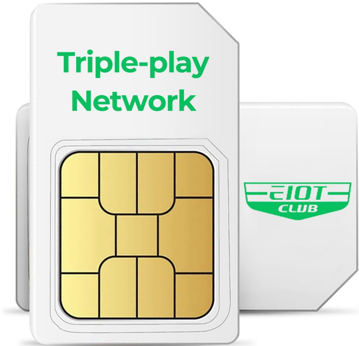
Image: EIoTCLUB Triple Play Data SIM Card packaging, showing the SIM card and its various sizes.