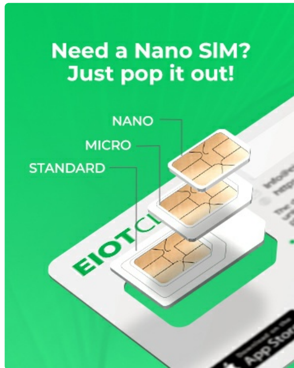
Image: The triple-cut SIM card can be broken down into Standard, Micro, or Nano sizes to fit various devices.

Video: A demonstration of unboxing and inserting the EIoTCLUB SIM card into a device.