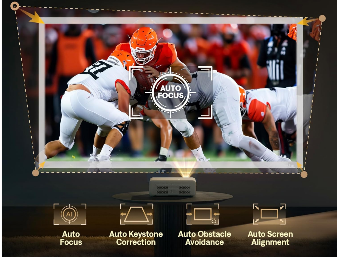
Figure 3.3: Automatic screen adjustment features of the EAZZE D1.