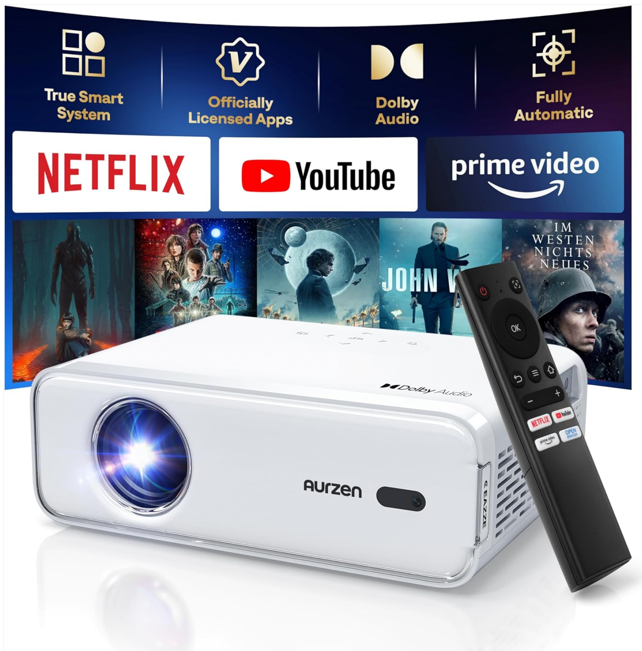
Figure 2.1: Included accessories with the Aurzen EAZZE D1 Projector.