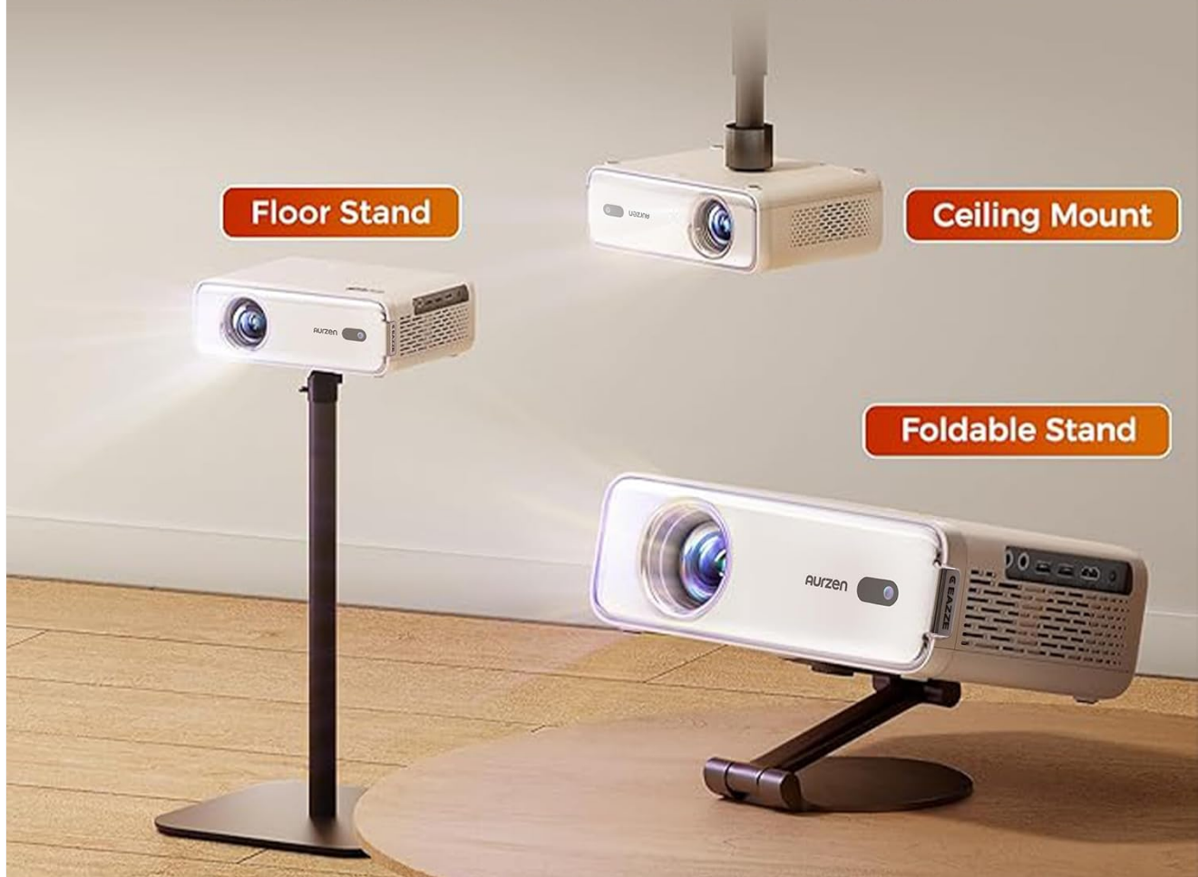
Figure 3.1: Flexible placement options for the Aurzen EAZZE D1 Projector.