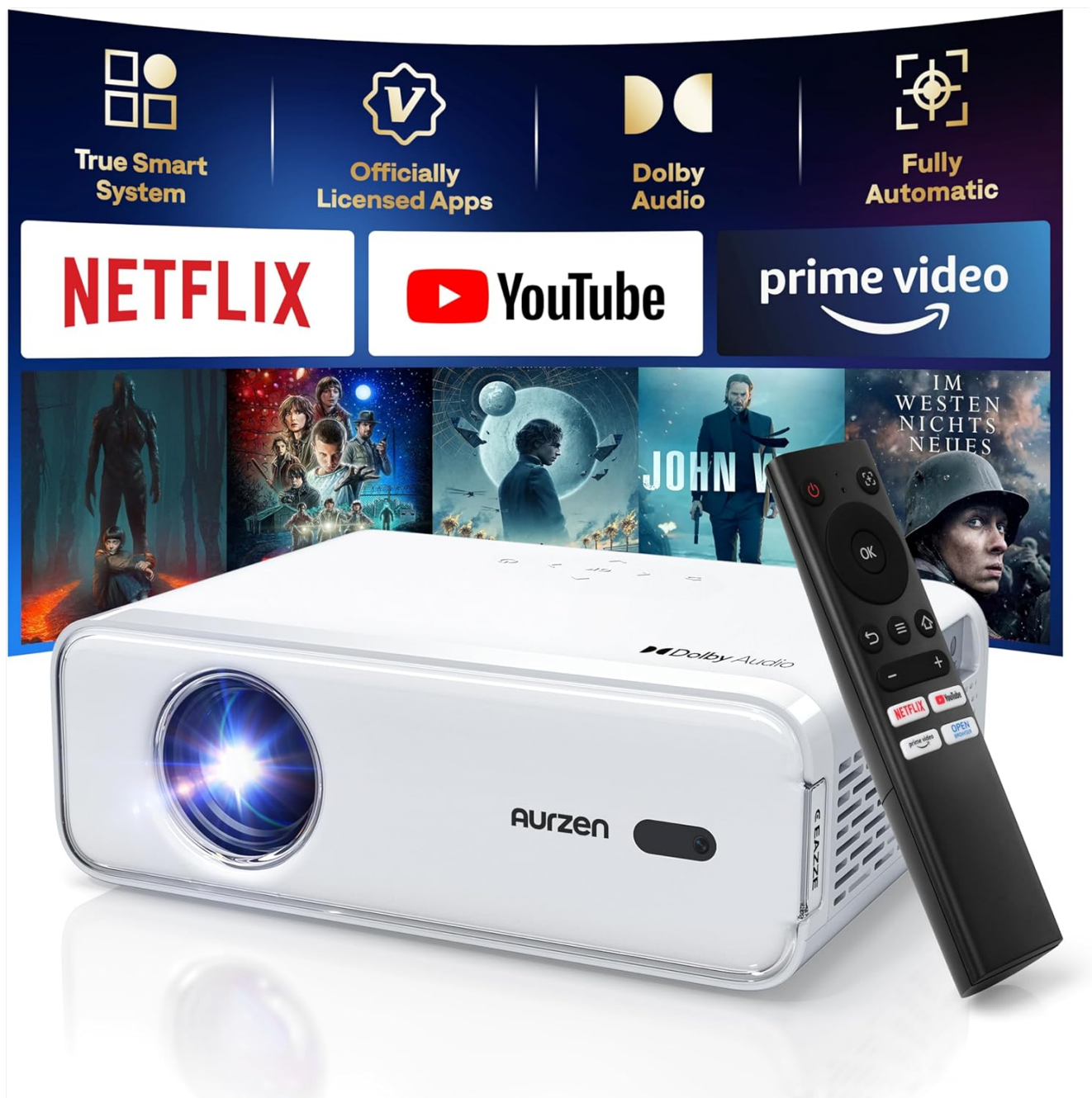
Figure 3.2: Power and connectivity ports on the Aurzen EAZZE D1 Projector.