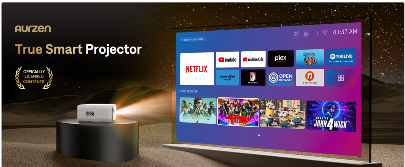
Figure 4.1: Smart TV OS interface with licensed streaming apps.