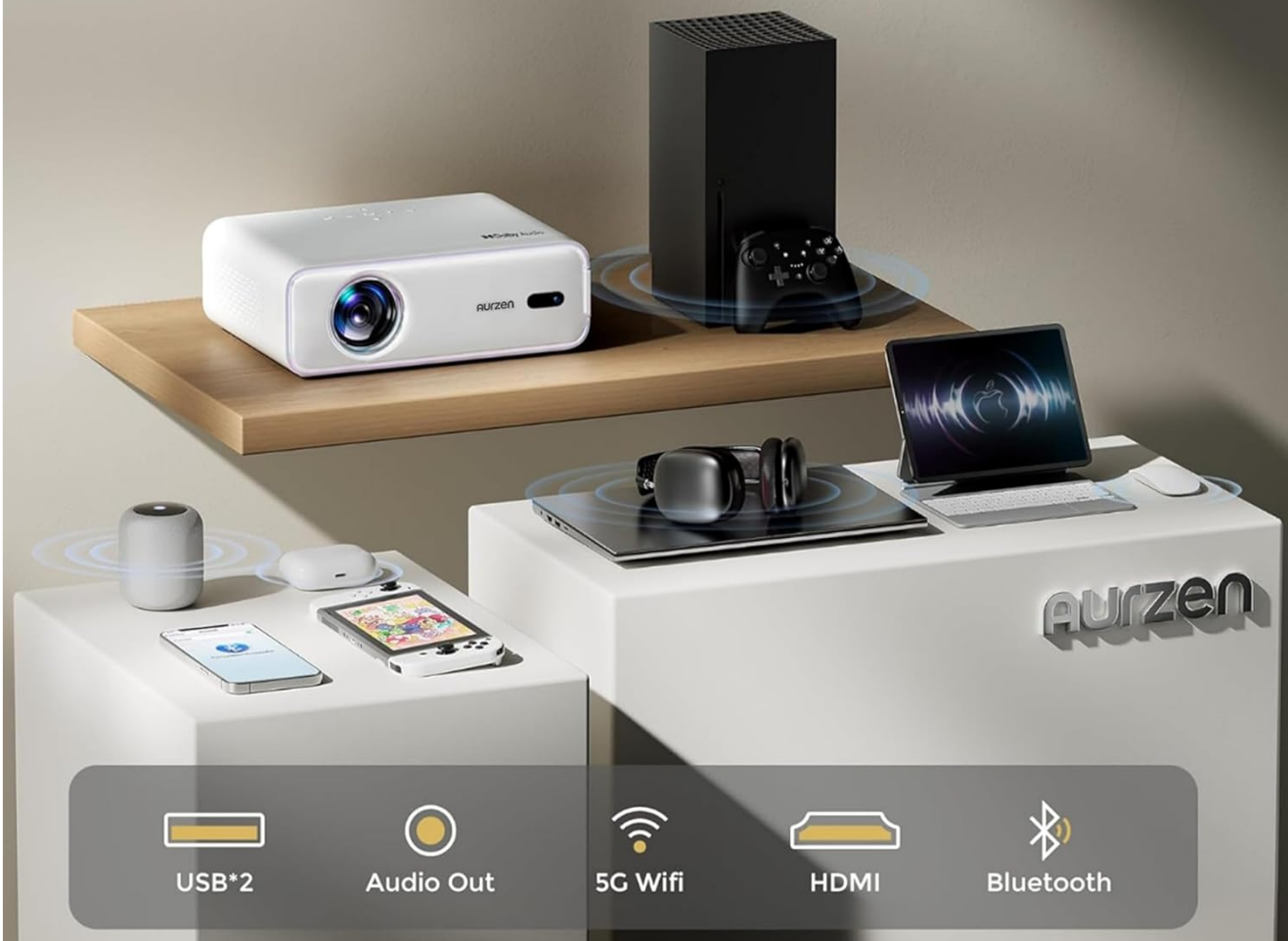
Figure 4.2: Connectivity options for external devices.