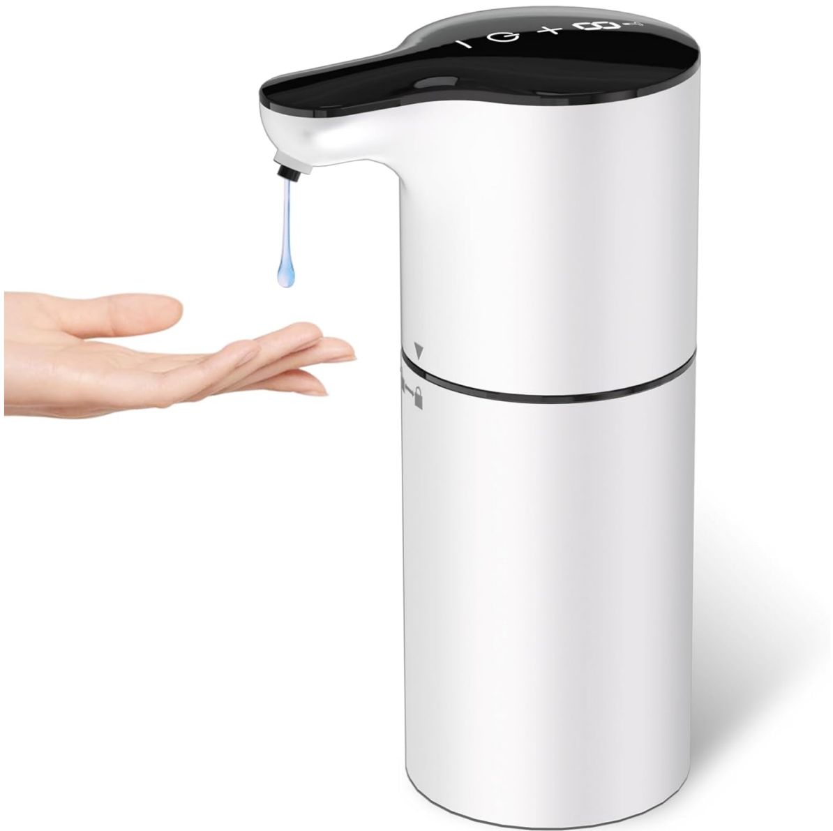
Figure 1: YIKHOM Automatic Liquid Soap Dispenser (White Model)