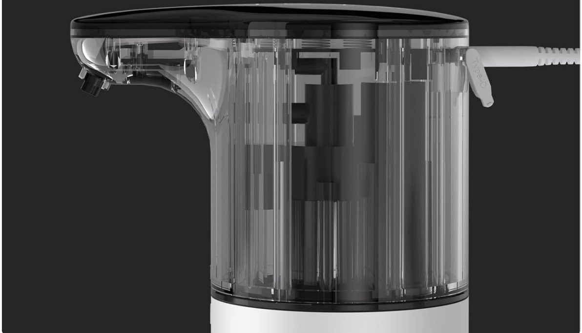
Figure 2: USB-C Charging Port