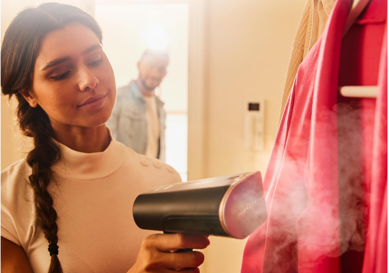
Figure 4: Illustrates the FastSteam technology, providing a continuous and powerful steam supply for quick and easy de-wrinkling.

La technologie de base exclusive fournit un apport continu de vapeur puissante pour un défroissage rapide et facile.