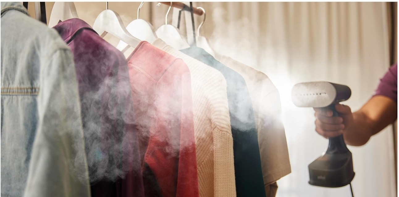
Figure 3: Demonstrates the steamer in use, highlighting its quick heat-up time and continuous steam output for efficient wrinkle removal.