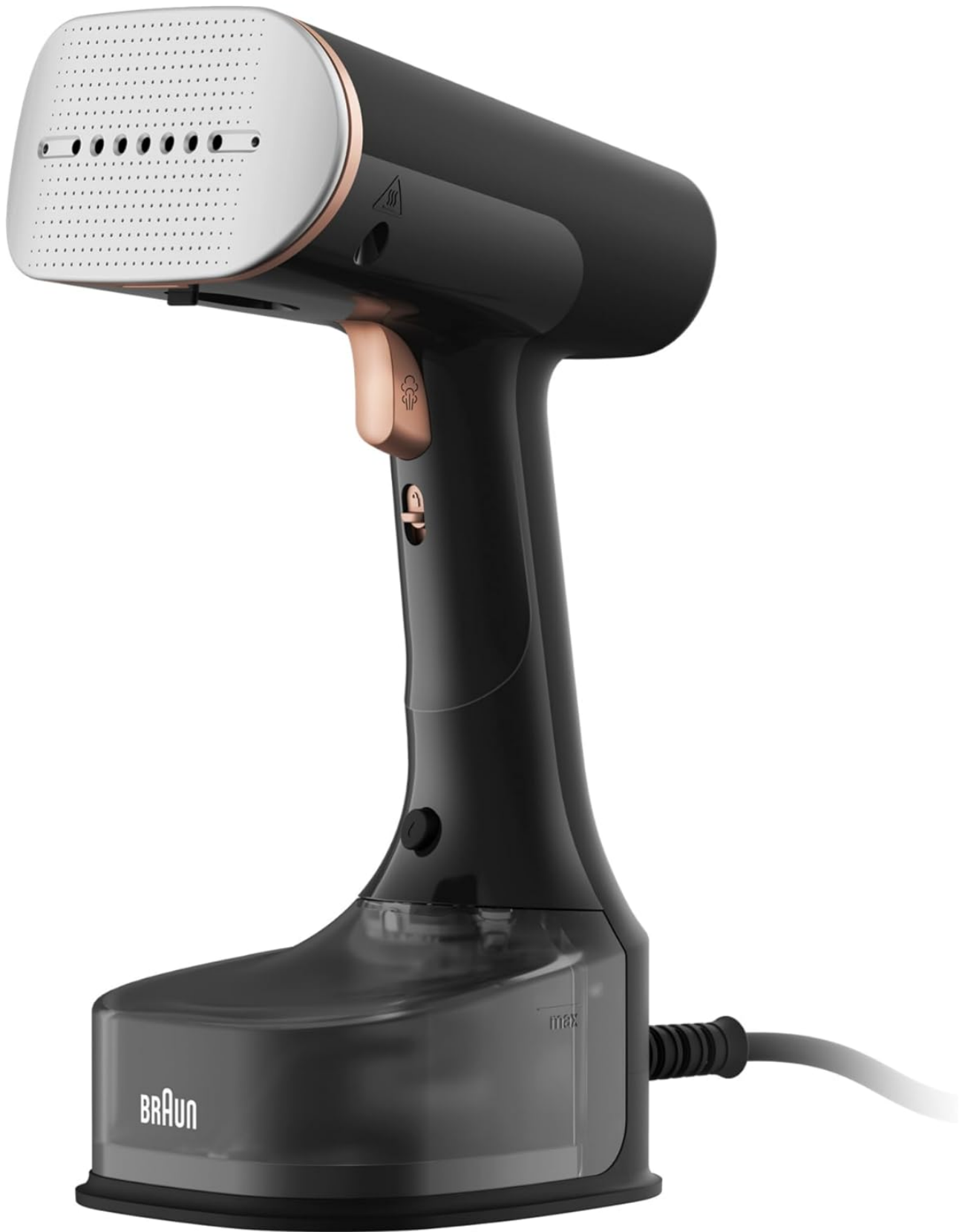
Figure 1: Front view of the Braun QuickStyle 7 GS7077BK vertical steamer, showcasing its sleek black design with rose gold accents, steam nozzle, and water tank.