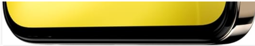
Image: Side view of the nubia V60, illustrating the location of the SIM card tray and physical buttons.