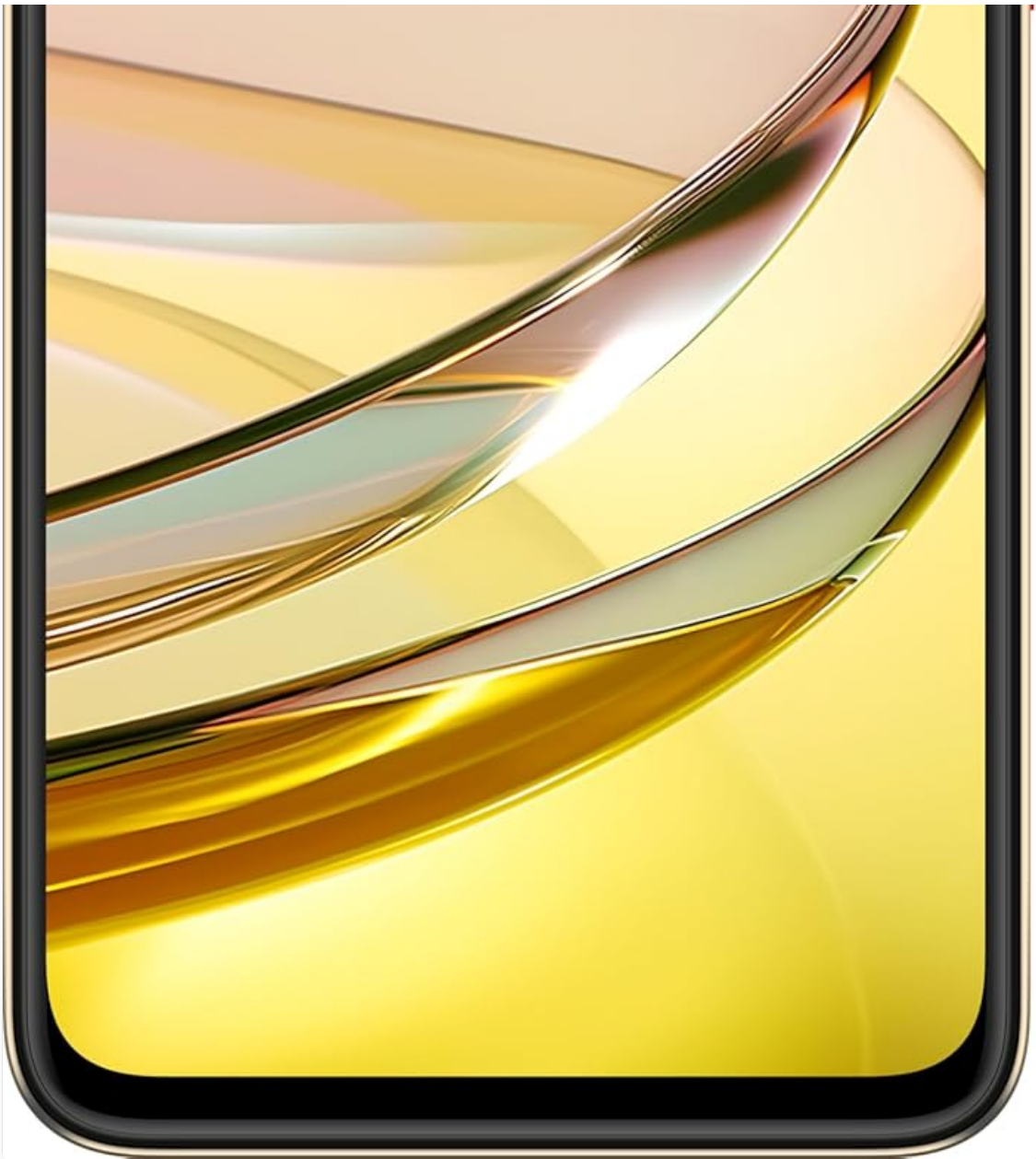
Image: Front view of the nubia V60, showcasing its 6.72-inch FHD+ display.