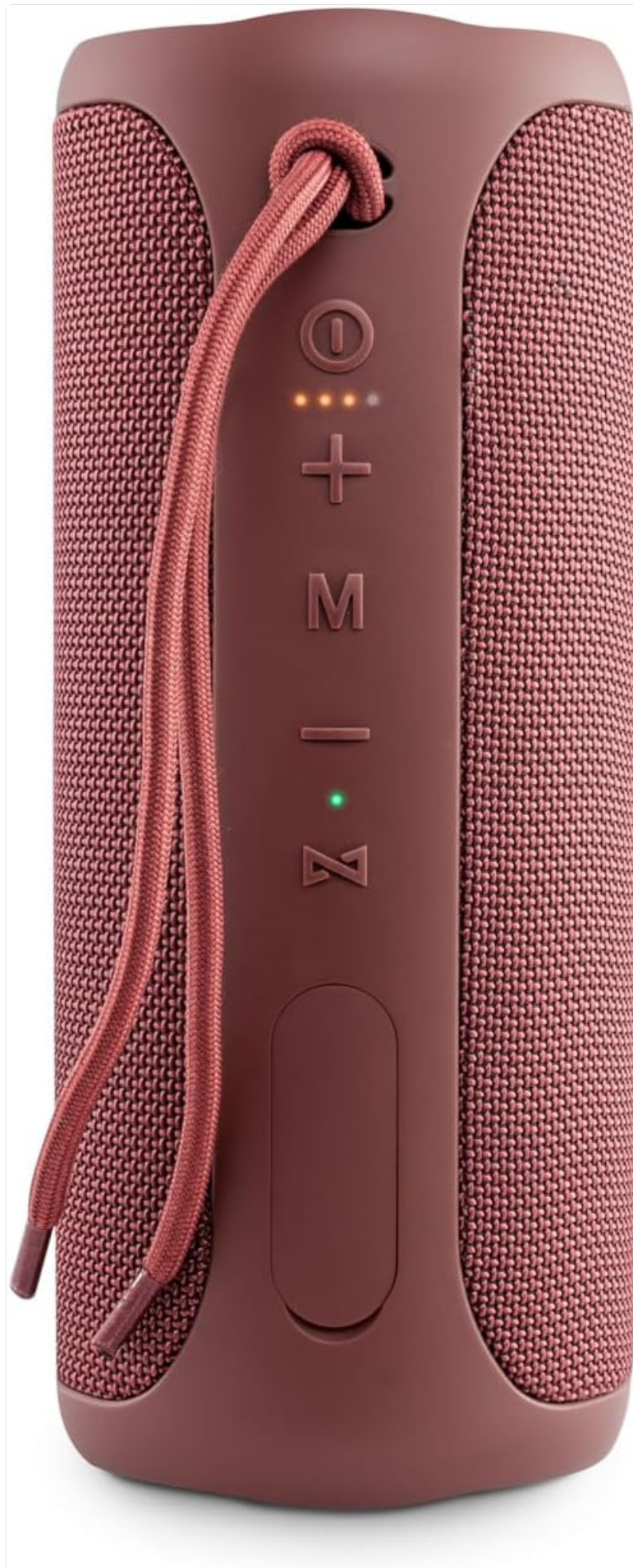
Figure 2: Detailed view of the control panel on the side of the Vieta Pro Upper 3 speaker. From top to bottom, the buttons are: Power, Volume Up (+), Volume Down (-), Mode (M), Play/Pause/Call (▶/■), and a light indicator. A carrying strap is