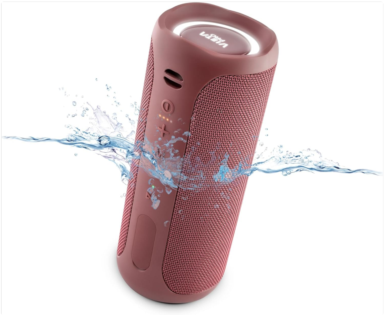
Figure 1: Vieta Pro Upper 3 speaker demonstrating its IPX7 waterproof capability with water splashing on it. The speaker is cylindrical, dark red, with a fabric grille and control panel on the side.