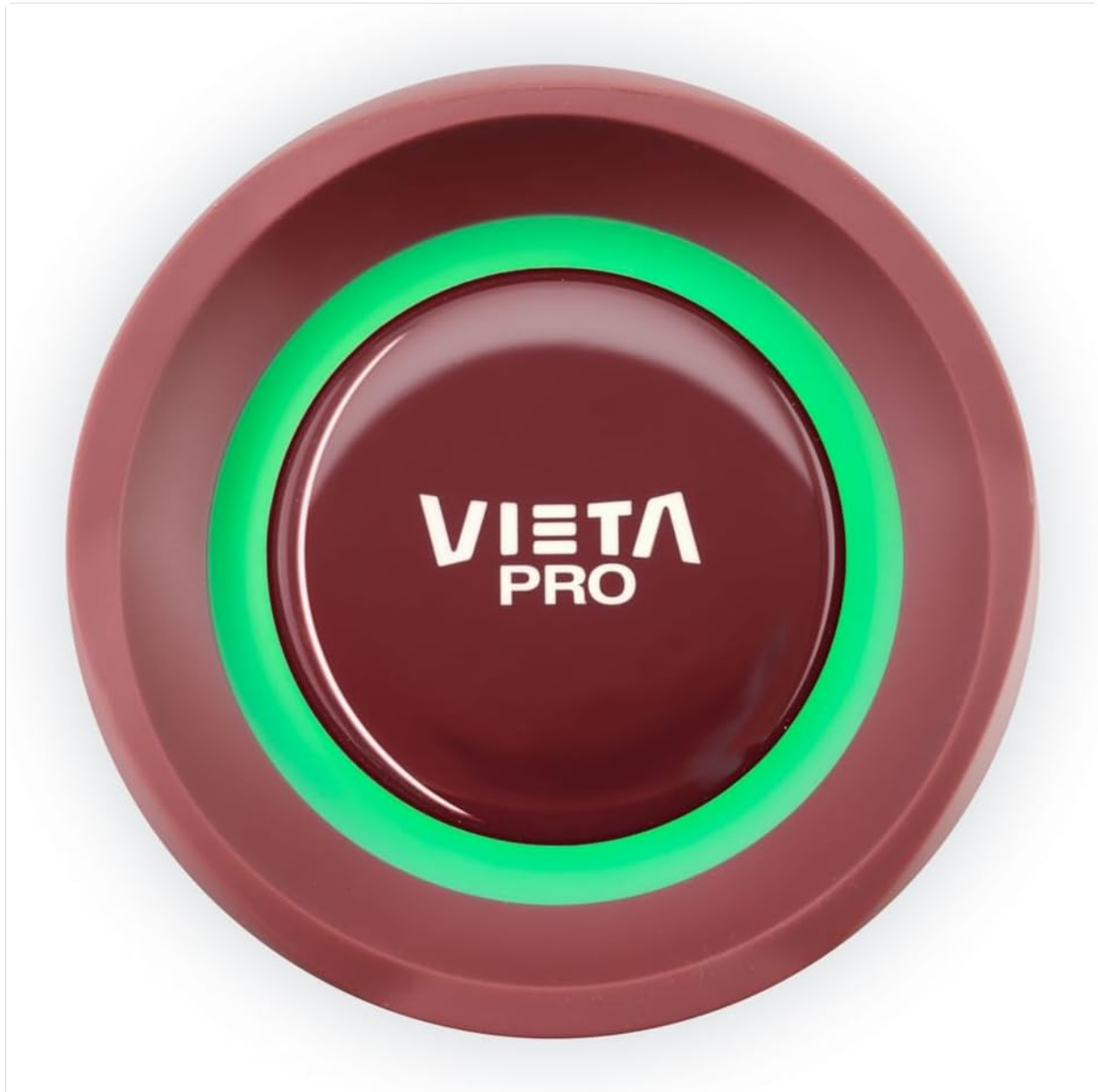
Figure 4: Top-down view of the Vieta Pro Upper 3 speaker, featuring the central Vieta Pro logo surrounded by an illuminated ring, which changes color to indicate status or light modes.