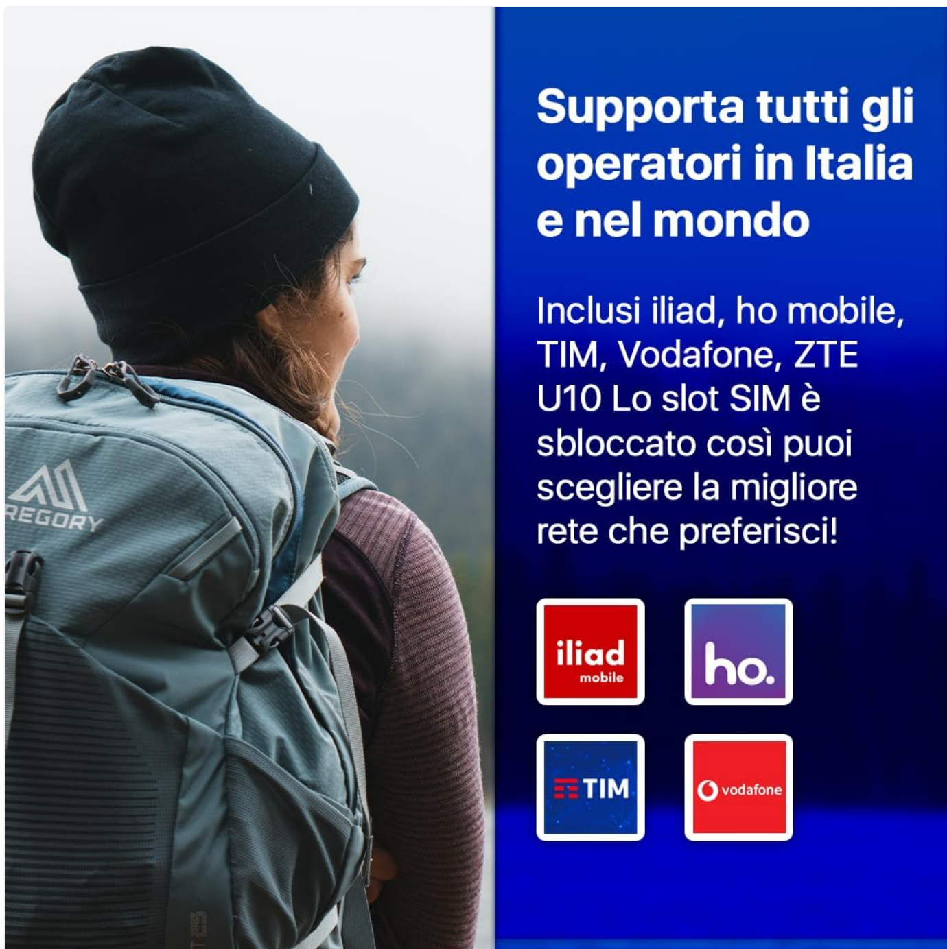
Image: This image illustrates that the ZTE U10 supports various mobile operators, including Iliad, Ho Mobile, TIM, and Vodafone, indicating its unlocked SIM slot for user flexibility.