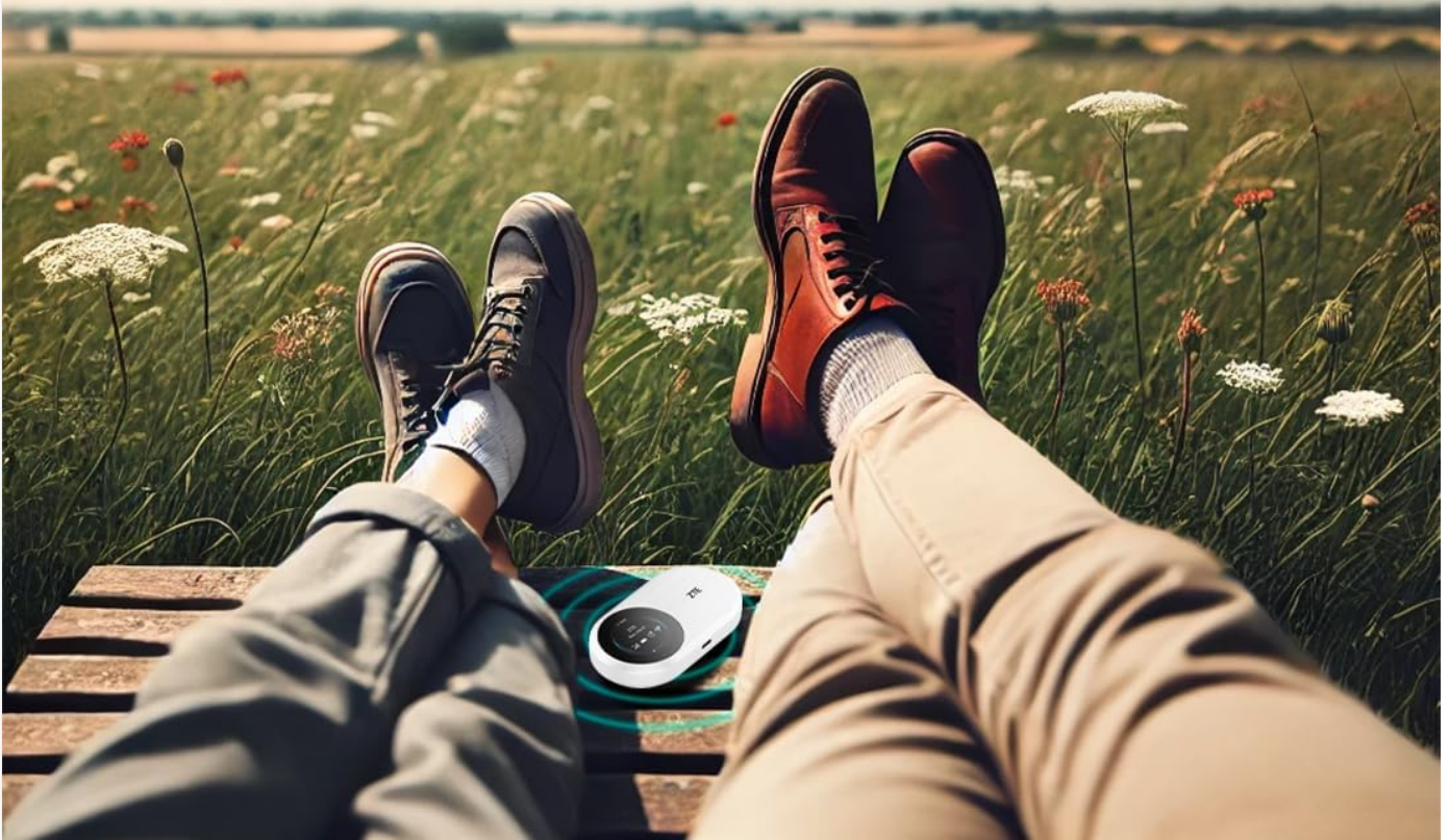
Image: This image highlights the ZTE U10's capabilities: 2.4GHz frequency, speeds up to 287Mbps, and support for connecting up to 32 devices. It shows two people relaxing in a field with the device between them, symbolizing portable connectivity.