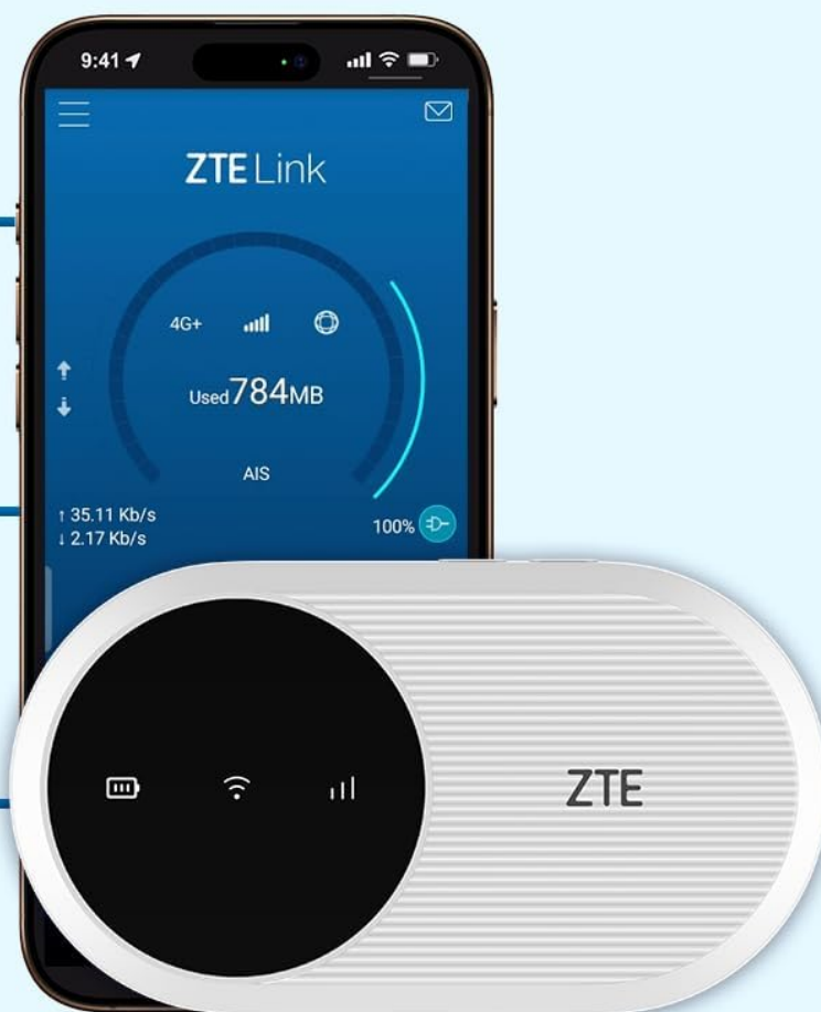
Image: A smartphone screen displaying the ZTELink app interface, showing network management, security settings, and remote control options for the ZTE U10 device. The ZTE U10 device is also shown next to the phone.

Controllo remoto della rete per una facile gestione