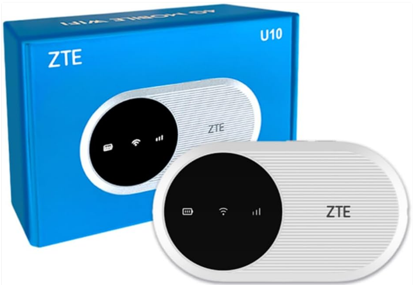
Image: The ZTE U10 Mobile Wi-Fi device, a compact white oval-shaped device, is shown next to its blue product box. The device has a

Thank you for choosing the ZTE U10 Mobile Wi-Fi device. This portable hotspot provides high-speed Wi-Fi 6 and 4G LTE connectivity, allowing you to stay connected on the go. It supports up to 32 devices simultaneously and features a long-lasting 2000 mAh battery. This manual provides essential information for setting up, operating, maintaining, and troubleshooting your ZTE U10 device.