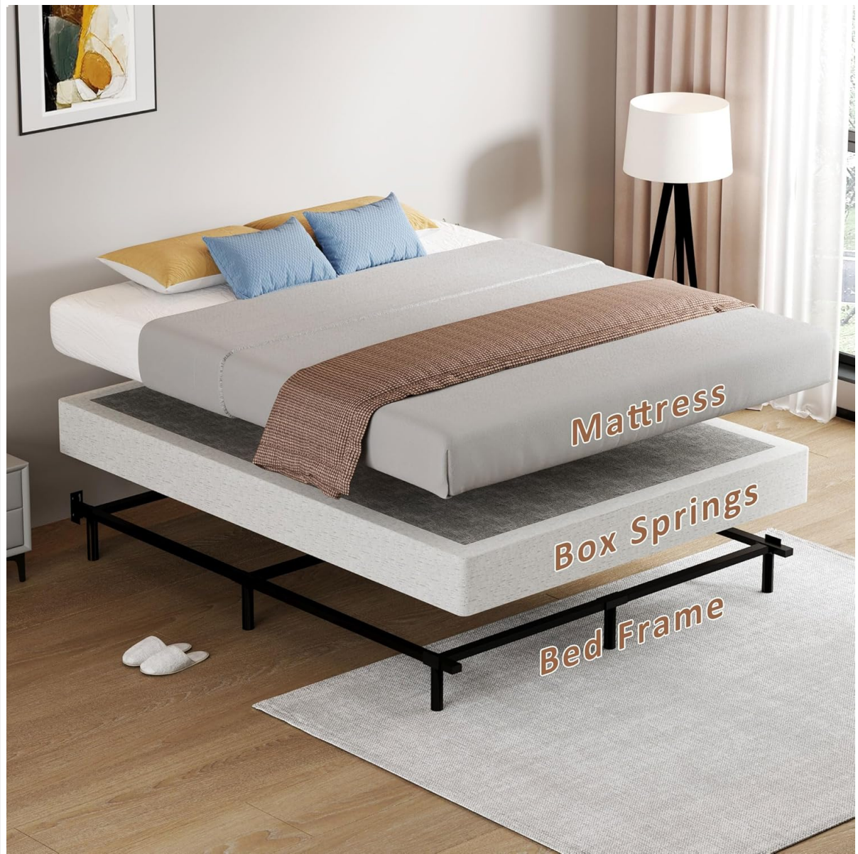
Image: Illustration of the proper layering for a bed setup: bed frame, box spring, and mattress.