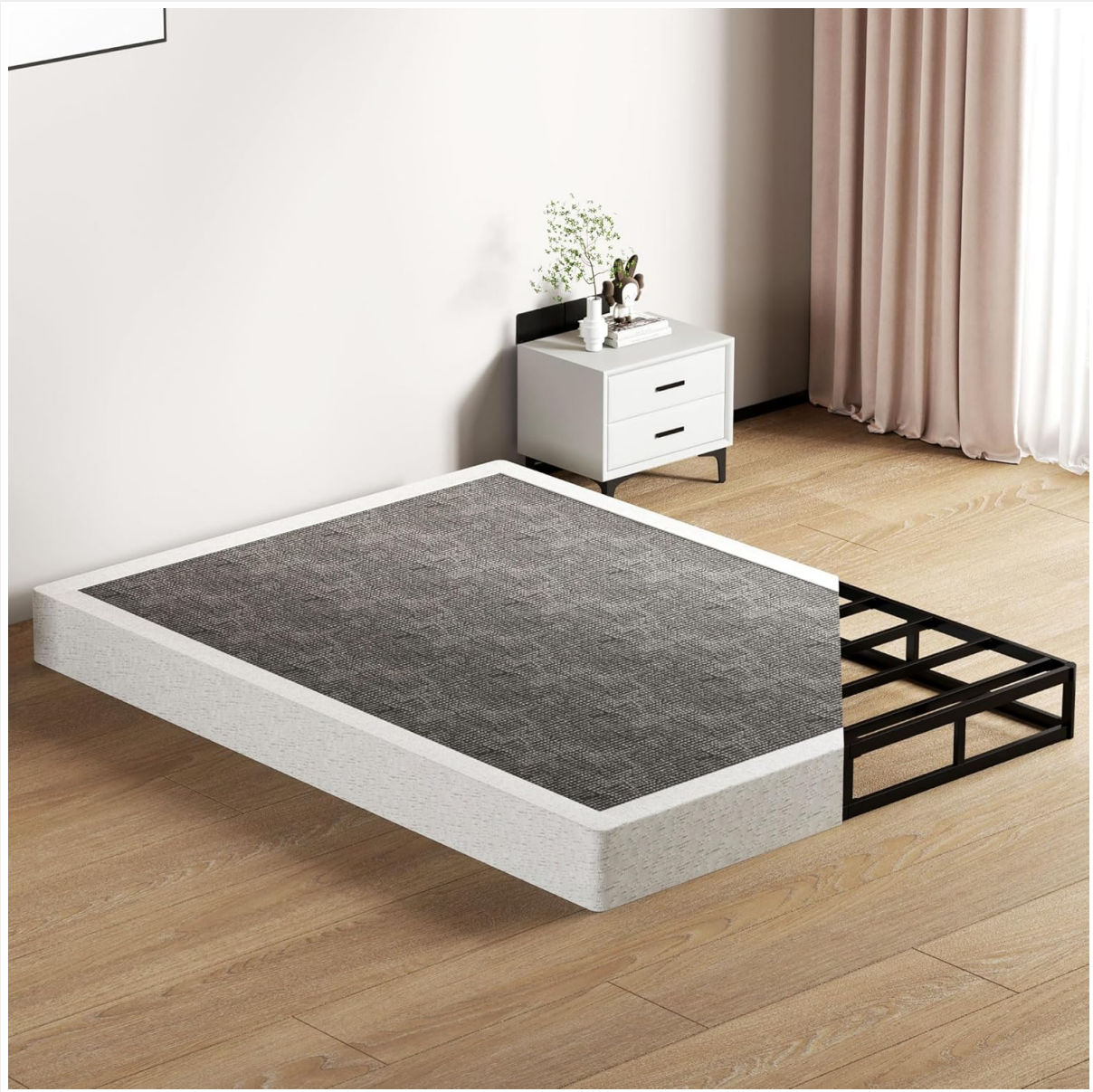
Image: The SHOANED 7 Inch Full Box Spring, featuring a grey fabric cover and a glimpse of its sturdy metal frame.