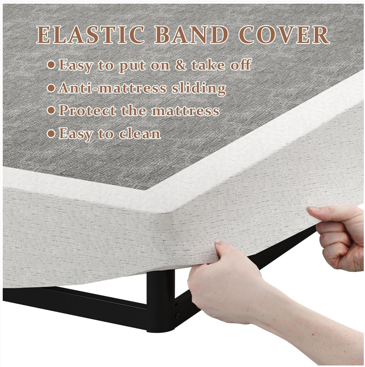
Image: Demonstrating the easy installation of the elastic band cover onto the box spring frame.

Your browser does not support the video tag.