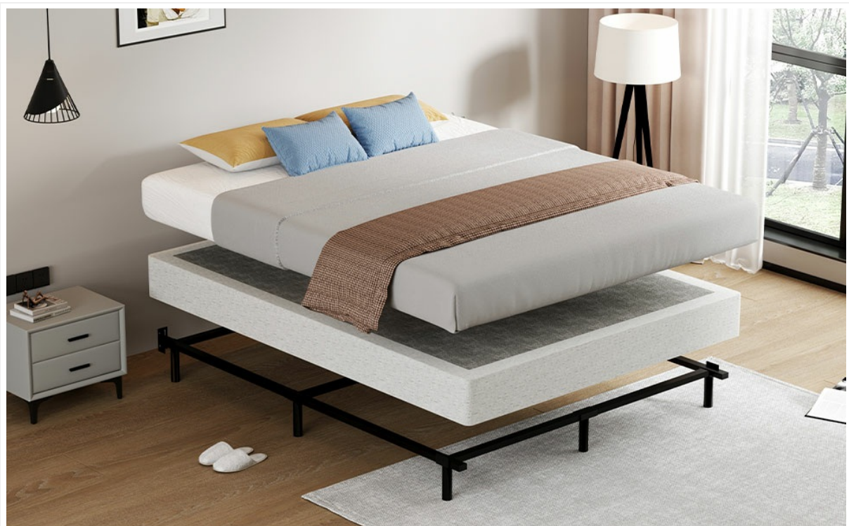
Image: The metal frame with all support slats installed, forming a complete and sturdy base.