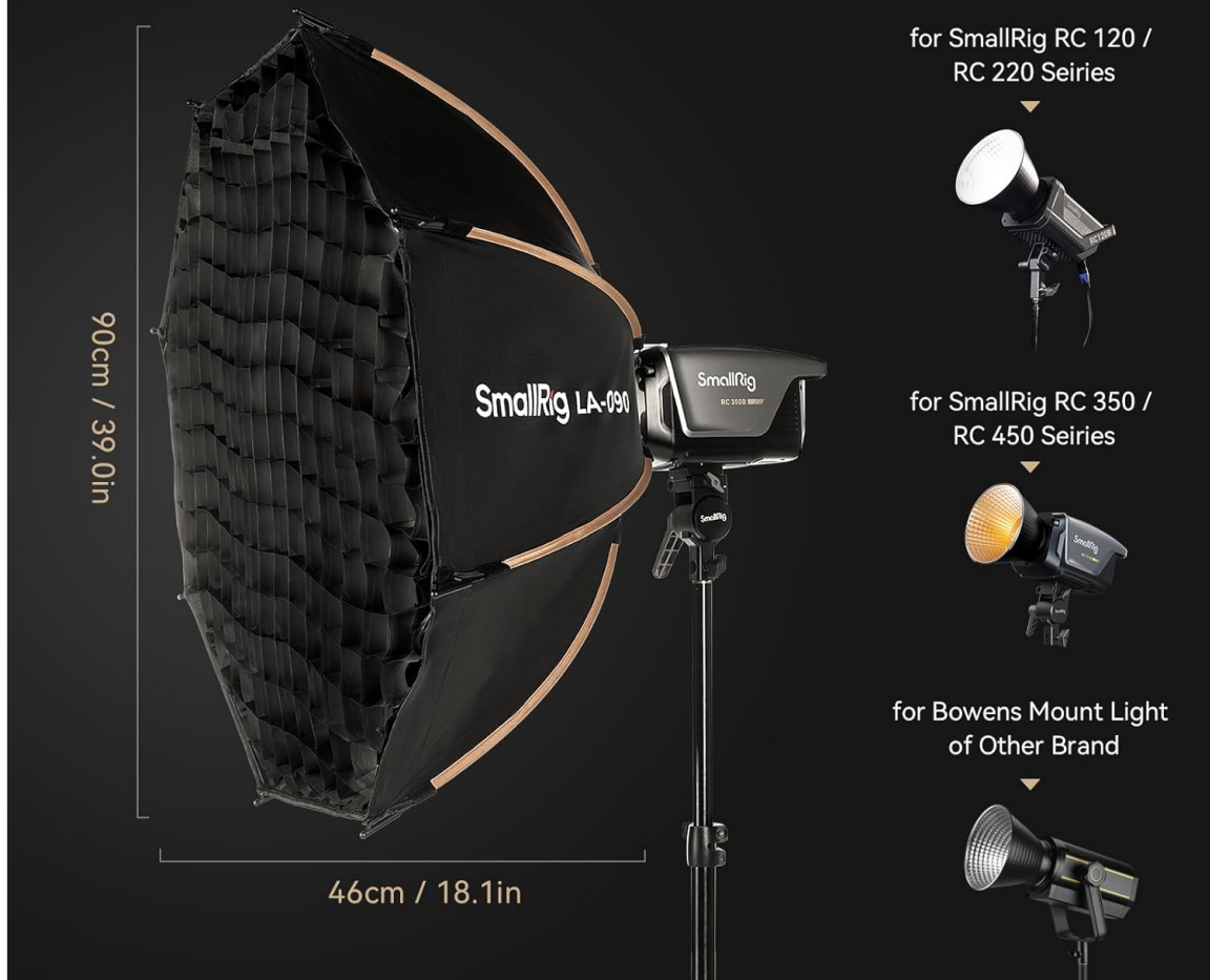
Image: The SmallRig LA-090 softbox attached to a Bowens Mount COB light, illustrating its compatibility and secure connection.

Compatible with Bowens Mount Standard COB Video Light