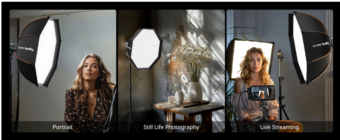
Image: Examples of the SmallRig LA-O90 softbox being used for portrait photography, still life, and live streaming, showcasing its versatility.