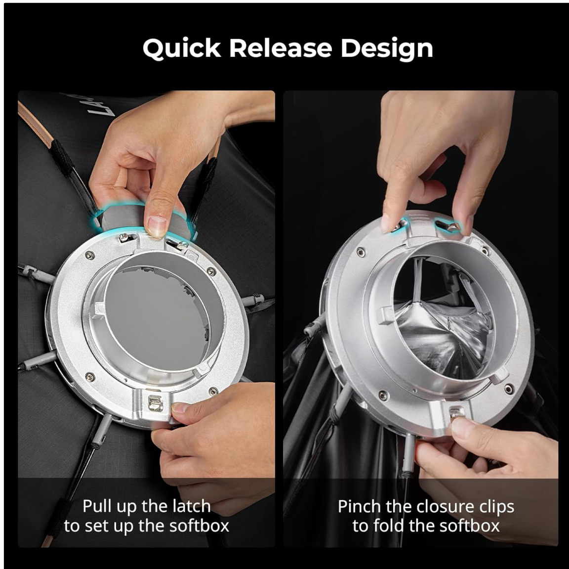
Image: A close-up view of the quick-release mechanism on the SmallRig LA-O90 softbox, showing how to pull up the latch to set it up.