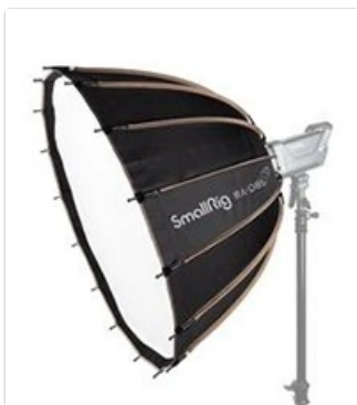
Image: All components included in the SmallRig LA-O90 Softbox package, neatly arranged.