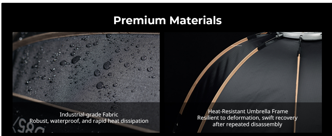
Image: A close-up of the industrial-grade fabric and heat-resistant umbrella frame, highlighting the durable materials used in the softbox construction.