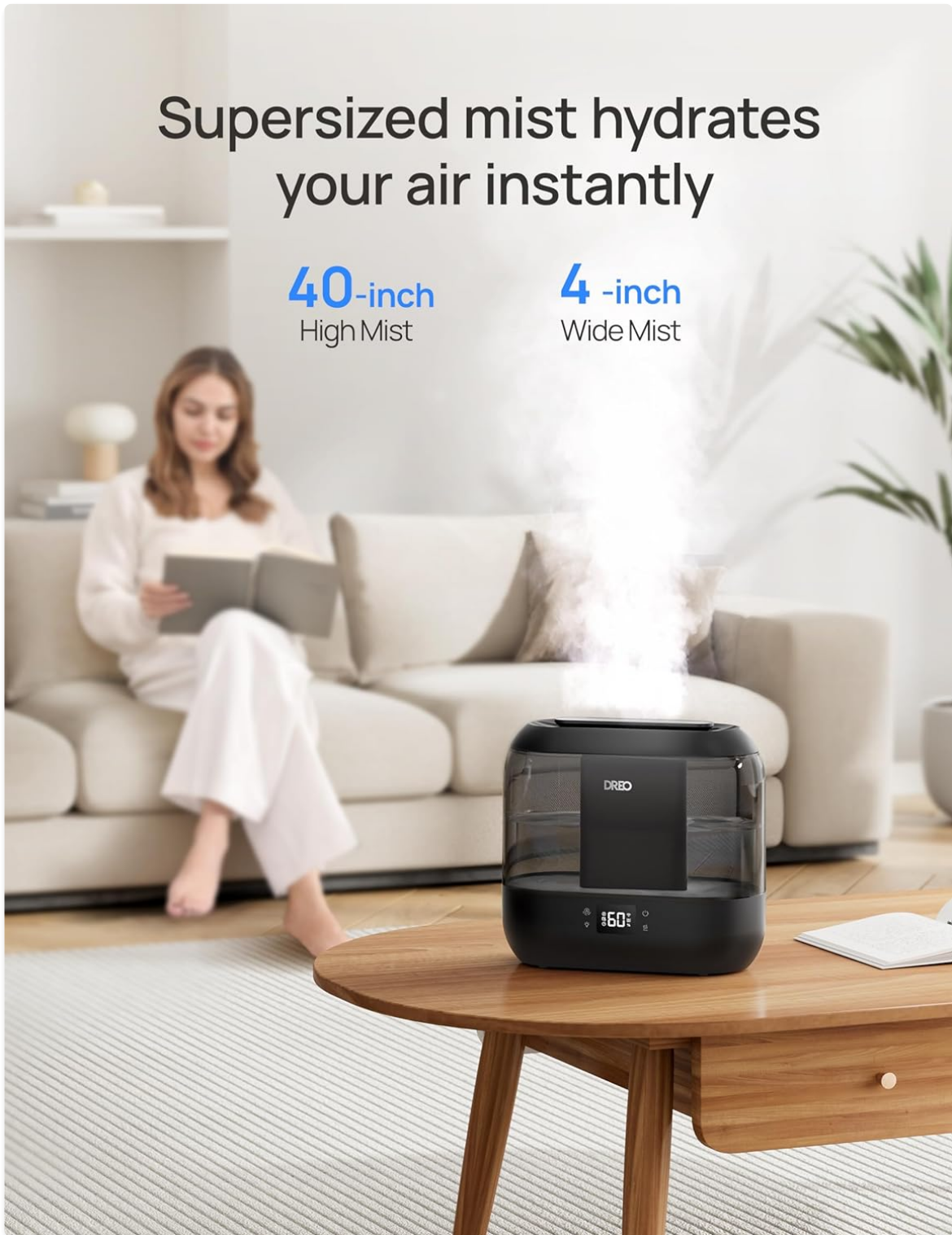
Figure 4.2: The humidifier's supersized mist output quickly hydrates the air.