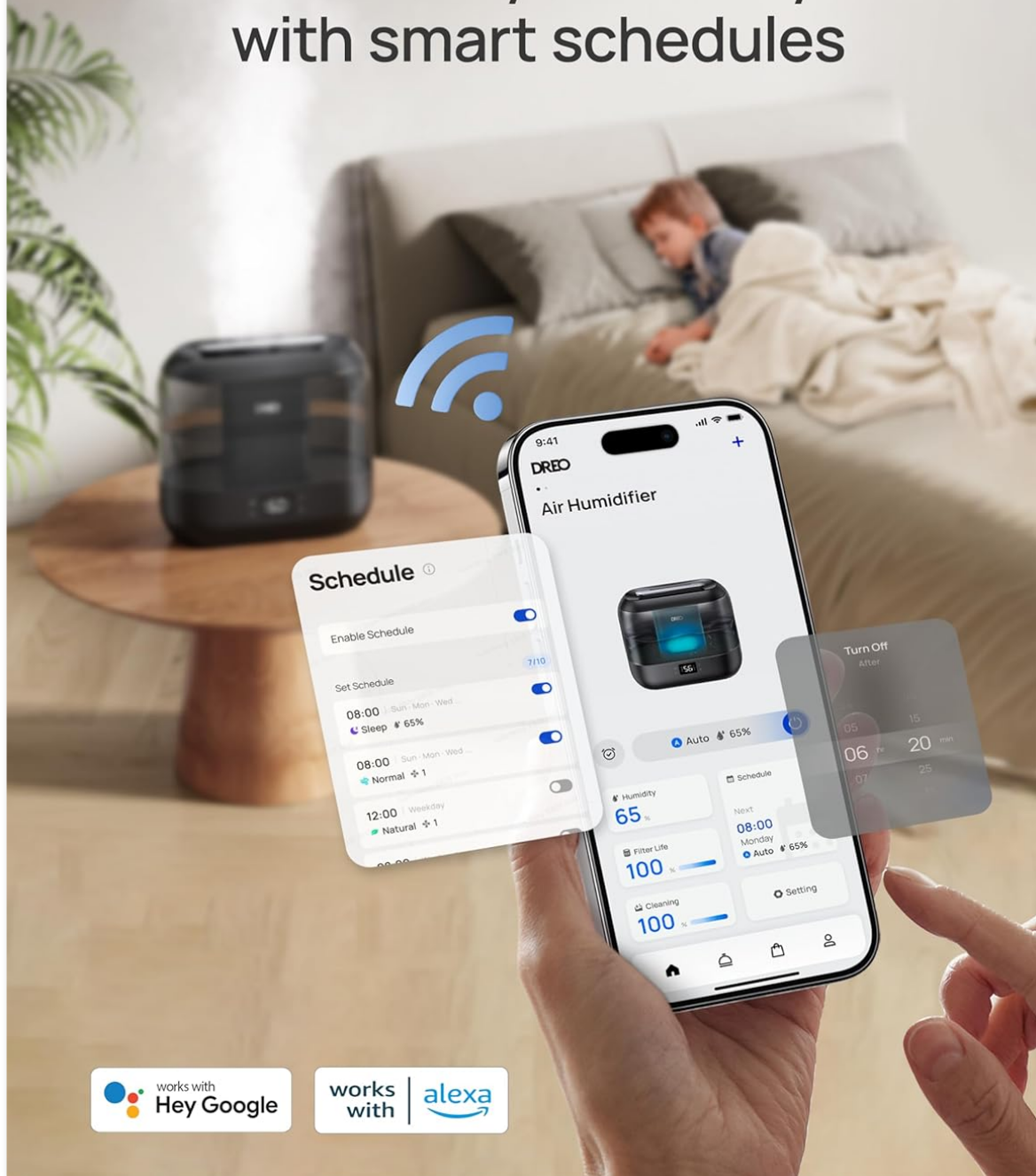
Figure 4.6: Tailor the humidifier's operation to your lifestyle with smart schedules via the app.