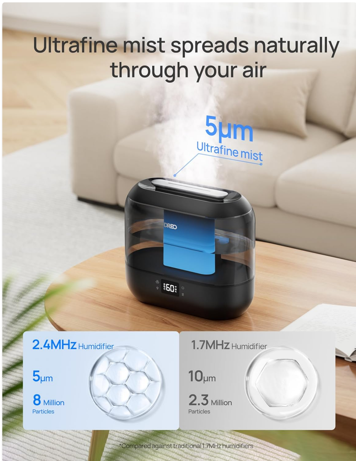
Figure 4.3: The humidifier disperses ultrafine mist particles for even distribution.