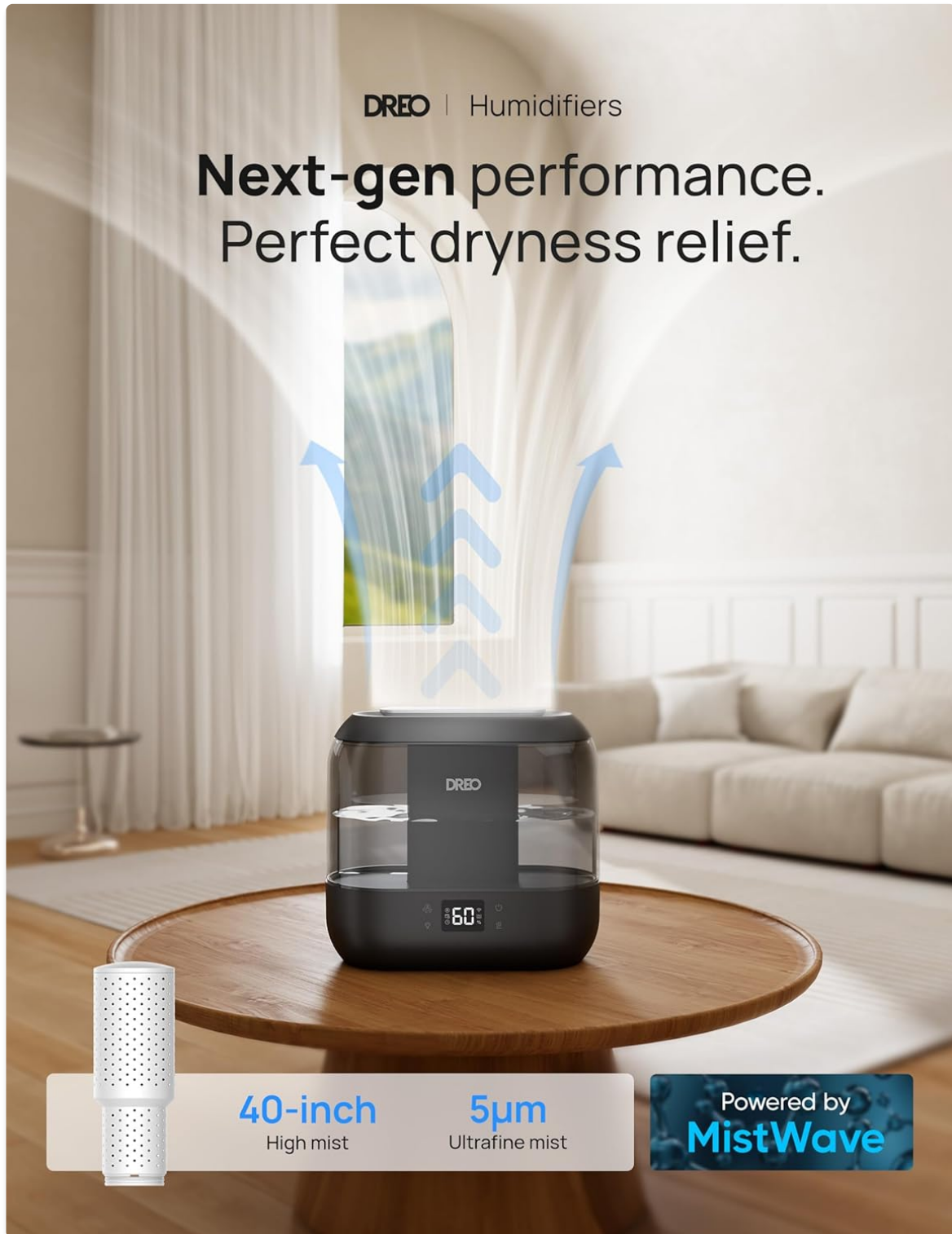
Figure 4.1: Humidifier producing a high mist stream.

Next-gen performance. Perfect dryness relief.