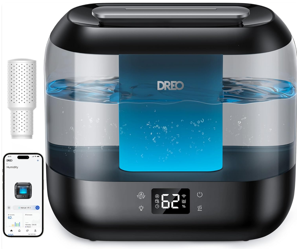
Figure 2.1: Dreo HM311S Smart Humidifier with its main components and a smartphone displaying the control app.