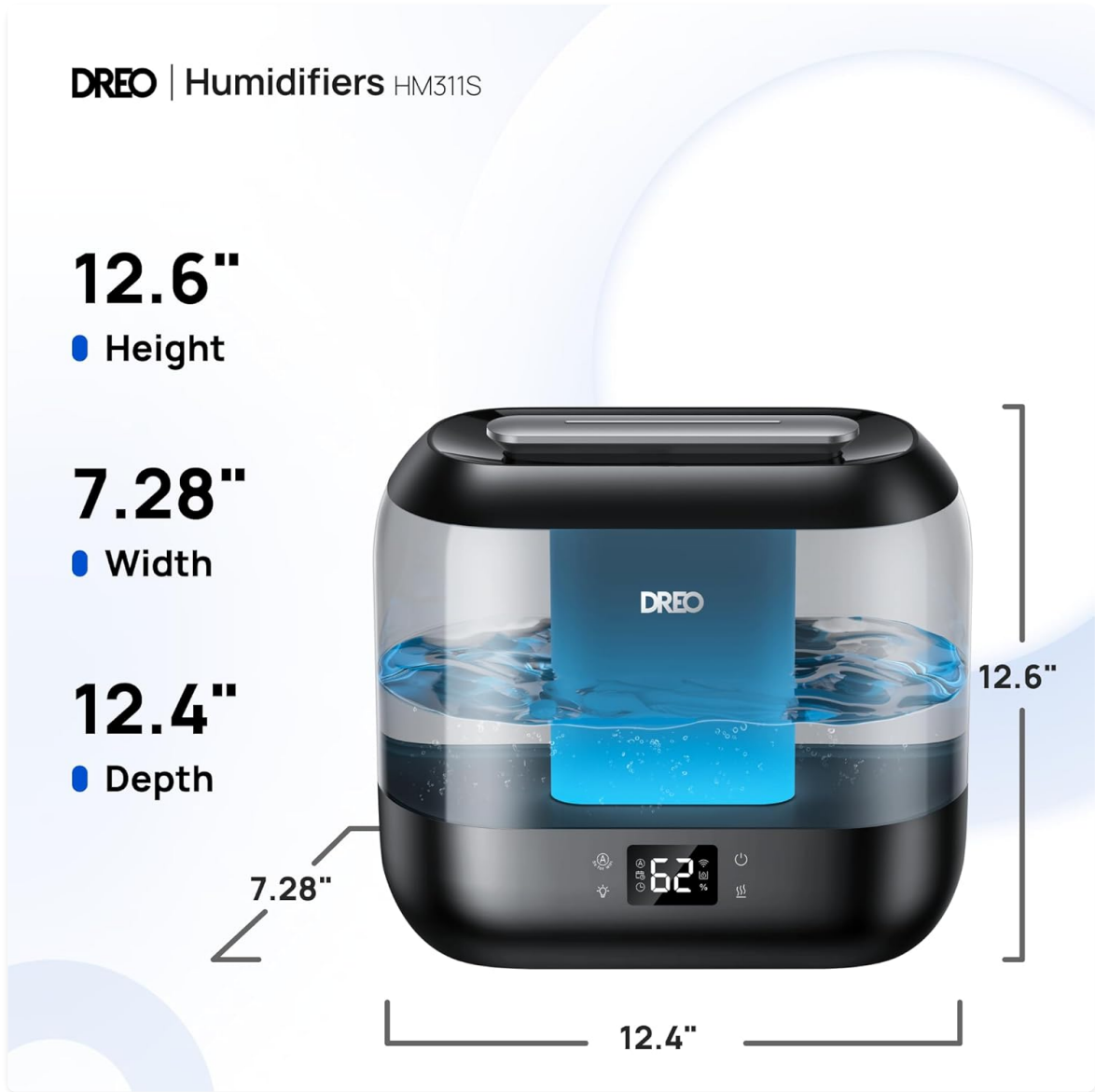
Figure 7.1: Dimensions of the Dreo HM311S Smart Humidifier.