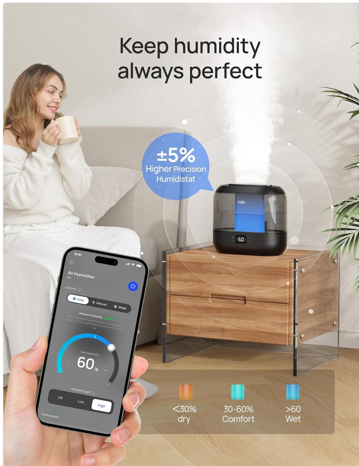
Figure 4.5: Control your humidifier's humidity settings precisely using the Dreo smartphone app.