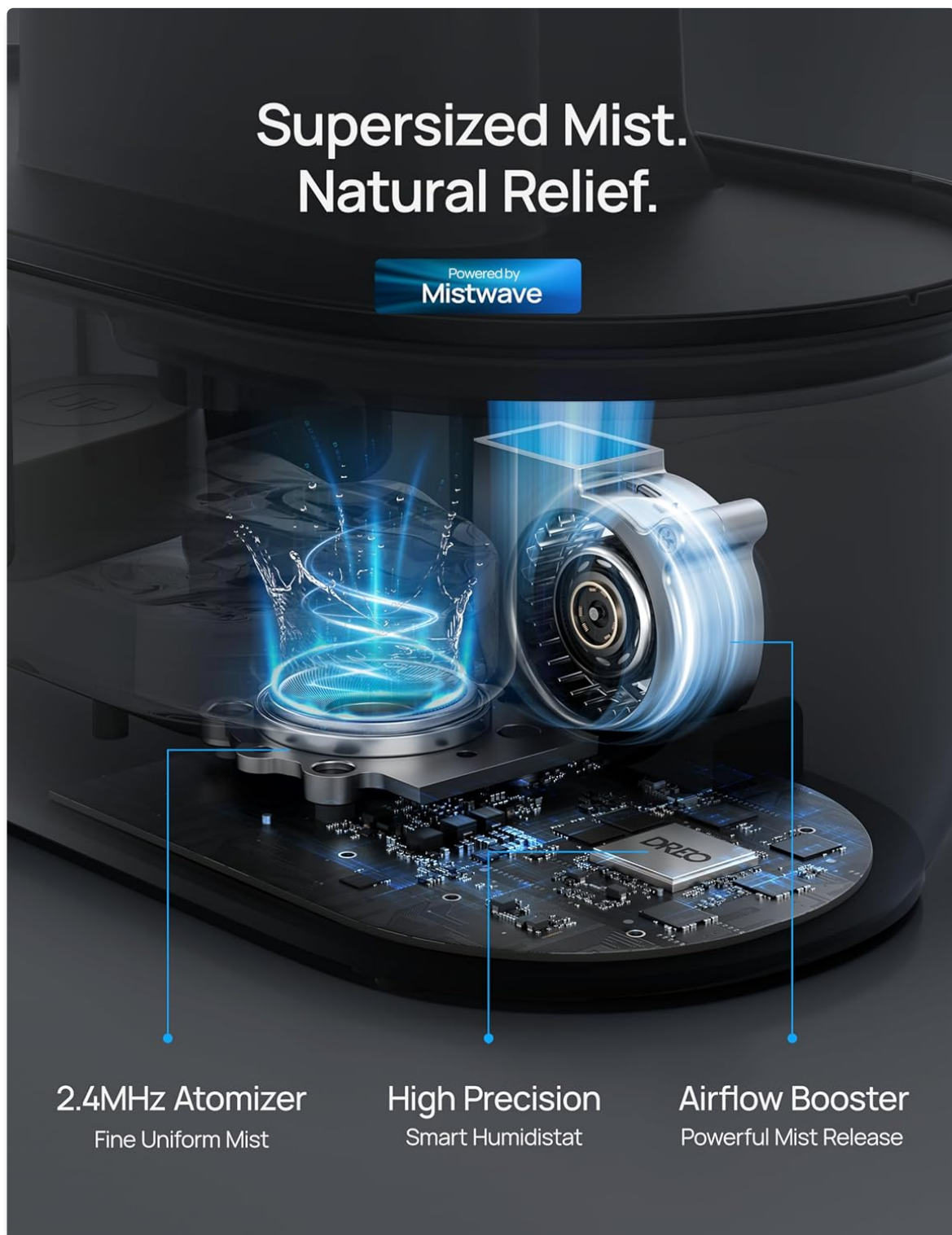
Figure 2.2: Internal components of the humidifier, including the 2.4MHz atomizer for fine mist, smart humidistat, and airflow booster.