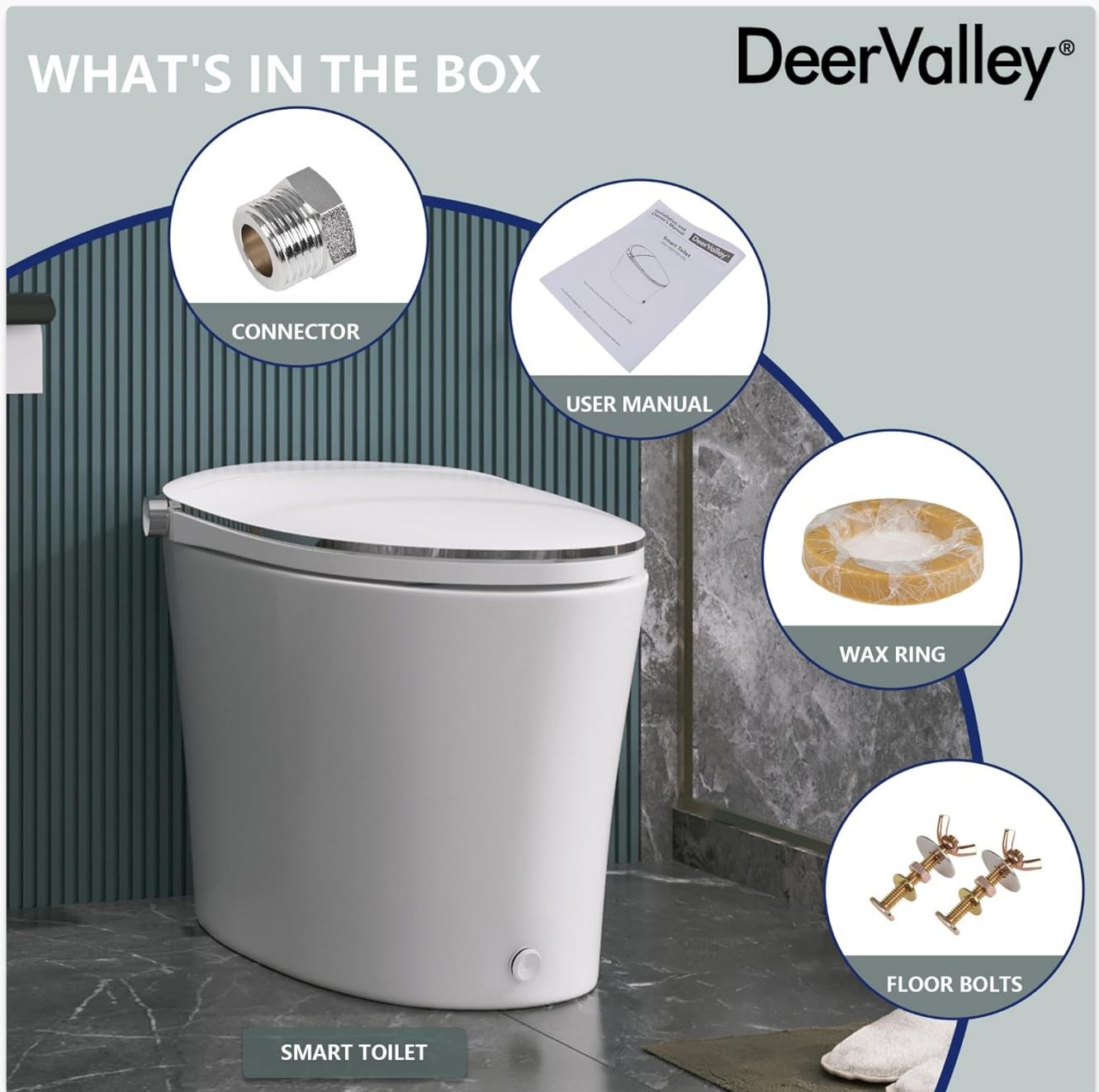
Image 2.1: Contents of the DeerValley DV-1S0019-V1 Smart Toilet package, including the toilet, connector, user manual, wax ring, and floor bolts.

Carefully unpack all components and verify against the list below. Retain packaging for potential future transport or service.