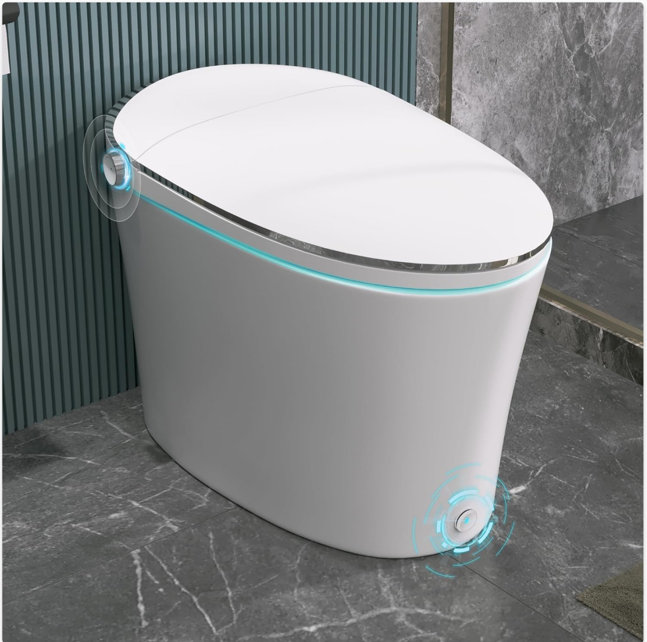
Image 1.1: The DeerValley DV-1S0019-V1 Smart Toilet, showcasing its sleek design and subtle base illumination.