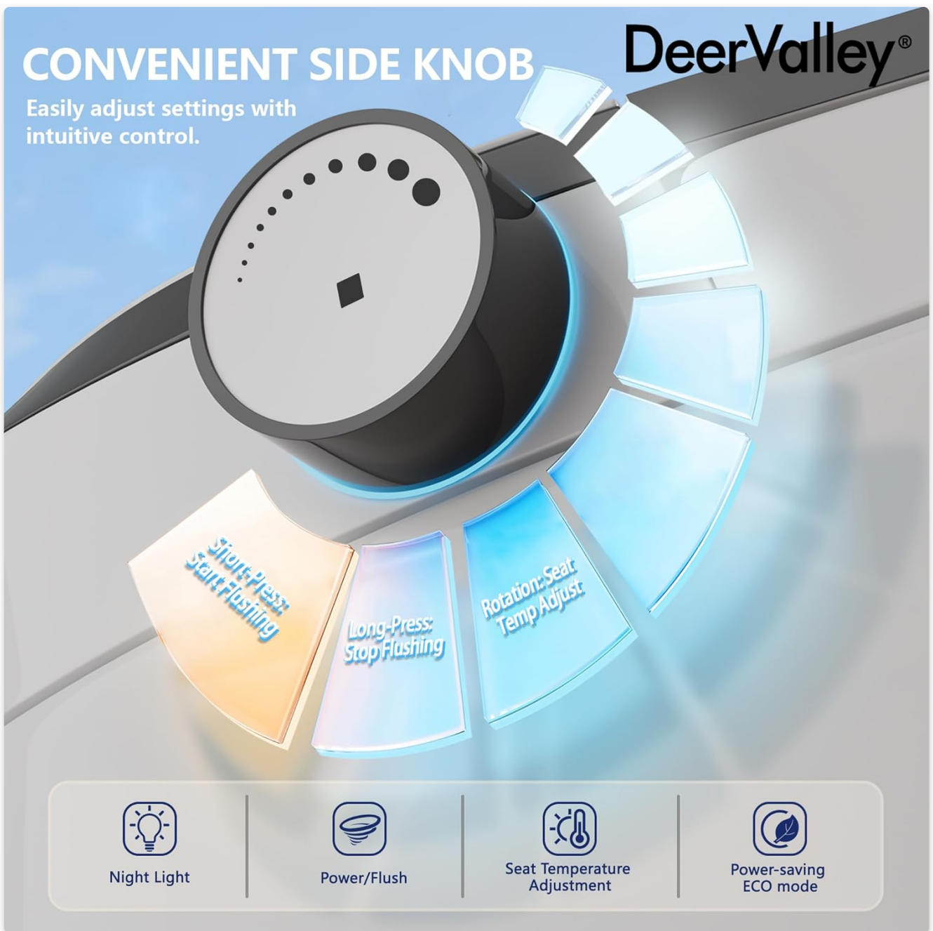
Image 3.4: Detailed view of the side control knob, indicating its various functions for user convenience.

Easily adjust settings with intuitive control.