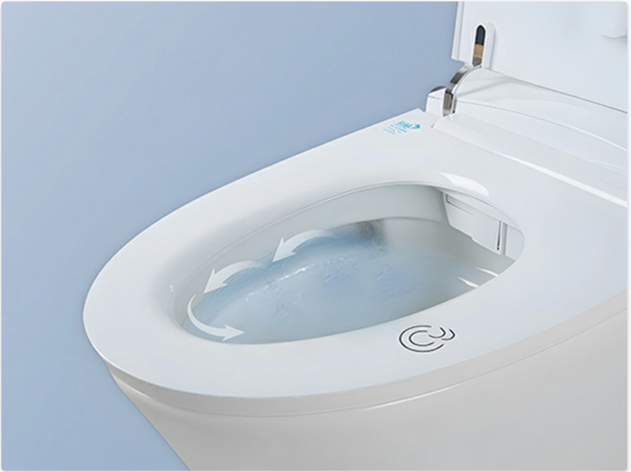
Image 4.1: Representation of the automatic deodorization system, which helps maintain a fresh bathroom environment.