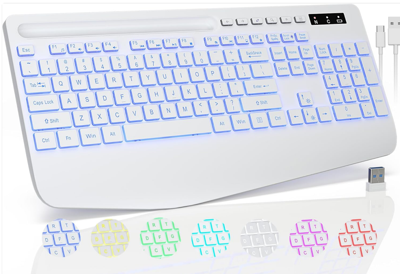
Image 1: Trueque Wireless Ergonomic Keyboard in white, showcasing its full layout and illuminated keys.

This manual provides essential information for the setup, operation, and maintenance of your Trueque Wireless Ergonomic Keyboard. Designed for comfort and efficiency, this keyboard features 7-color backlighting, a built-in phone holder, and broad compatibility with various operating systems.