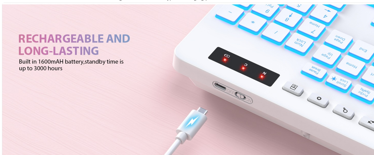
Image 5: Smart LED indicators for Power, Caps Lock, and Num Lock. The power indicator flashes when the battery is low.