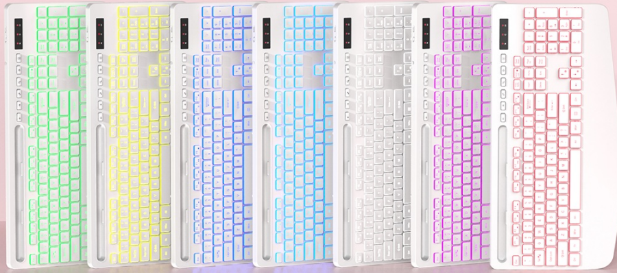
Image 6: Instructions for adjusting backlight colors and brightness.