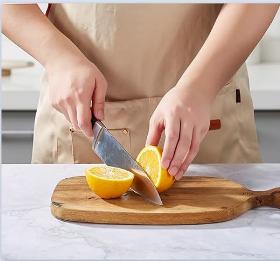
1 Slice the fruit in half.