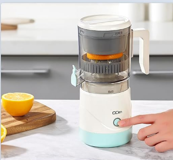
3 Press the power button.