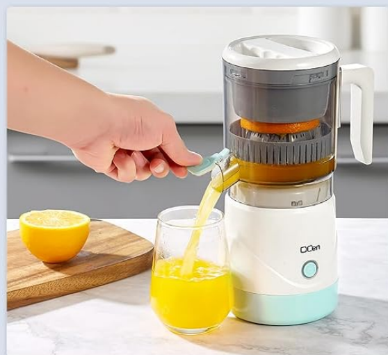
4 Unseal the outlet.

The image shows the juicer disassembled into its main components, emphasizing the detachable parts design which simplifies the cleaning process.