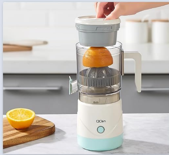
2 Securely fasten the lid.