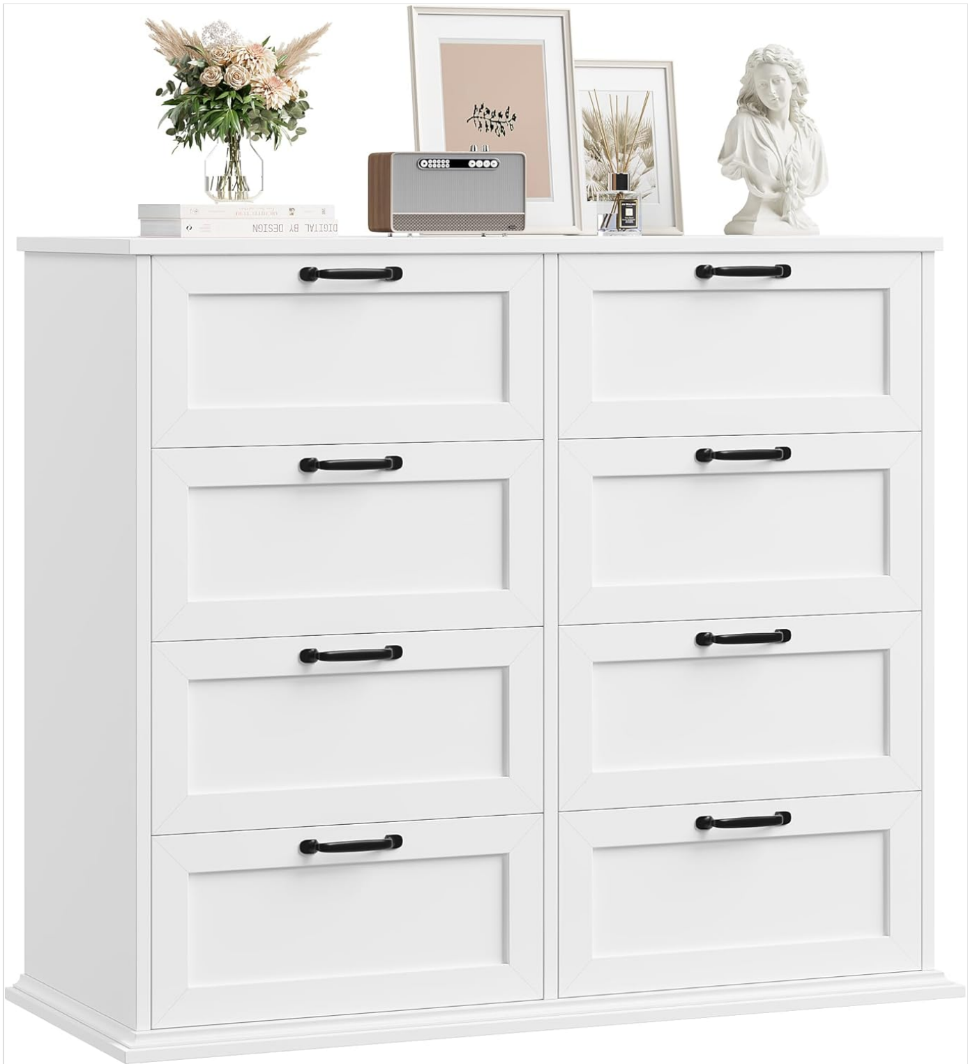
Figure 2: Fully assembled BOTLOG White 8-Drawer Dresser.