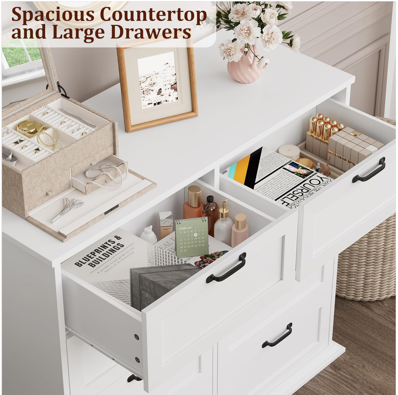
Figure 3: Drawers open, demonstrating ample storage space for various items.