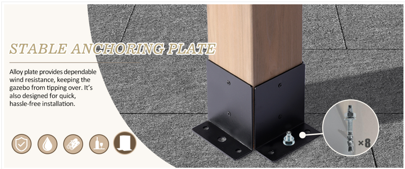
Figure 5.1: Stable anchoring plate for secure installation.