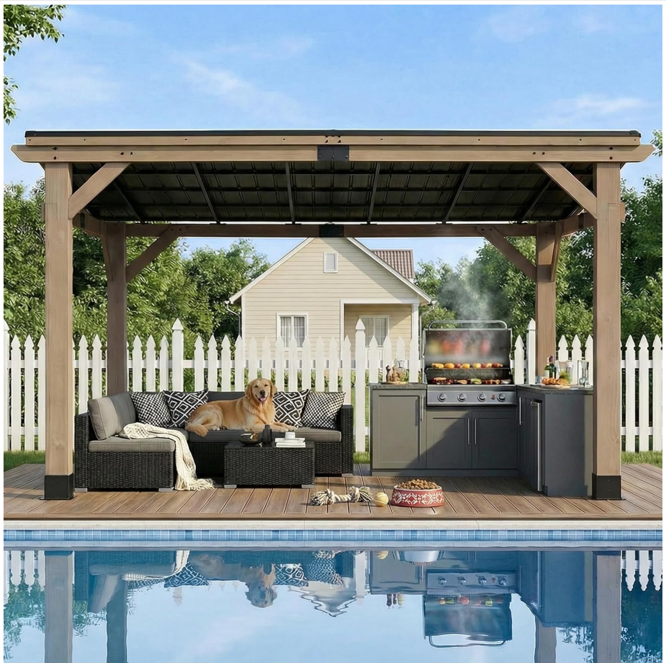
Figure 7.1: A well-maintained gazebo providing an inviting outdoor area.