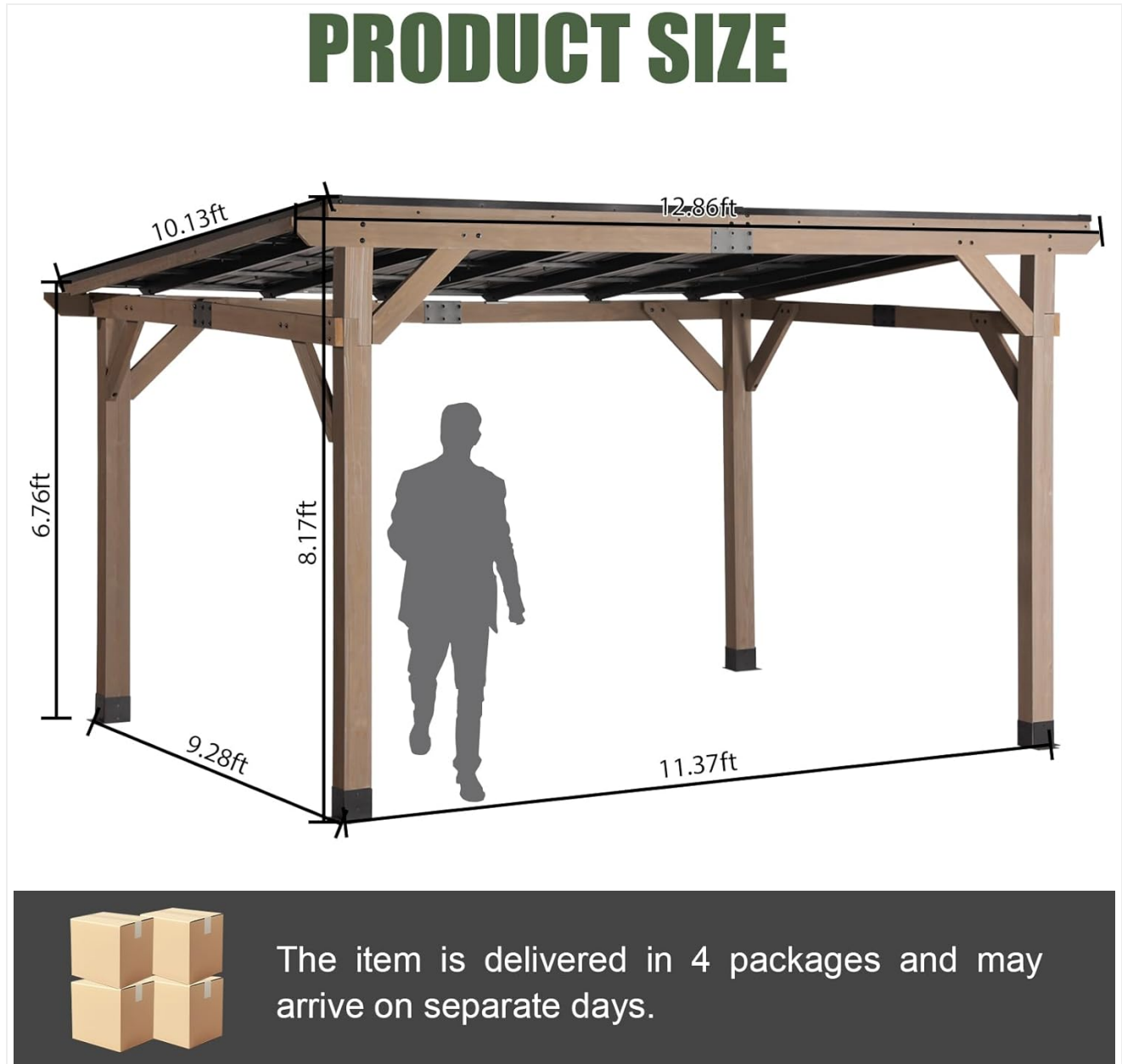
Figure 3.1: Overall dimensions of the gazebo. The structure measures approximately 12.86 ft in length, 10.13 ft in width, and 8.17 ft in height at its peak.

Refer to the diagram below for detailed product dimensions.