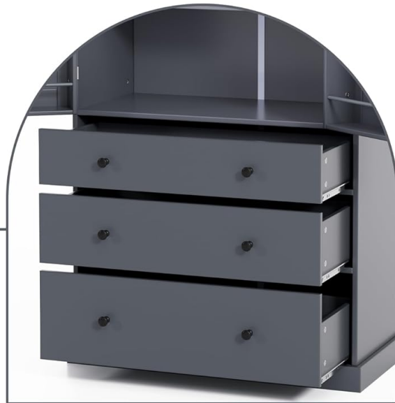
Figure 7: Overview of door shelves and drawers.

With unique different sizes and sleek design