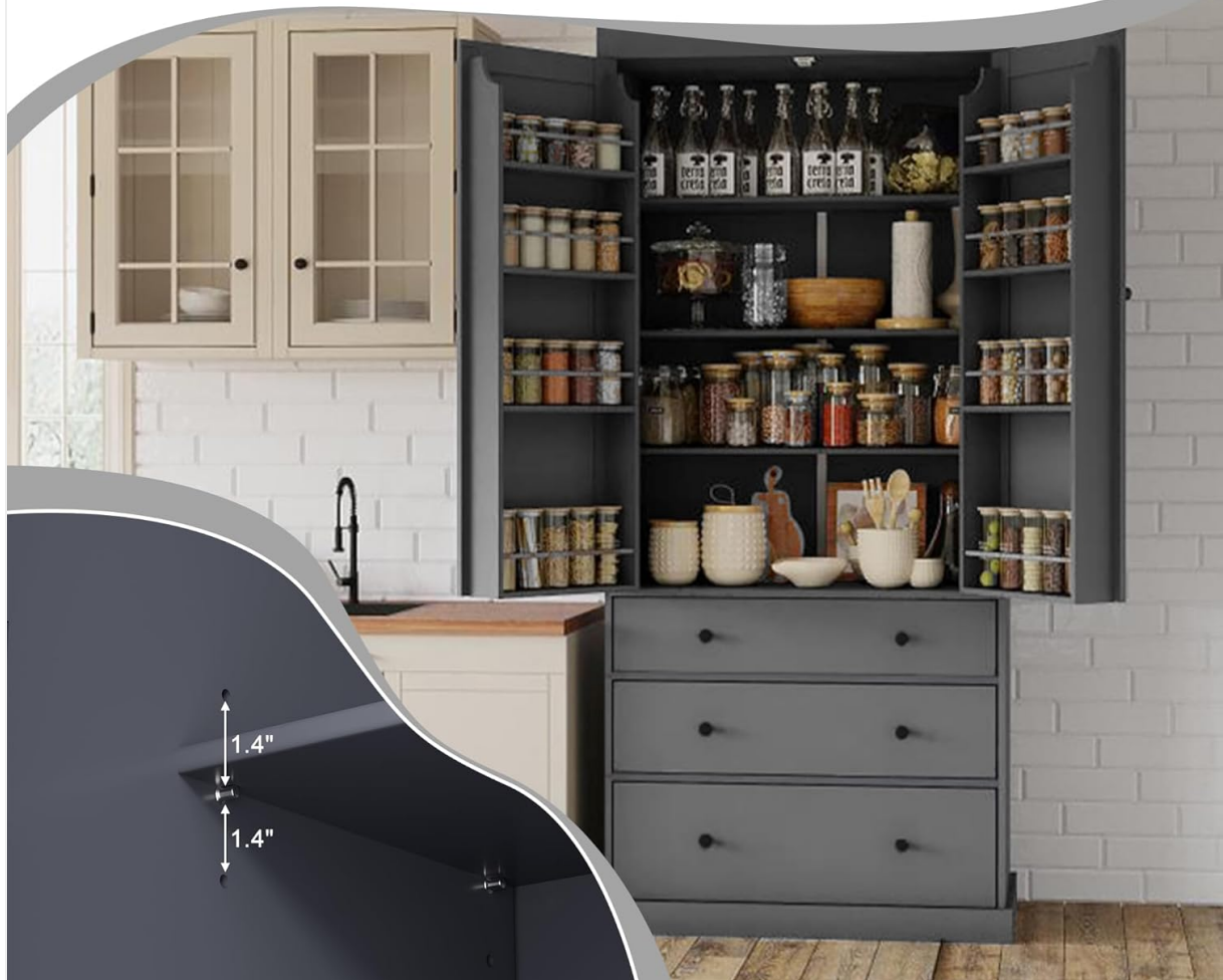
Figure 6: Detail of adjustable shelf mechanism.

With its clever design dividing the cabinet into four tiers, you'll effortlessly organize your belongings while optimizing space utilization.