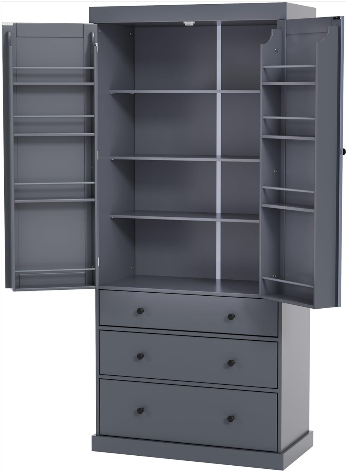
Figure 4: Cabinet interior with doors open and drawers closed.