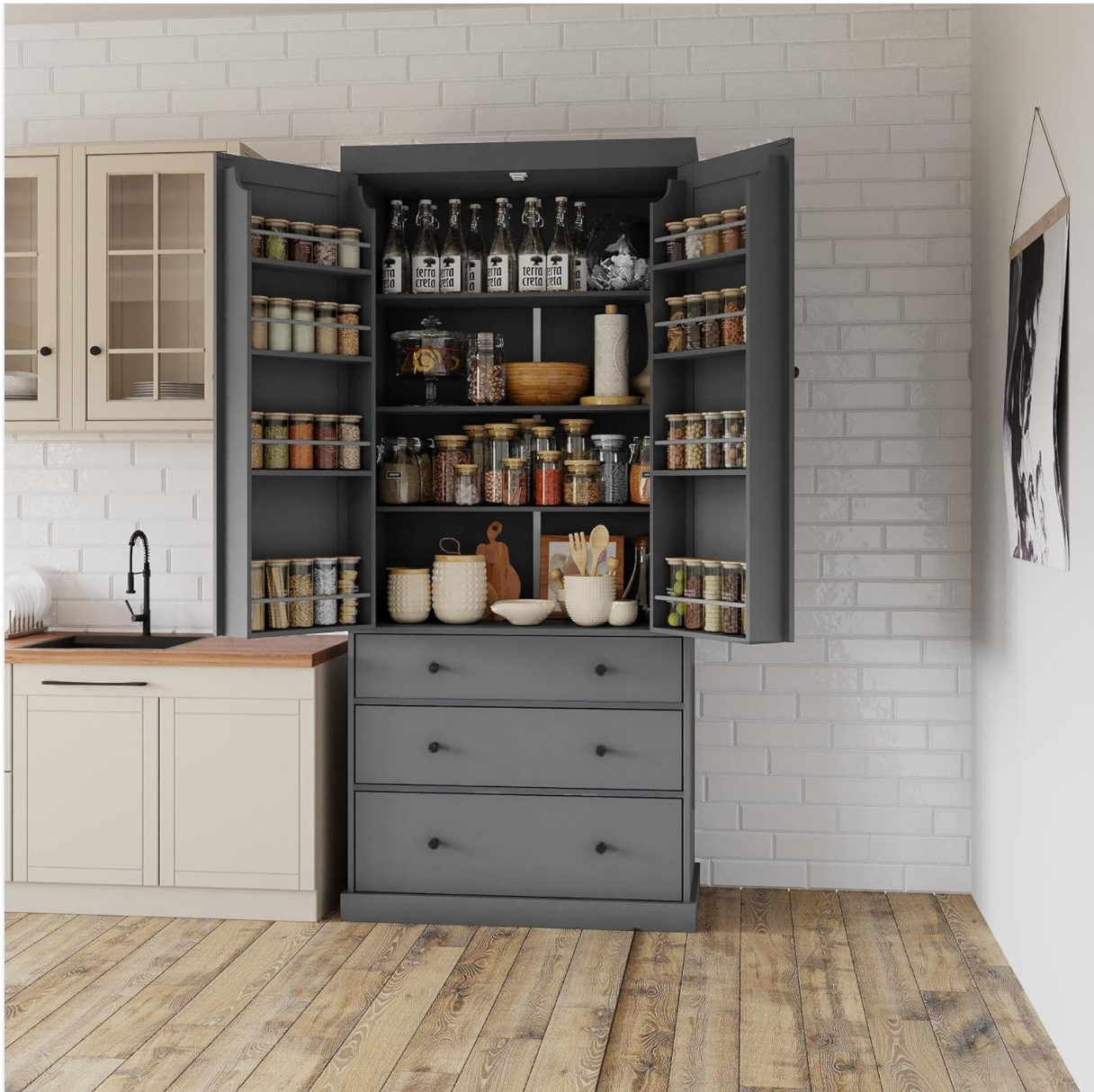
Figure 1: Bellemave Large Kitchen Pantry Cabinet (Grey) in use.