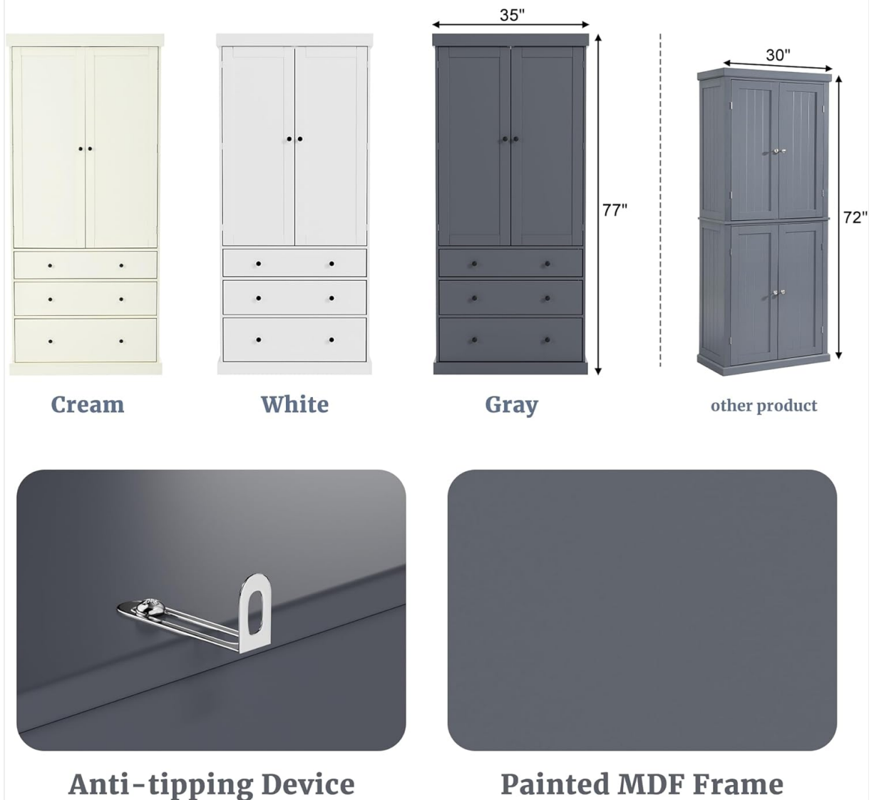
Figure 2: Anti-tipping device and material detail.

The anti-tipping device is a critical safety component. Please ensure it is properly installed according to the assembly instructions to secure the cabinet to the wall.