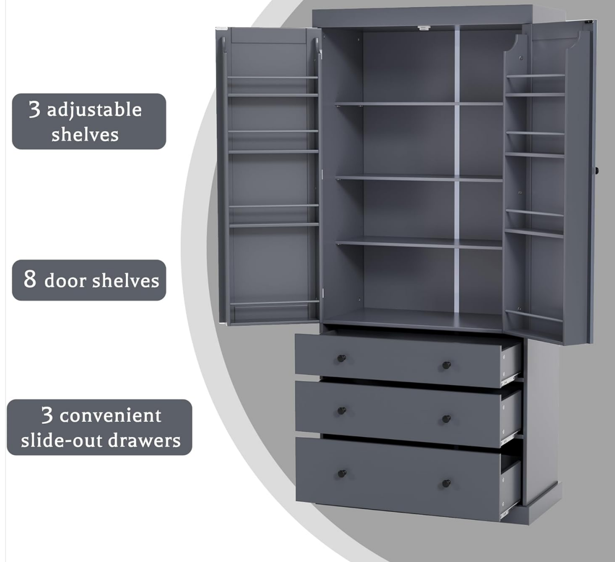
Figure 8: Interior features: adjustable shelves, door shelves, and drawers.