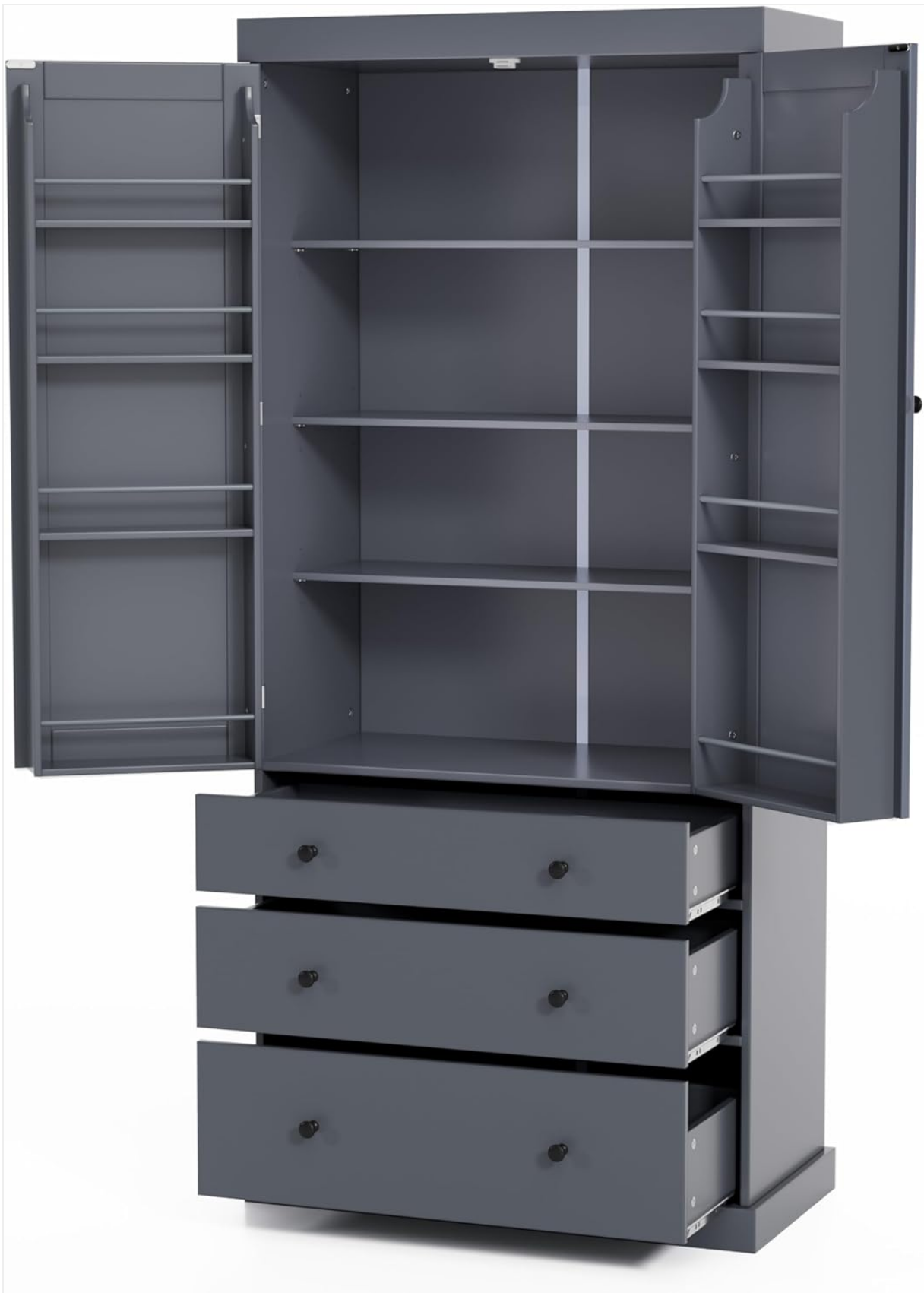
Figure 5: Cabinet interior with doors open and drawers extended.