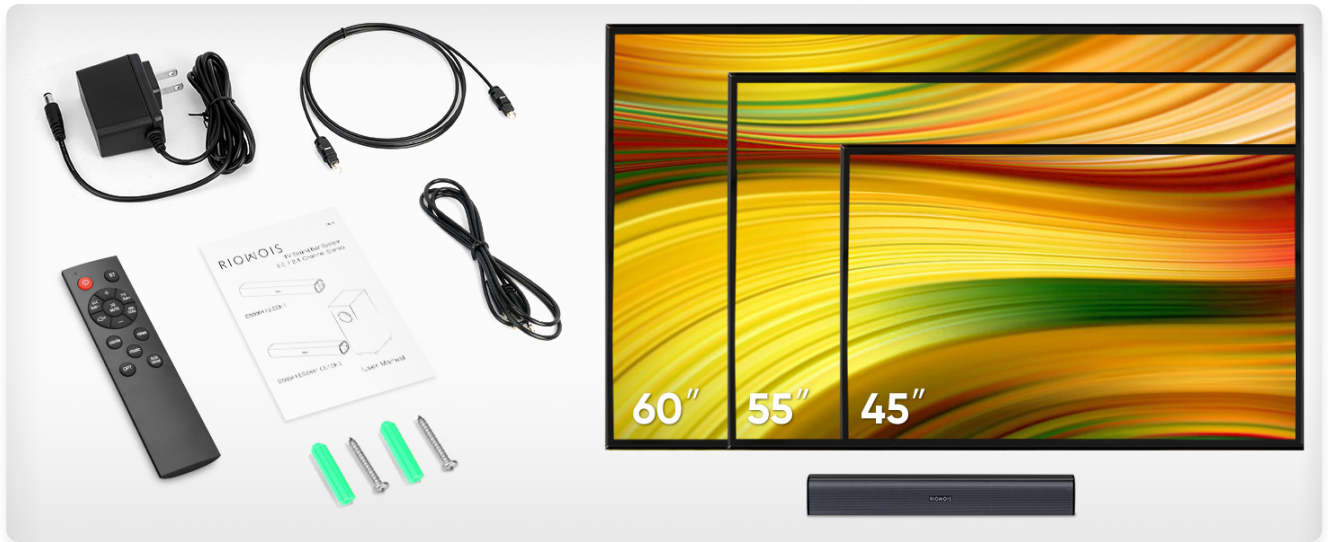
Image: An overhead view displaying all items included in the RIOWOIS Soundbar package: the soundbar itself, remote control, power adapter, 3.5mm AUX cable, optical cable, wall mount kits, and the user manual.