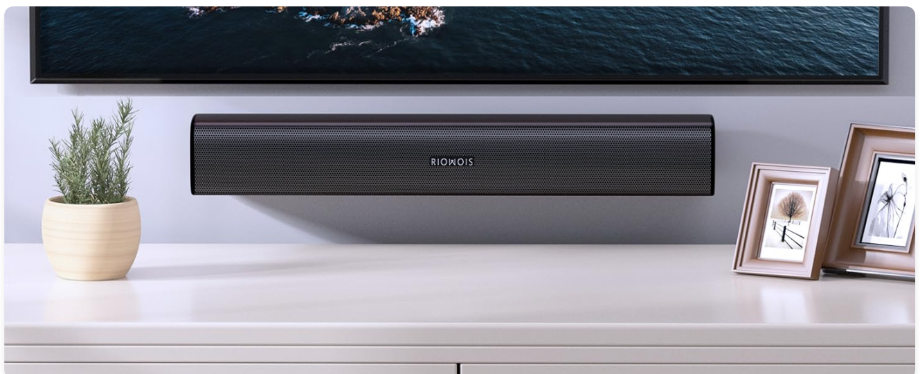
Image: A wider view of the soundbar installed on a wall in a modern living room, highlighting its seamless integration with home decor.