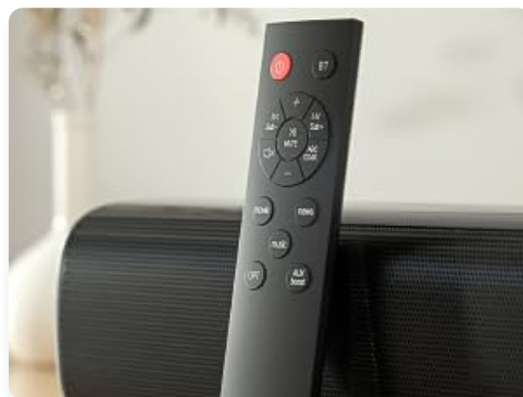
Image: A close-up shot of the soundbar's remote control, showing its various buttons for power, volume, mode selection, and sound effects.