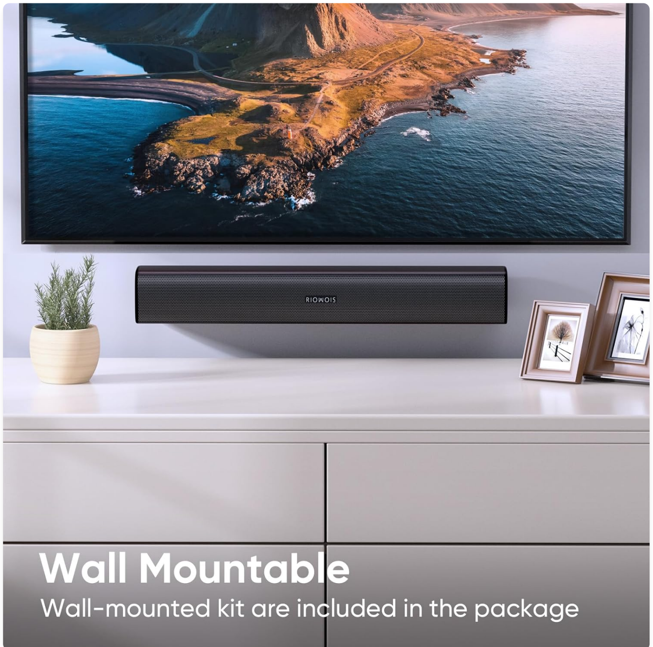
Image: The RIOWOIS Soundbar elegantly mounted on a wall, positioned beneath a television, demonstrating its wall-mountable capability and space-saving design.