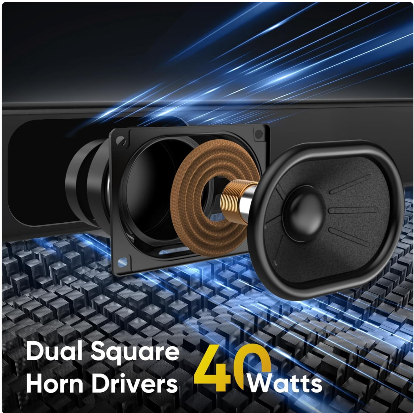
Image: An illustrative diagram showing the internal components of the soundbar, highlighting the dual square horn drivers responsible for its 40 Watts of audio output.