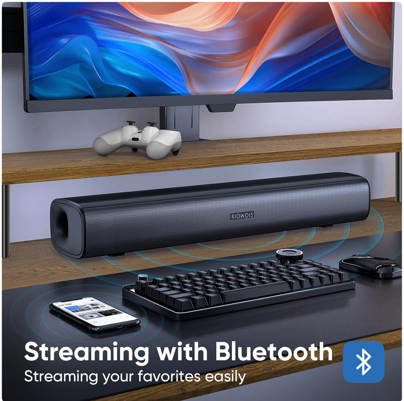
Image: The soundbar positioned on a desk with a computer setup, demonstrating its Bluetooth streaming capability with a smartphone displaying music playback.