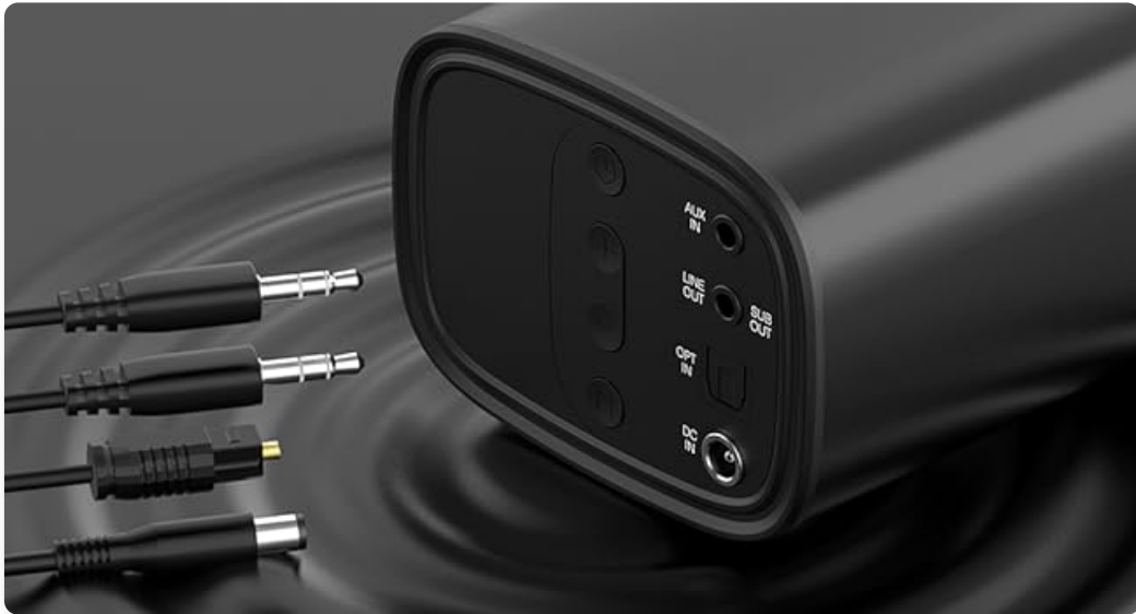
Image: A detailed view of the soundbar's rear panel, clearly showing the AUX IN, OPT IN, and DC IN ports, along with the power, volume, and mode buttons.