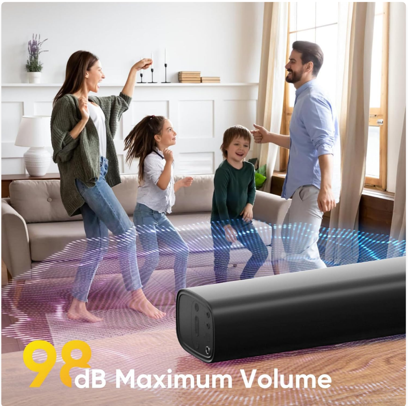
Image: A family enjoying music in their living room, with the RIOWOIS Soundbar in the foreground, illustrating its capability to produce up to 98 dB maximum volume for an immersive audio experience.