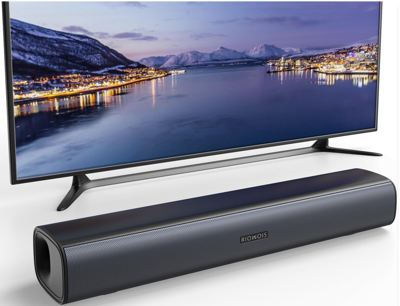
Image: The RIOWOIS Soundbar DS6301G positioned neatly below a television, showcasing its compact design and how it integrates into a home entertainment setup.