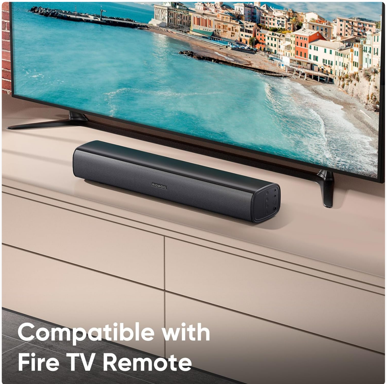
Image: The RIOWOIS Soundbar positioned below a television, with an overlay text indicating its compatibility with Fire TV remotes, simplifying control for users.