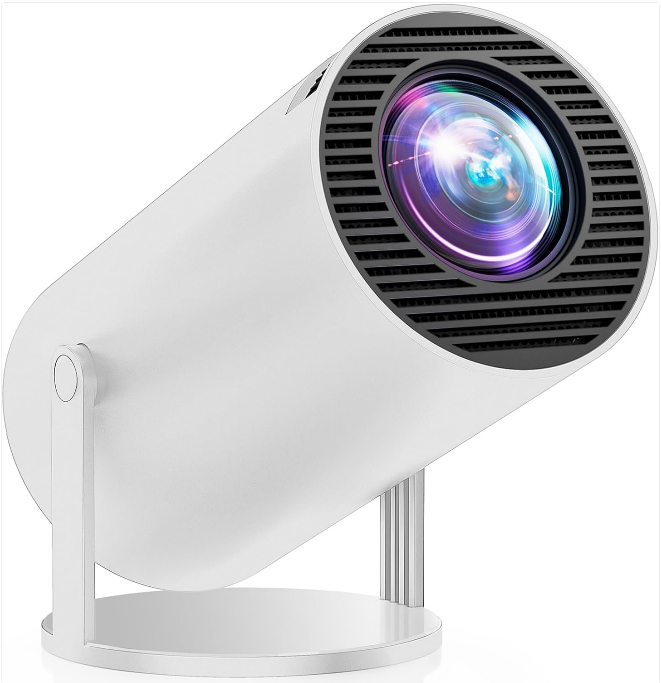
Figure 1: Front view of the ARTSEA Mini Projector, showcasing its compact cylindrical design and lens.

Your browser does not support the video tag.