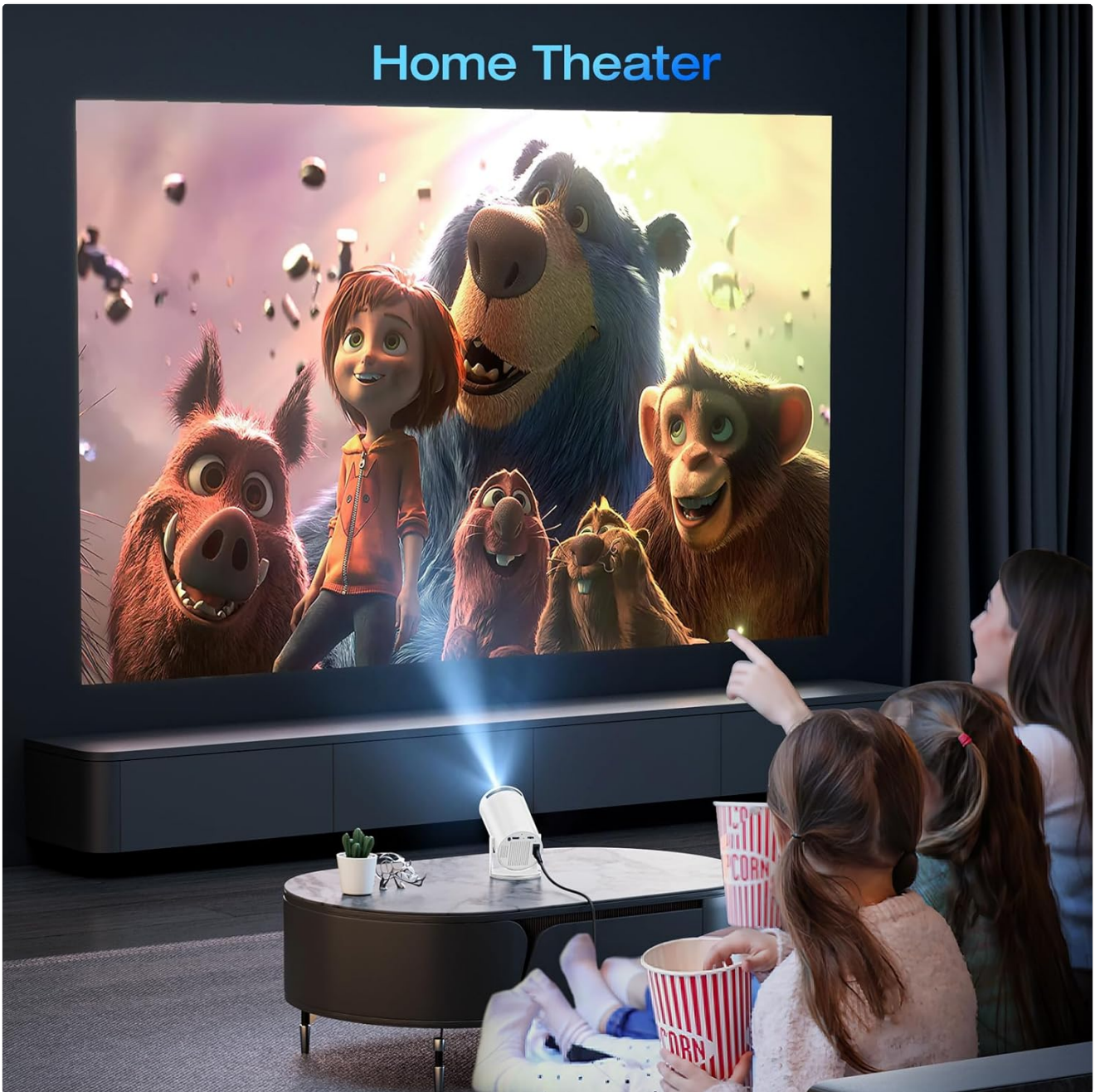
Figure 7: A family enjoying a home theater experience with the ARTSEA Mini Projector, demonstrating its suitability for entertainment.