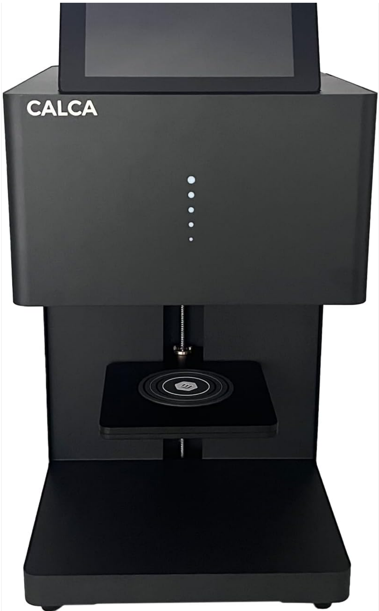
Figure 4.2: Front View of the Printer. This image provides a direct front view of the printer, showcasing the display screen and the indicator lights on the front panel.