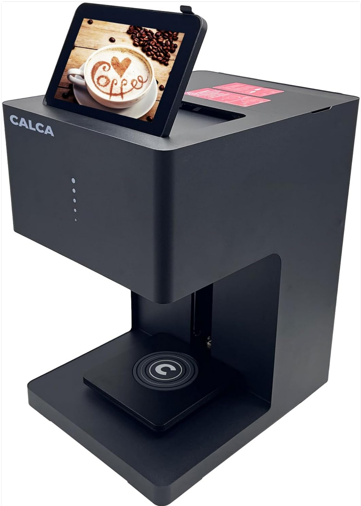
Figure 4.1: CALCA Coffee Latte Art Printer. This image shows the printer from an angled view, highlighting its compact design and the integrated display screen. A coffee cup with a printed design is visible on the printing platform.