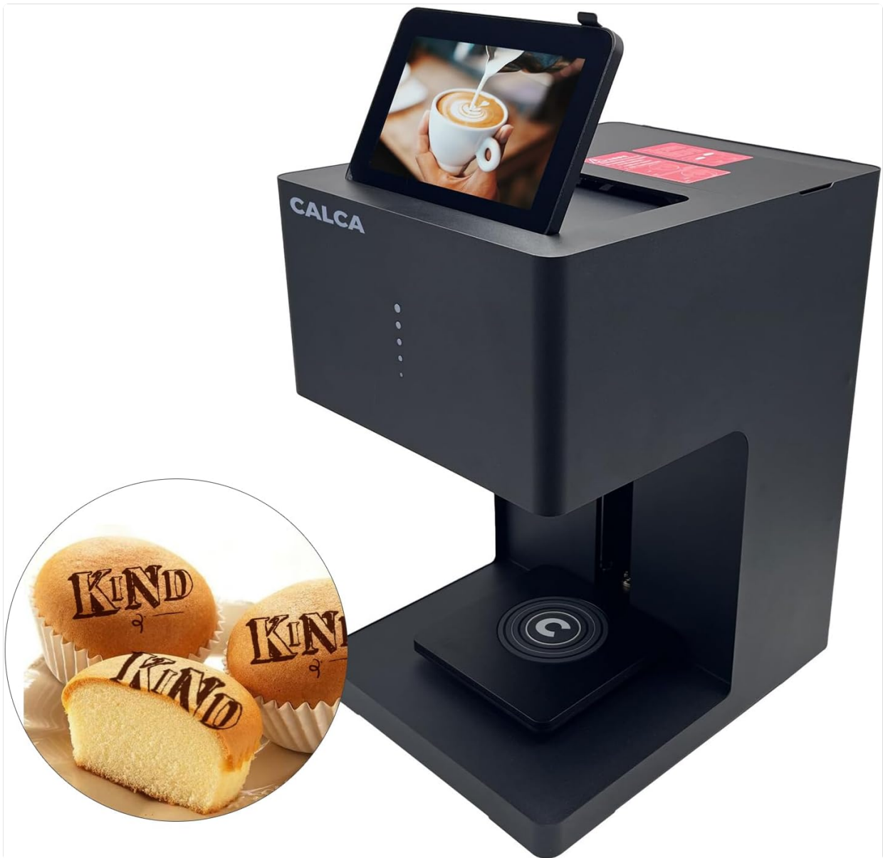
Figure 6.7: Example of printing on small cakes. This image displays individual cakes with the word 'KIND' printed on their upper surfaces.