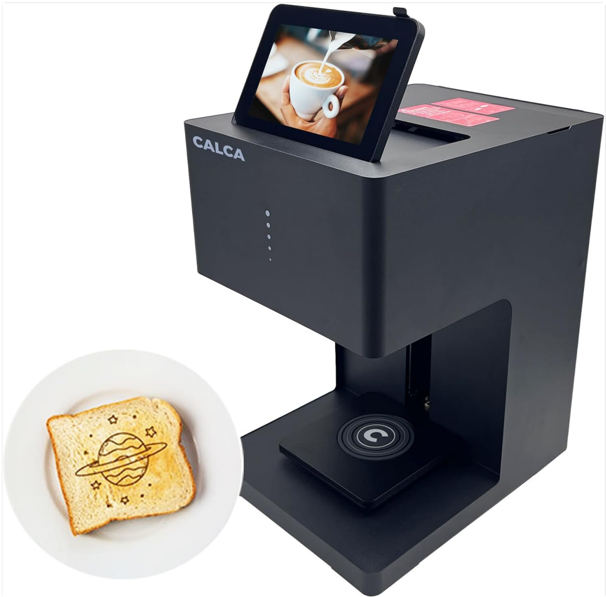
Figure 6.5: Example of printing on toast. This image shows a slice of toast adorned with a creative planet and stars design.