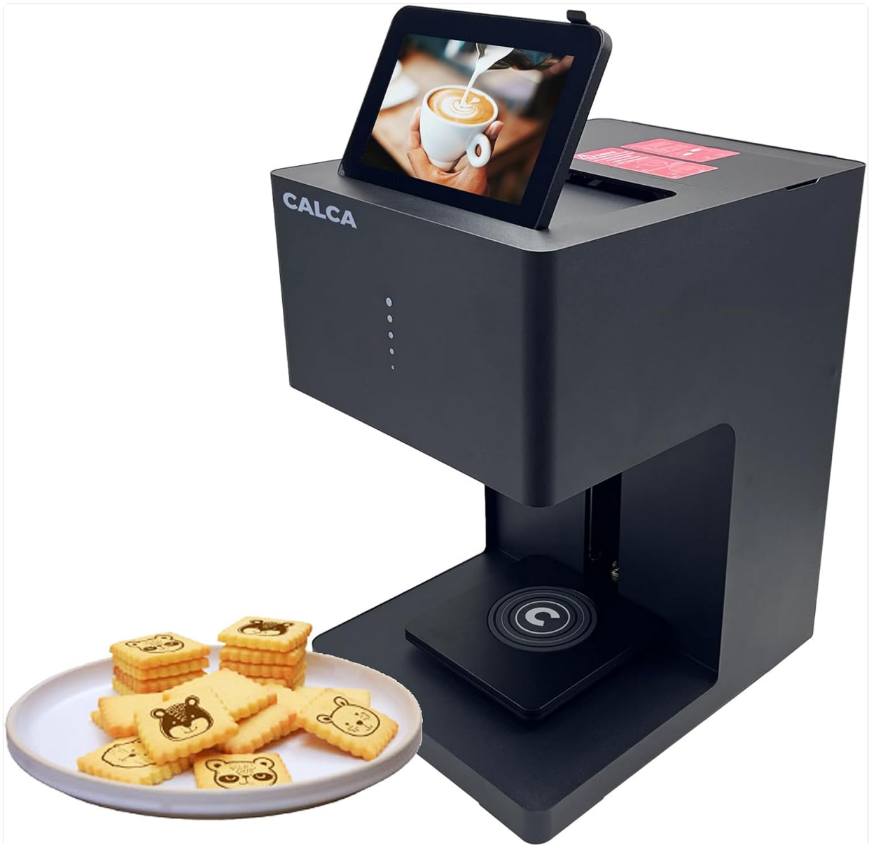
Figure 6.6: Example of printing on cookies. This image features multiple cookies, each decorated with unique bear and heart patterns.