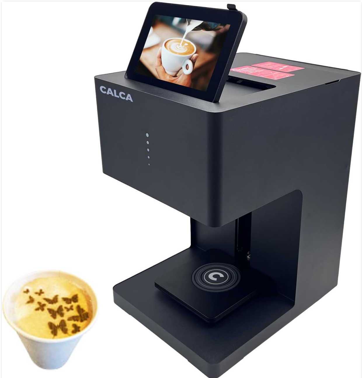
Figure 6.4: Example of latte art on coffee. This image displays a coffee cup with a detailed butterfly pattern printed on the foam surface.

Video 6.1: Demonstration of the CALCA Coffee Latte Art Printer in operation. This video shows a user selecting a design on the printer's screen, placing a coffee cup, and the printer applying a rose design to the coffee foam. The process from selection to finished print is demonstrated.