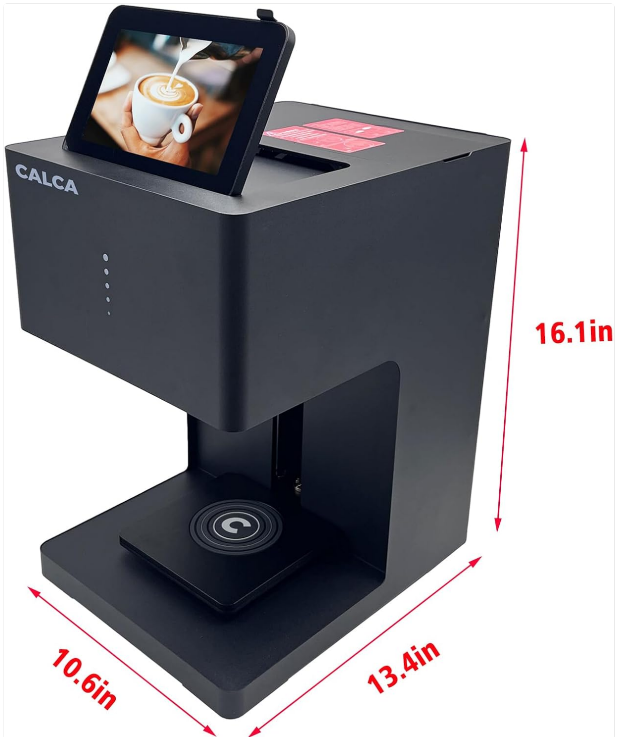
Figure 4.3: Printer Dimensions. This diagram illustrates the physical dimensions of the printer, including its width (10.6 inches), depth (13.4 inches), and height (16.1 inches).