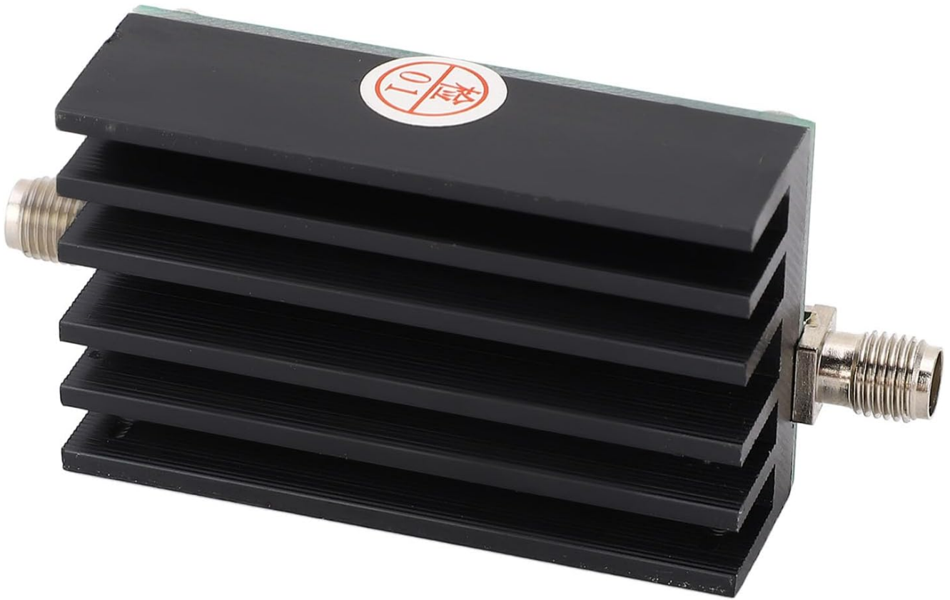
Image: Side profile of the RF amplifier, showing the heatsink and SMA connectors.