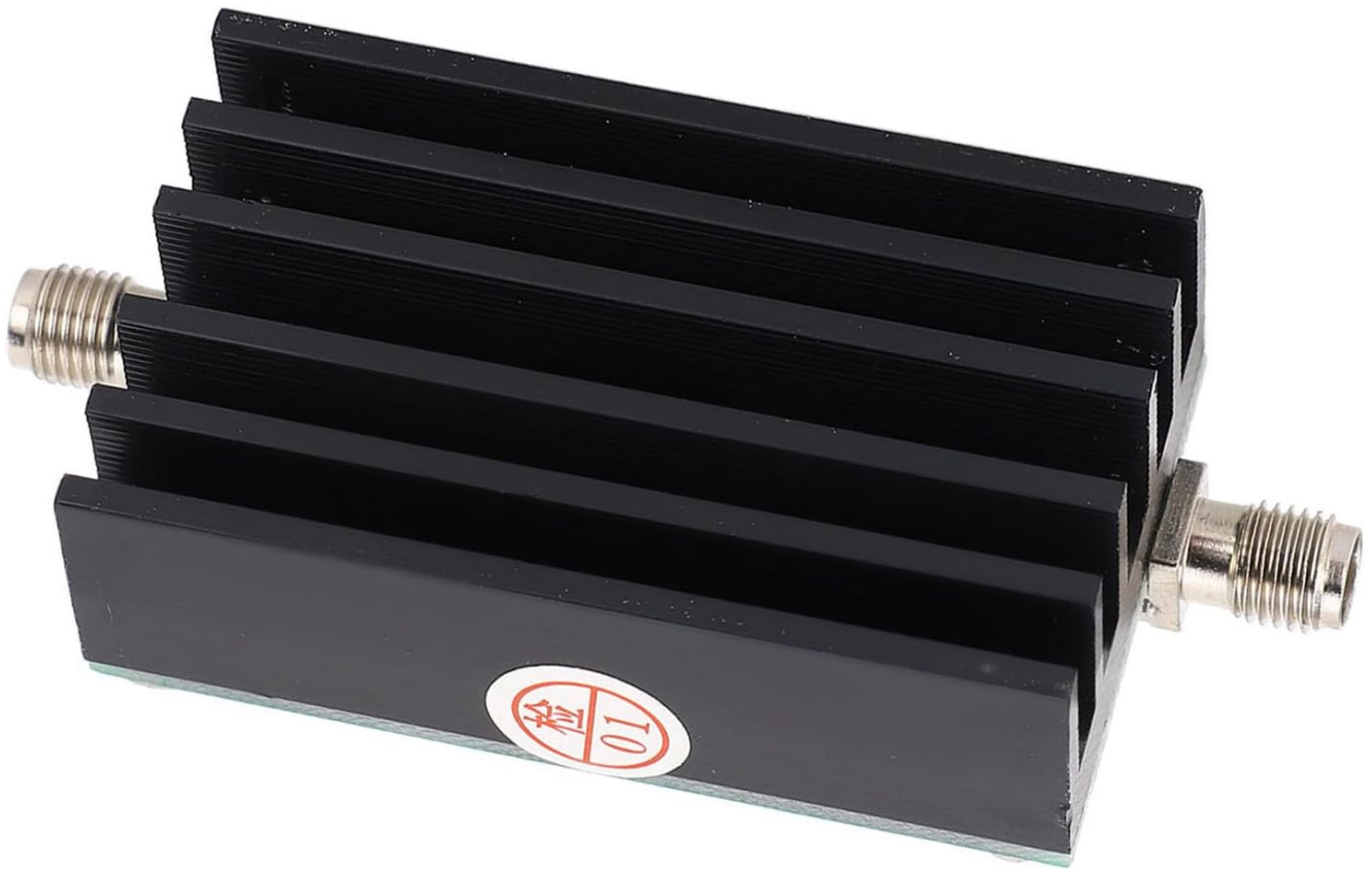
Image: Angled view of the RF amplifier, emphasizing the heatsink structure for thermal management.