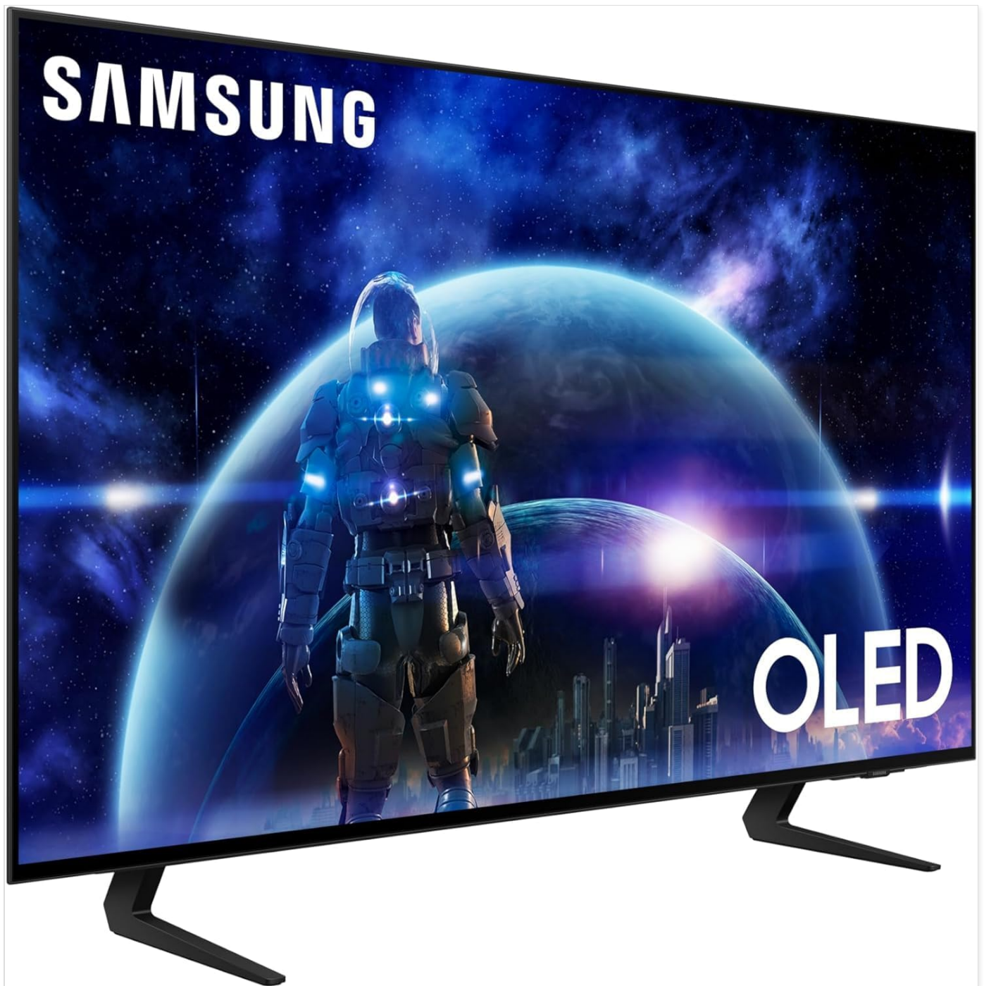
Figure 2: The Samsung QN42S90DAEXZA TV positioned on its stand, showcasing its design.