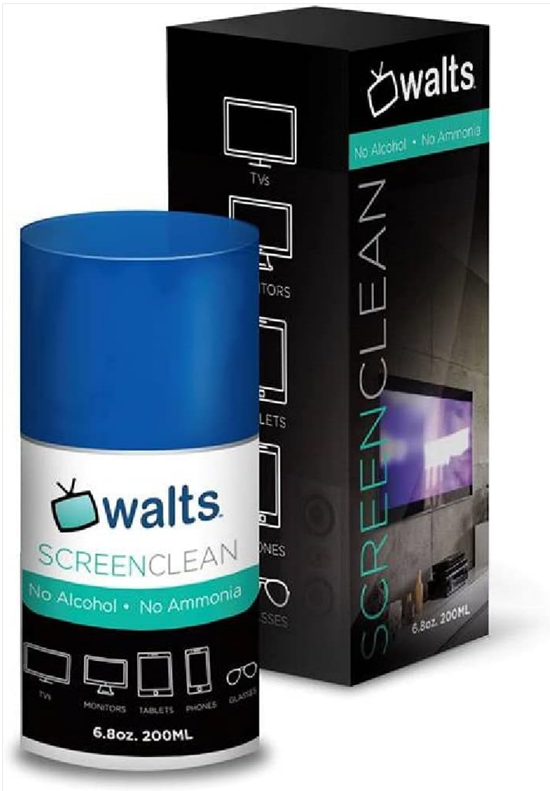
Figure 6: Walts HDTV Screen Cleaner Kit, designed for safe and effective cleaning of TV screens, monitors, tablets, phones, and glasses.