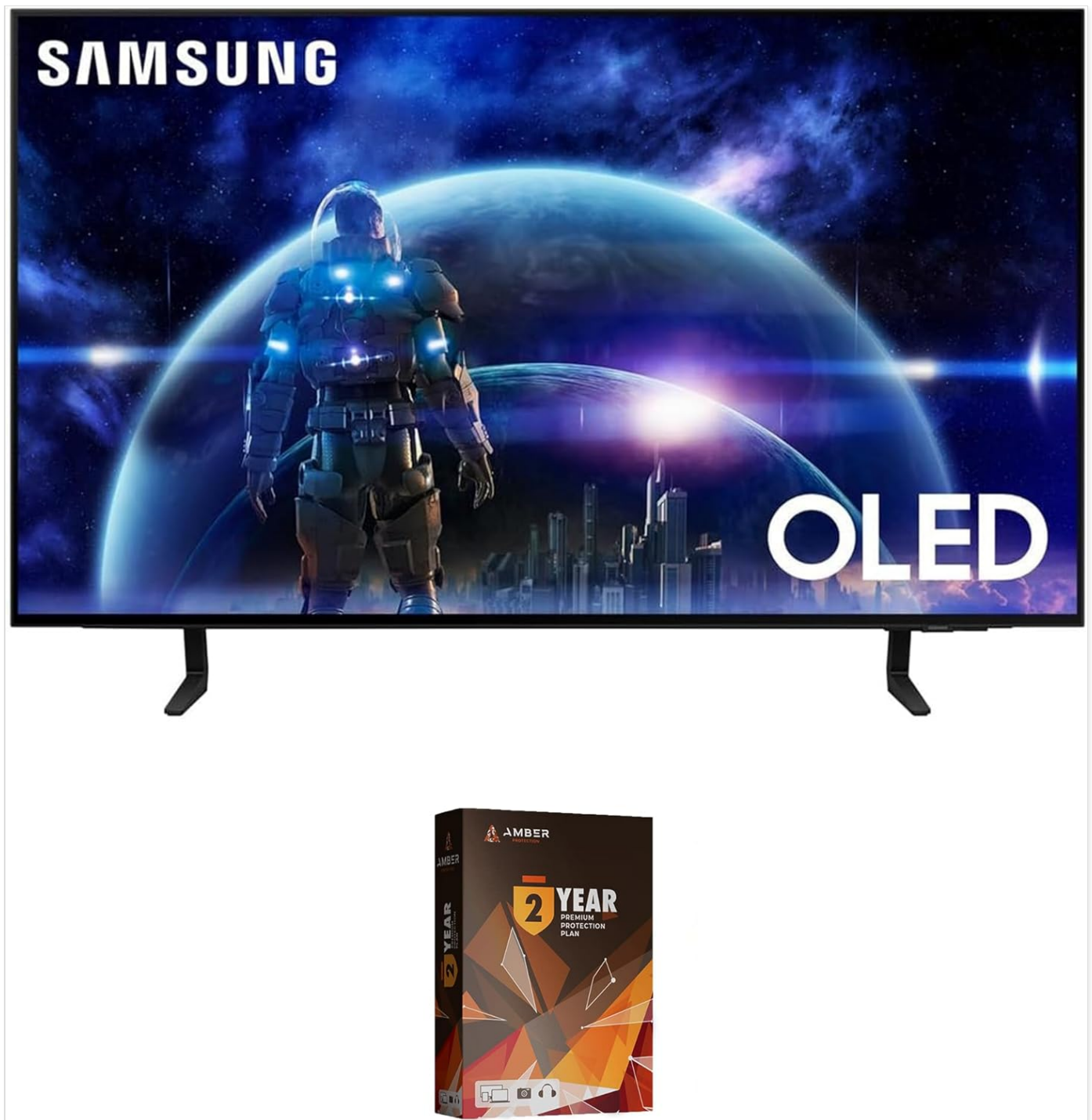
Figure 1: Samsung QN42S90DAEXZA 42 Inch 4K OLED Smart TV with included 2-Year Amber Protection Plan packaging.