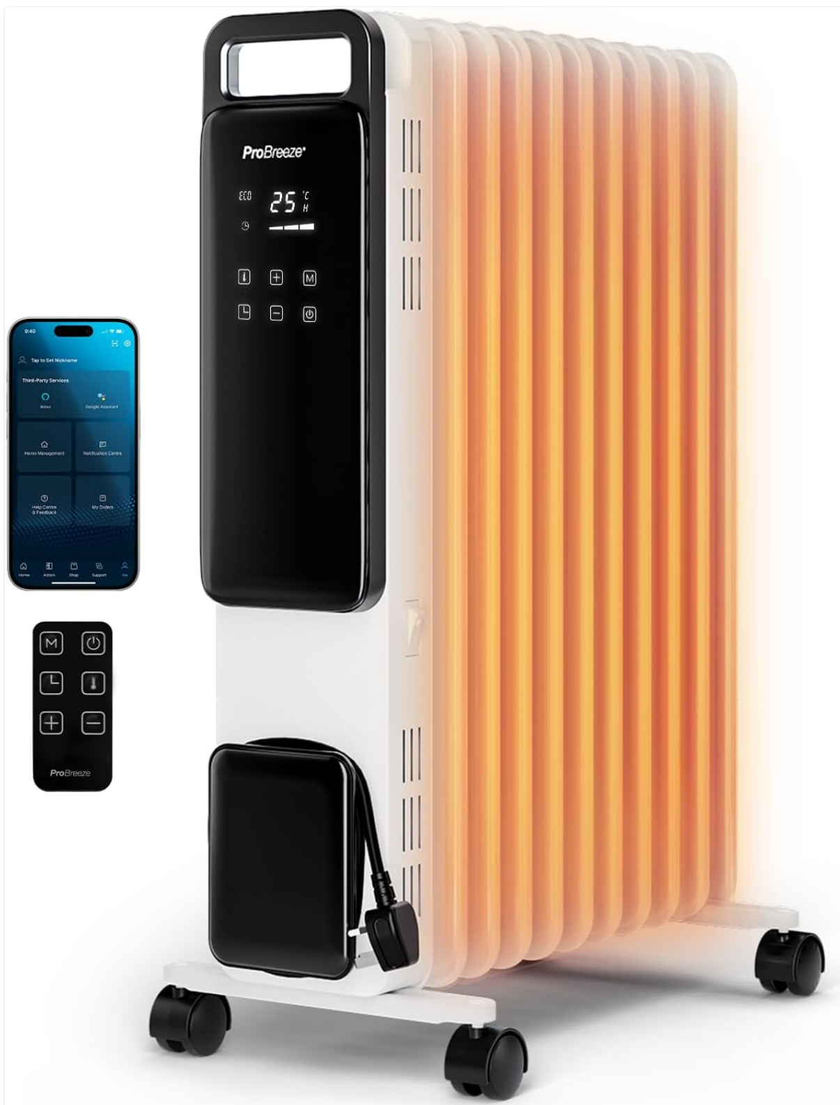
Image: The Pro Breeze 2500W Smart Oil Filled Radiator, showcasing its main unit, remote control, and smartphone app interface.