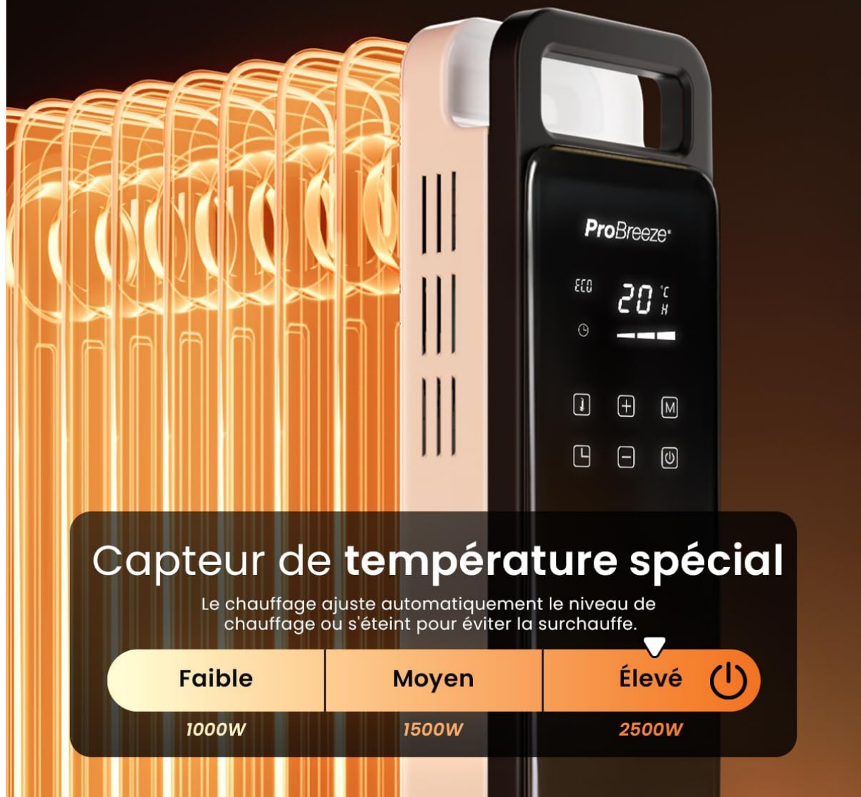
Image: The radiator's control panel displaying the three power levels: 1000W (Low), 1500W (Medium), and 2500W (High).

Choisissez parmi 3 niveaux de chauffage puissants ou réglez la température souhaitée pour la sélection automatique.