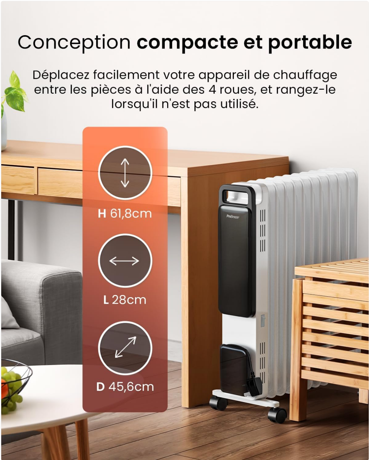
Image: The compact design of the radiator, highlighting its dimensions (Height 61.8cm, Length 28cm, Depth 45.6cm) for easy placement and storage.