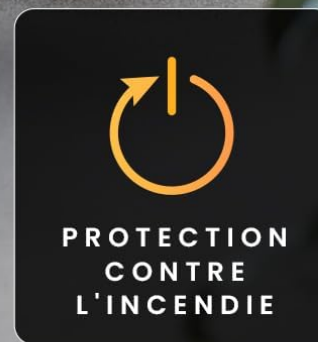
Image: Safety features of the Pro Breeze Oil Filled Radiator, including overheat protection, child lock, and tip-over protection.