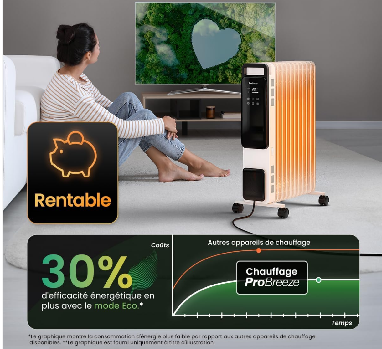
Image: A visual representation of the Eco Mode's energy-saving benefits, showing a comparison of energy consumption.

Le mode Eco permet d'économiser de l'énergie en adaptant intelligemment le réglage de la puissance afin de maintenir la température que vous souhaitez.