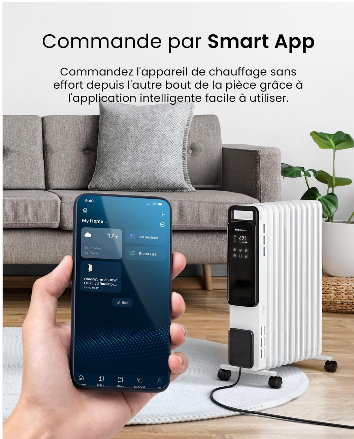
Image: A smartphone showing the Pro Breeze Smart App, demonstrating remote control capabilities for the radiator.