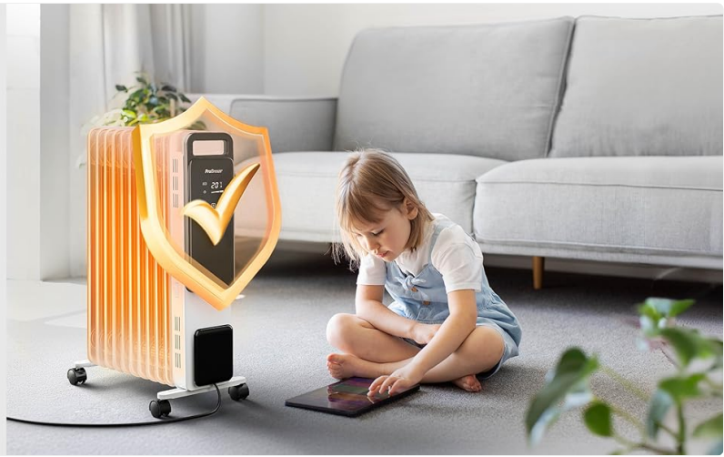
Image: Internal mechanism for overheat protection, ensuring safe operation by automatically adjusting heat or shutting down.