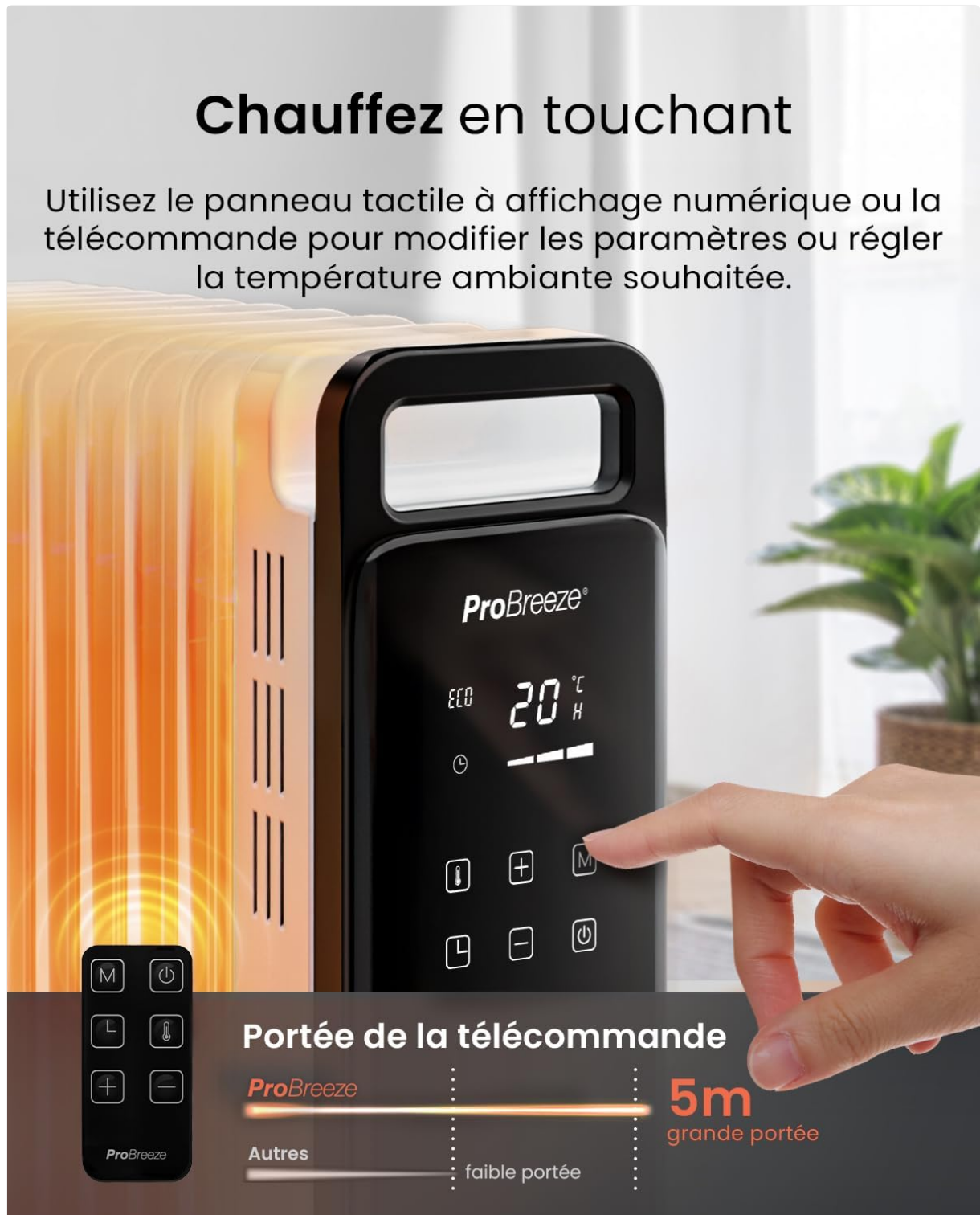
Image: Detailed view of the radiator's touch control panel and the included remote control, illustrating manual operation.