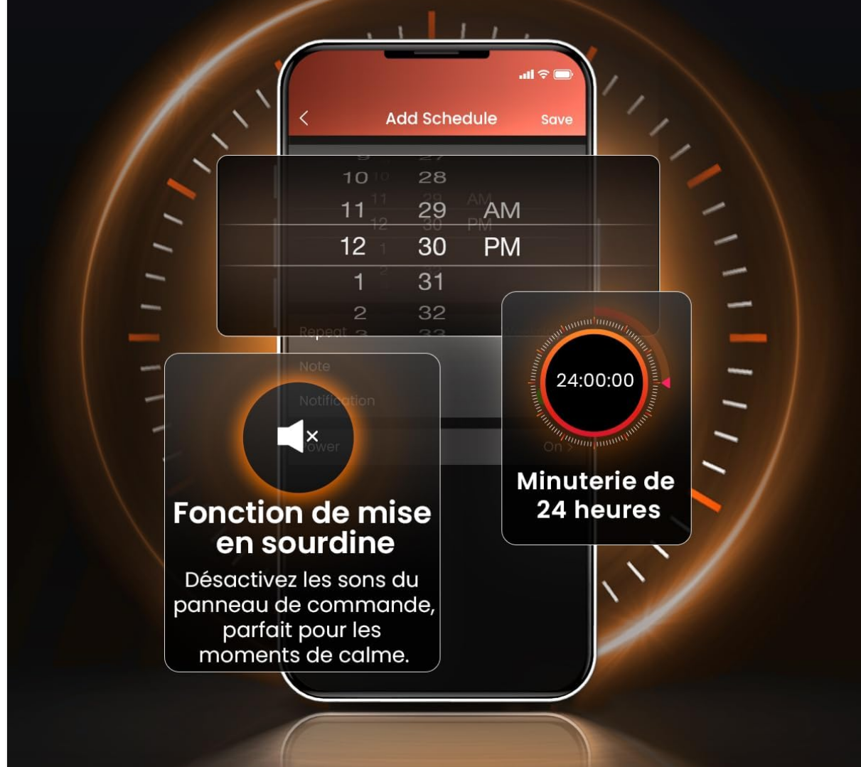
Image: The smart app's scheduling feature, demonstrating how to set the 24-hour timer and activate the mute function for quiet operation.

Créez un planning de chauffage intelligent avec la fonction calendrier de l'application pour allumer et éteindre automatiquement votre chauffage à la température ambiante souhaitée.