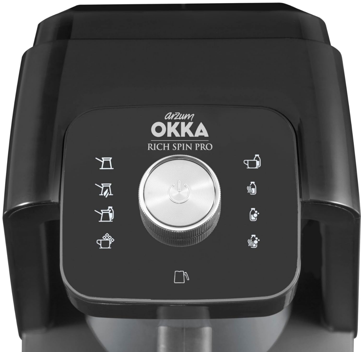
Image: Top-down view of the control panel, featuring the central rotary knob and various function icons for different beverage types.