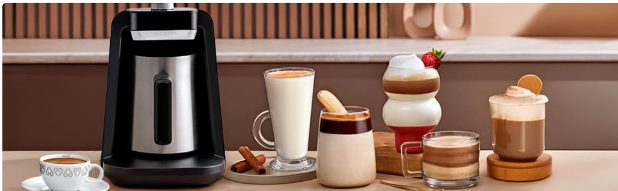
Image: The ARZUM OKKA RICH SPIN PRO Turkish Coffee Machine displayed with several prepared coffee and milk-based beverages, showcasing its versatility.

Welcome to the user manual for your new ARZUM OKKA RICH SPIN PRO Turkish Coffee Machine. This appliance is designed to prepare authentic Turkish coffee, milk coffee, and hot chocolate with ease and precision. Please read this manual carefully before first use to ensure safe operation and optimal performance.