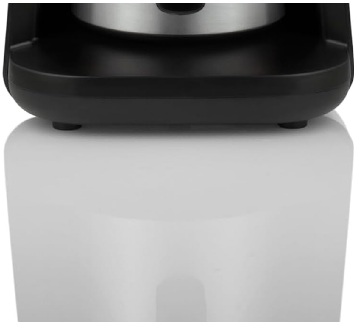
Image: Front view of the ARZUM OKKA RICH SPIN PRO, showing the main body and the removable stainless steel pot.