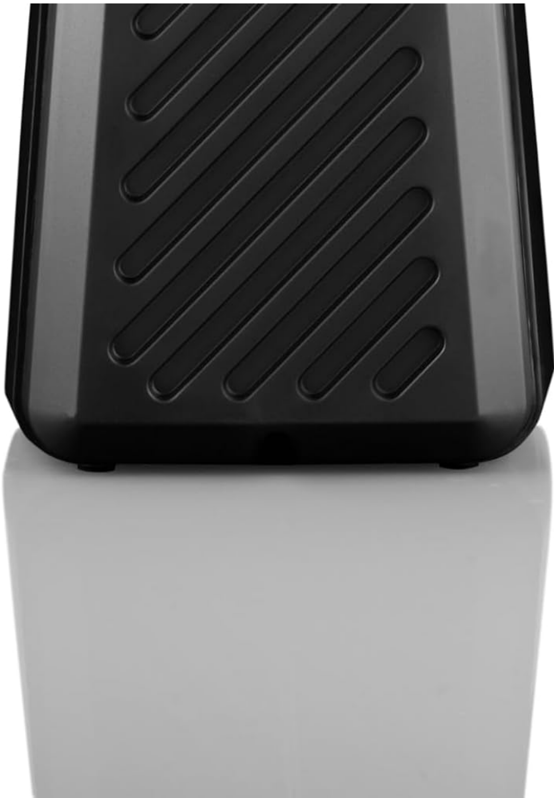
Image: Rear view of the ARZUM OKKA RICH SPIN PRO, showing the power cord connection and ventilation.