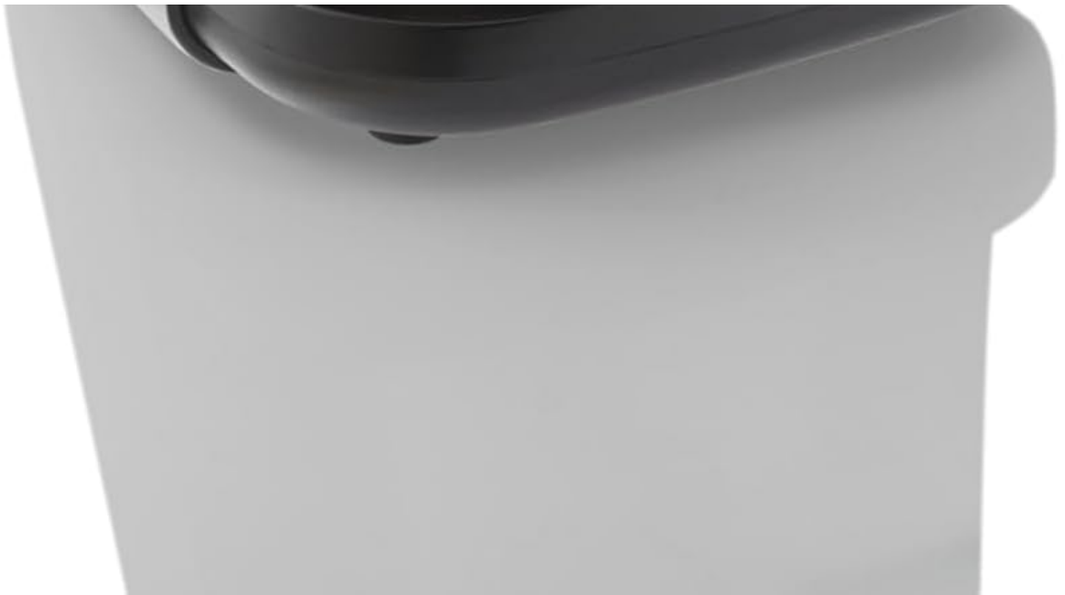
Image: Side view of the ARZUM OKKA RICH SPIN PRO Turkish Coffee Machine, highlighting its sleek chrome design and compact form factor.