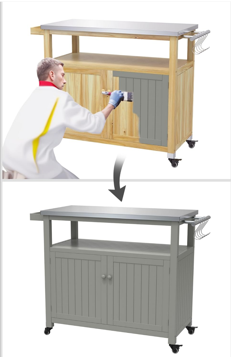
Image: The natural wood finish of this cabinet can be personalized by painting it in a color of your choosing.

The natural wood finish of this cabinet serves as the perfect canvas, inviting you to get creative and personalize it in any color of your choosing through DIY.