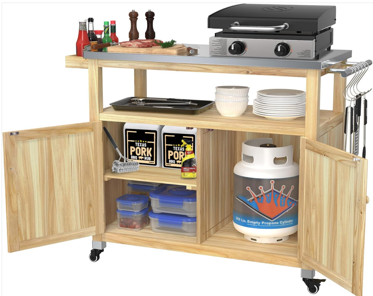
Image: Interior view of the GDLF Outdoor Storage Cabinet showing a propane tank in one compartment and shelves with storage containers in the other.