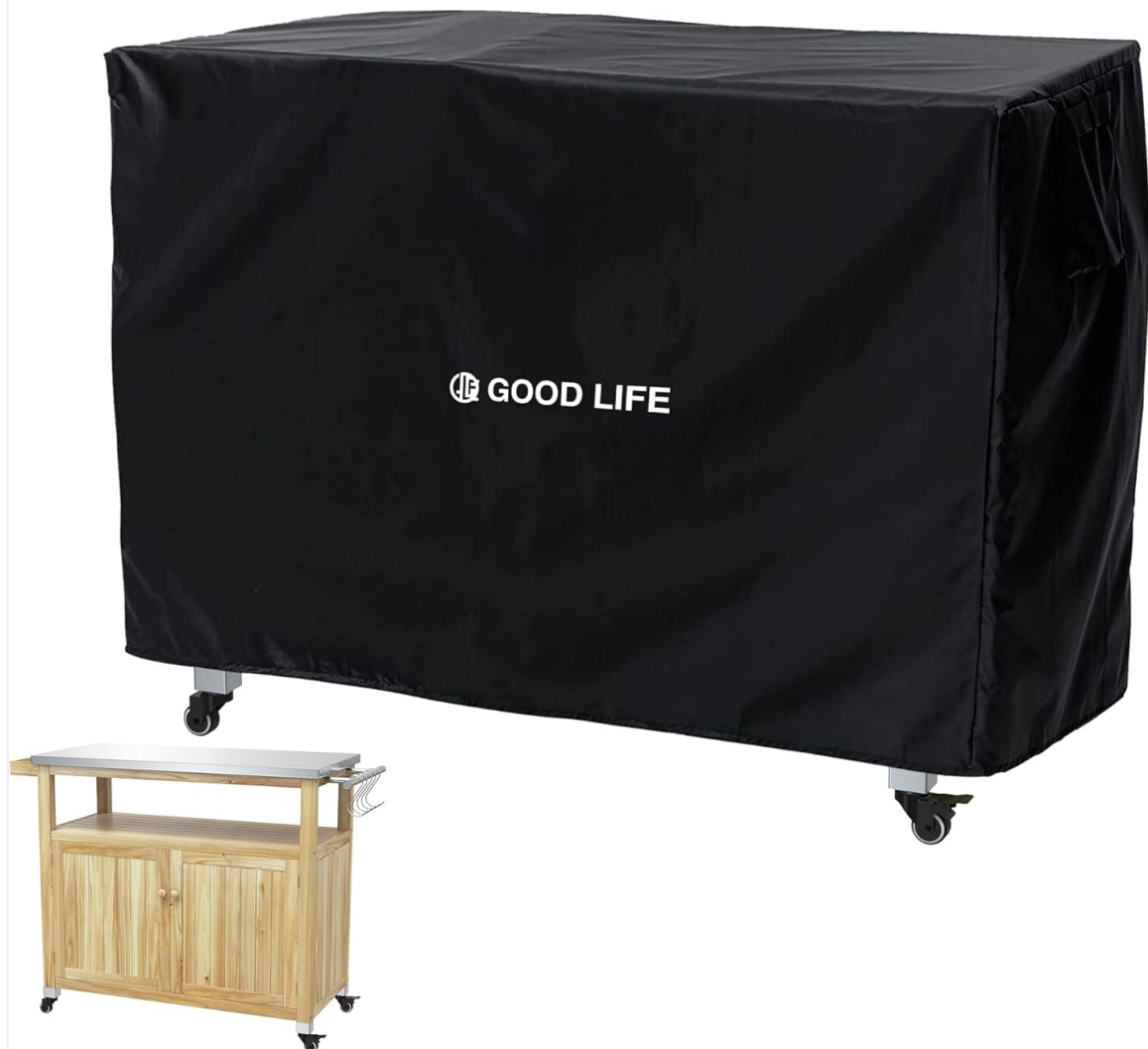
Image: The included waterproof cover protects the unit from weather elements.