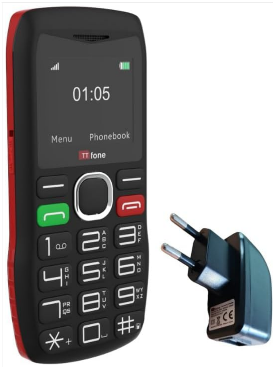
The TTfone TT880 mobile phone shown alongside its included mains charger, ready for initial setup.