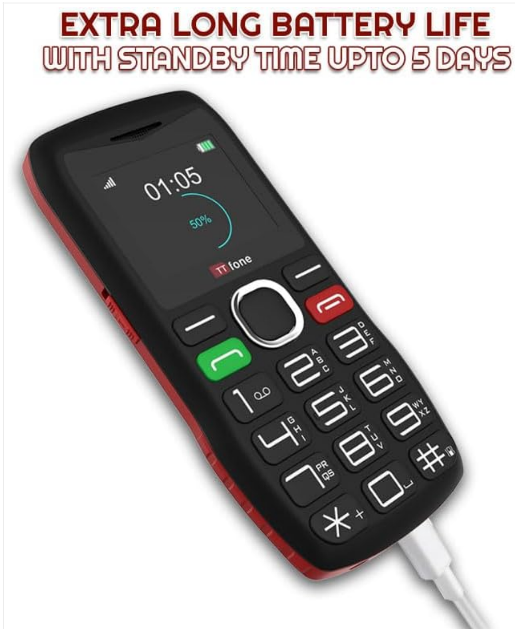
The TTfone TT880 connected via its USB-C port for charging, with the screen indicating battery percentage.