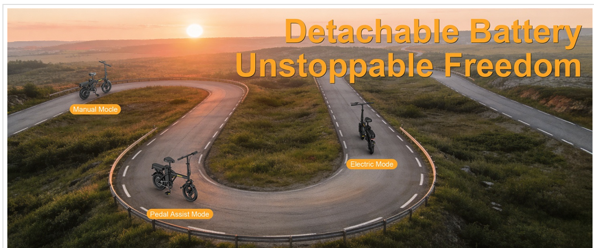
Image: Visual representation of the three riding modes: Electric, Pedal Assist, and Manual.