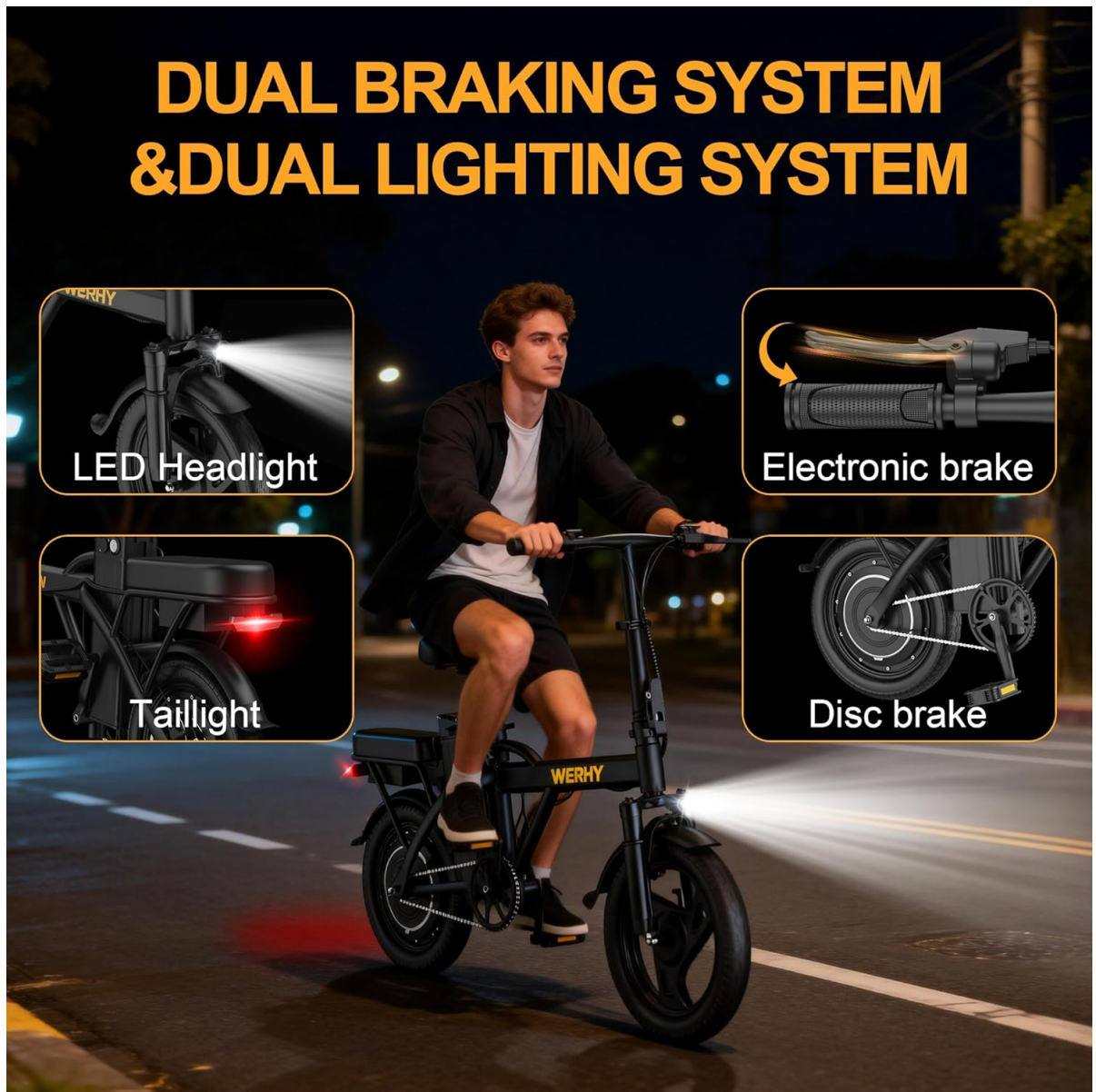
Image: The rear taillight, designed to increase rider visibility from behind.