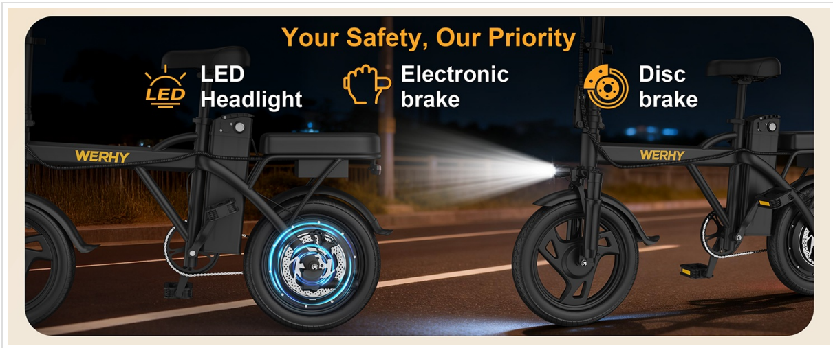
Image: Detail of the front suspension and 14-inch pneumatic tires, which contribute to a smooth ride.