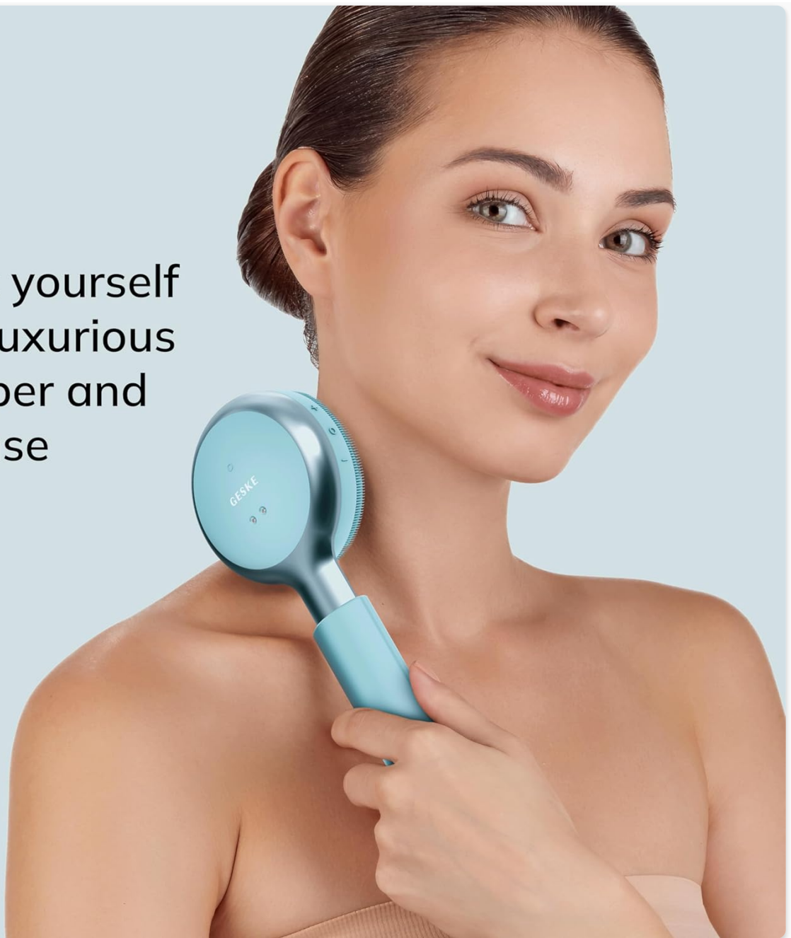
Image: User demonstrating the GESKE LED Sonic Full-Body Brush on the neck area.

Treat yourself to a luxurious pamper and cleanse