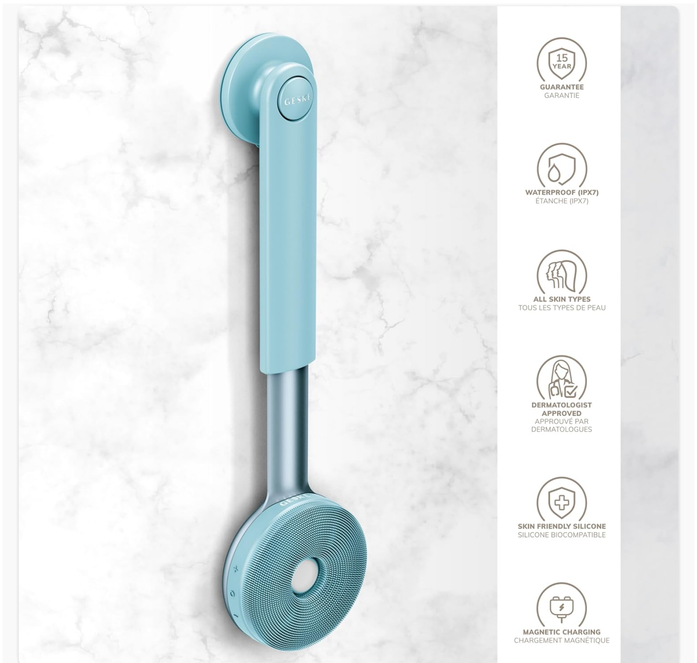
Image: GESKE device highlighting the 15-year guarantee and other features.