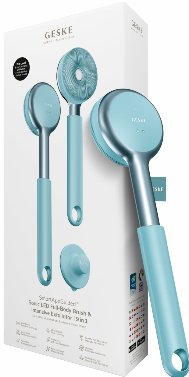
Image: GESKE LED Sonic Full-Body Brush in Turquoise.