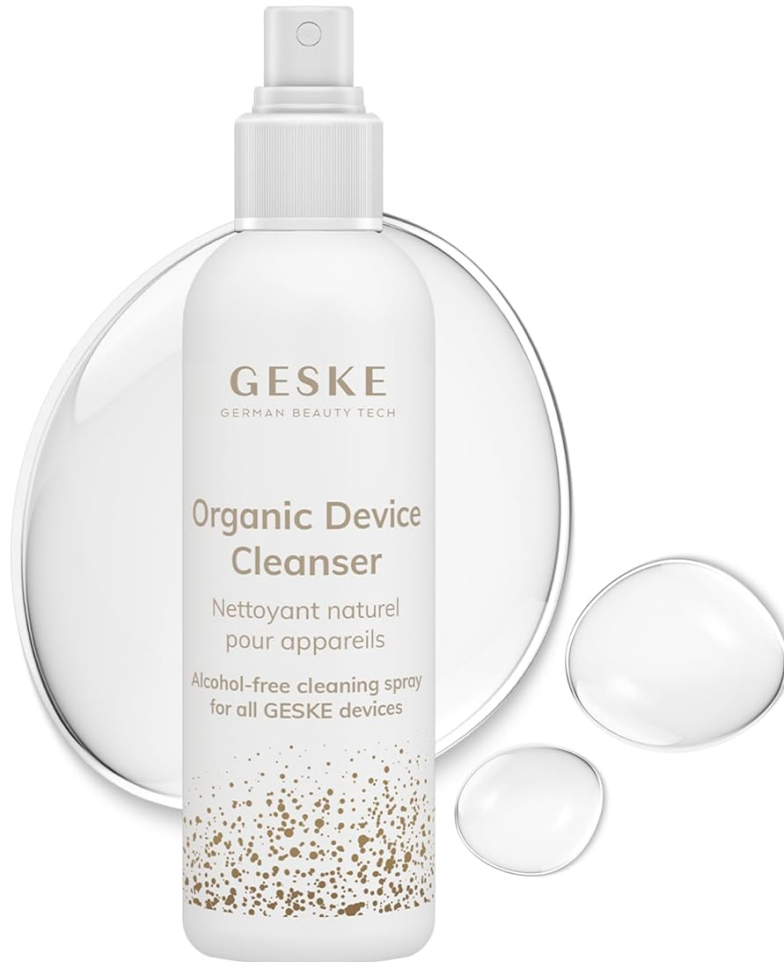
Image: GESKE Organic Device Cleanser for thorough device cleaning.

For the best results, spray on GESKE devices to clean them thoroughly