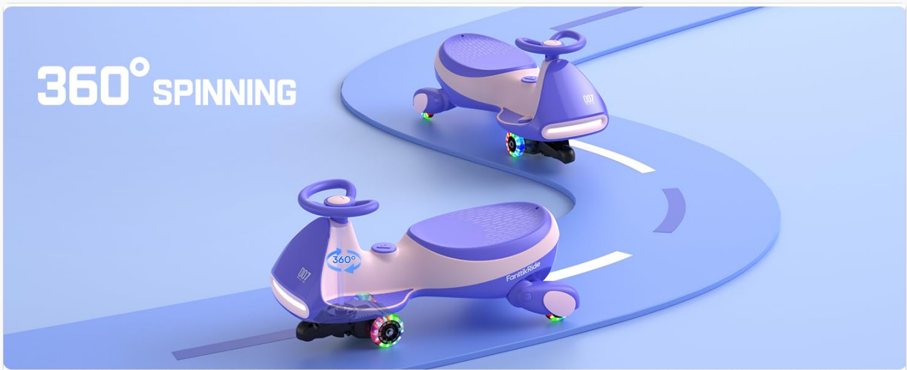
Figure 5: The 360° steering allows for dynamic movement.