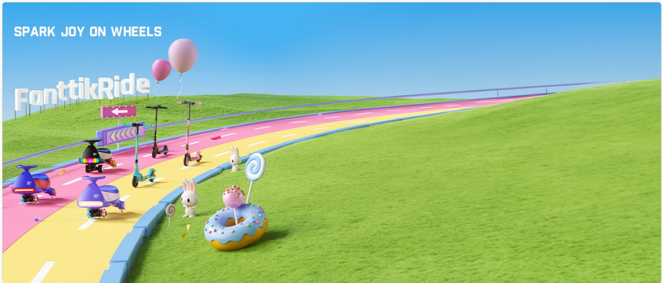
Figure 1: The FanttikRide N7 Classic Electric Wiggle Car, highlighting its dual electric and manual modes.