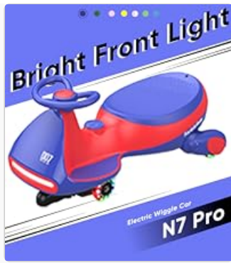
Figure 4: Location of power switch, charging port, and speed control button.