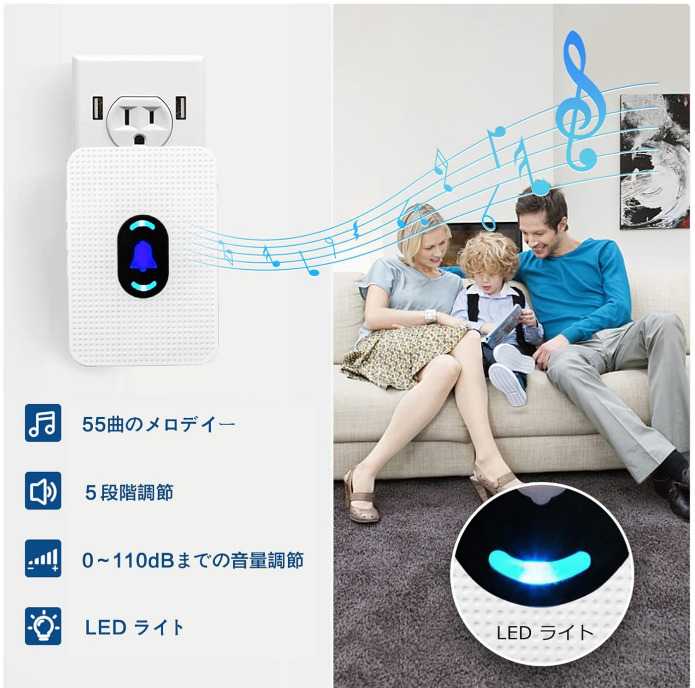
Figure 2.1: Customizable Melodies and Volume Levels

receivers, allowing for flexible system expansion.