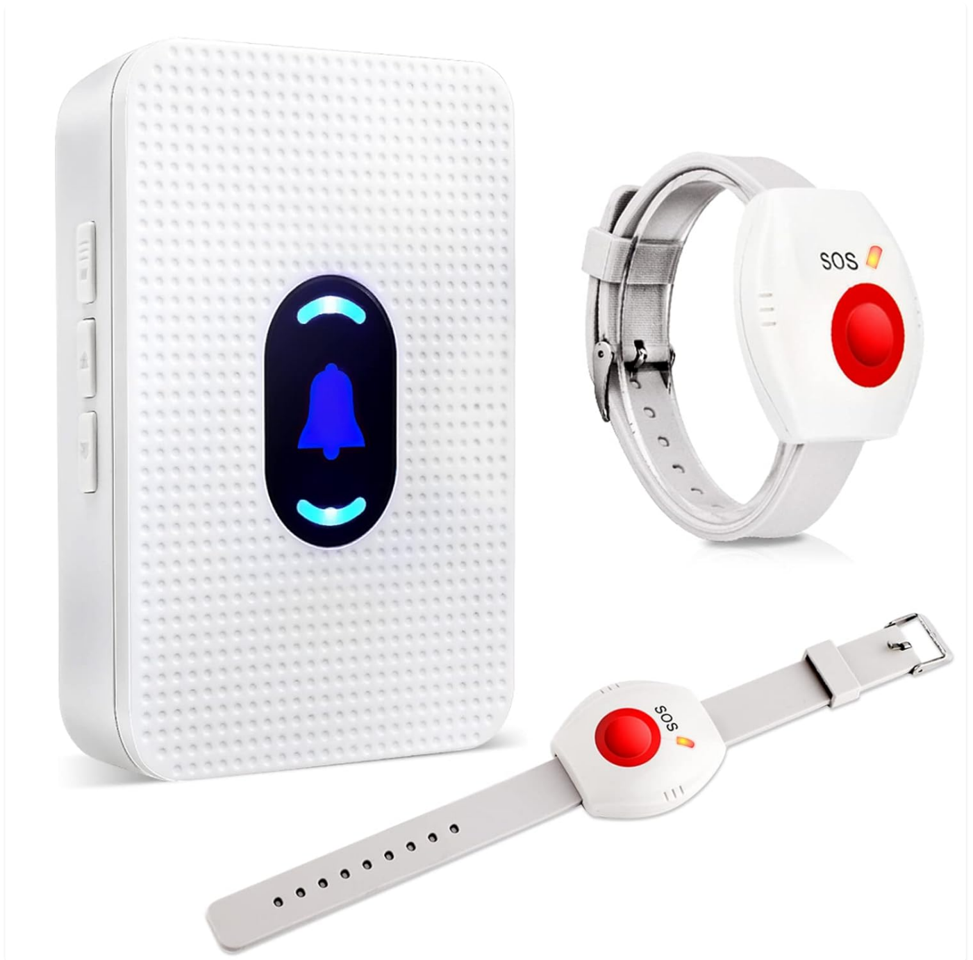
Figure 1.1: DAYTECH Care Call Bell System Components