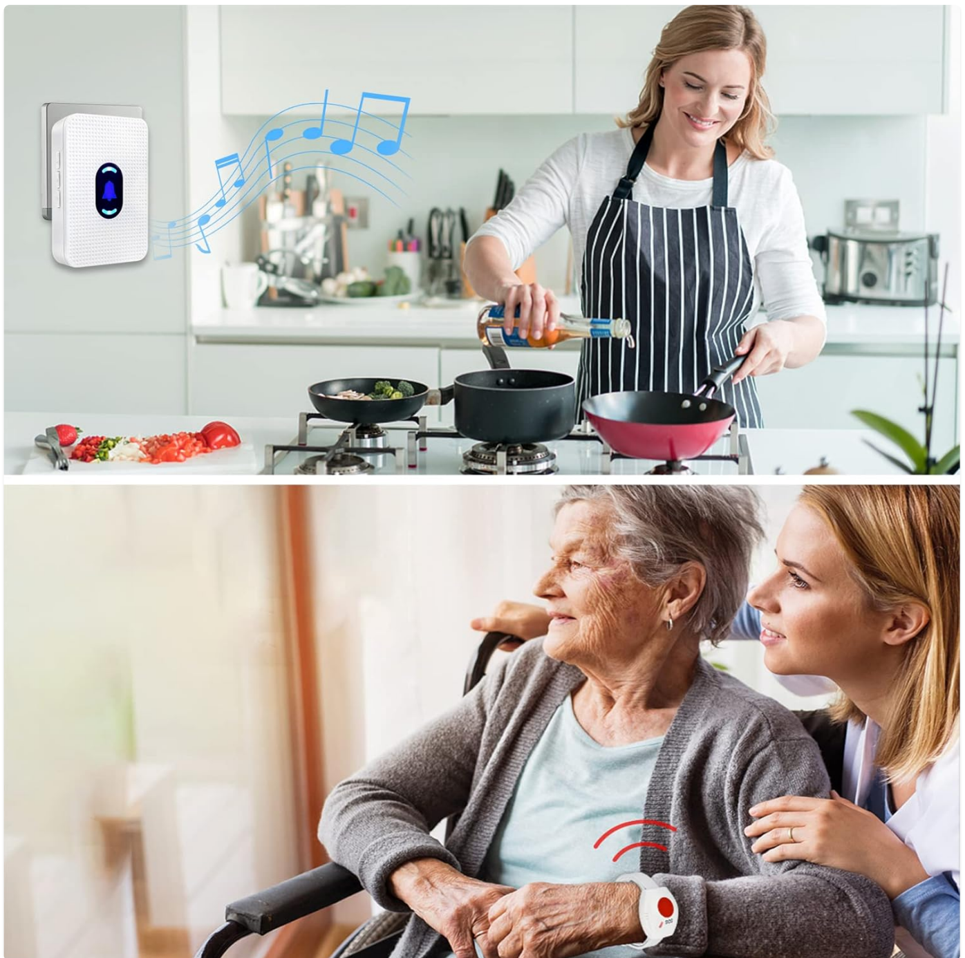
Figure 5.2: Everyday Use Scenarios