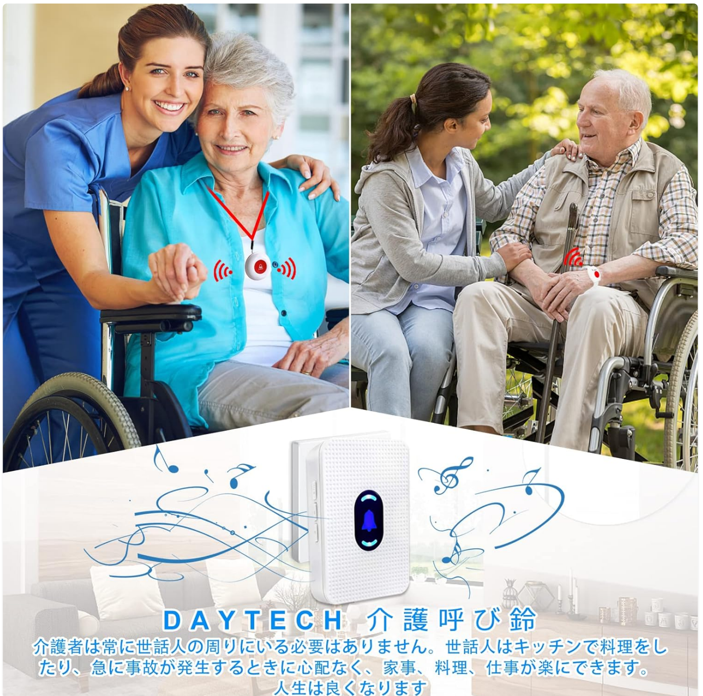
Figure 5.1: Caregiver and Patient Interaction with the System