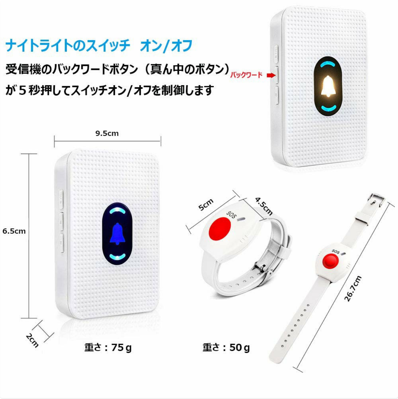
Figure 8.1: Product Dimensions Overview

DAYTECH provides a Lifetime Quality Guarantee for this product from the date of purchase. If you encounter any issues during use, please do not hesitate to contact us. We are committed to providing prompt support and ensuring your complete satisfaction.