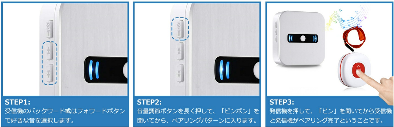
Image: Detailed steps for changing the melody and pairing the transmitter with the receiver.

The system supports up to 30 additional transmitters or receivers, allowing for expansion as needed.