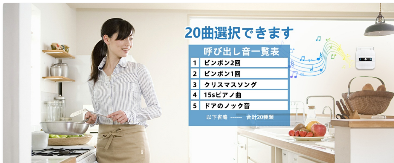
Image: A selection of 20 melodies is available for customization, allowing users to choose their preferred alert sound.

Image: The receiver offers 5 adjustable volume levels, from silent (0dB) to very loud (110dB), suitable for different environments.