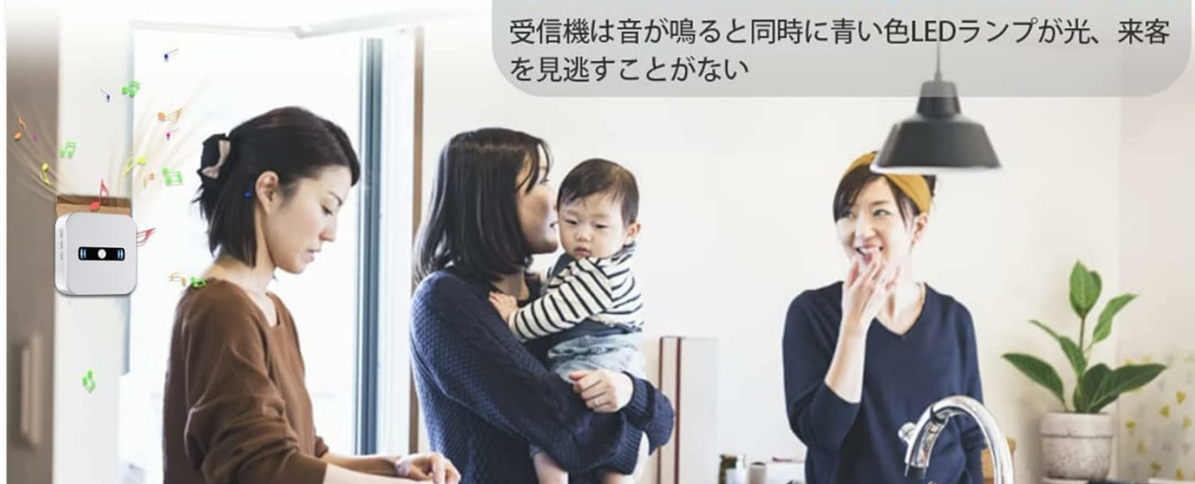
Image: The system notifies simultaneously with sound and light, ensuring alerts are not missed in various household situations.