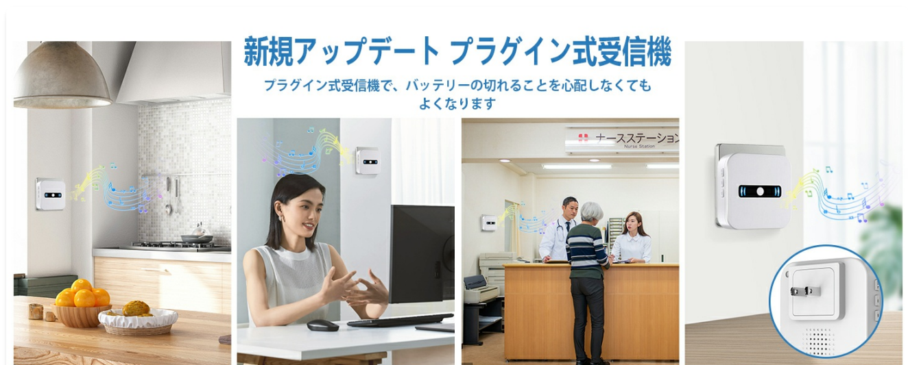
Image: The plug-in receiver can be easily installed in any standard electrical outlet, eliminating the need for batteries.

The receiver is a plug-in unit. Simply plug it into a standard electrical outlet in a central location where the alert can be easily heard and seen.