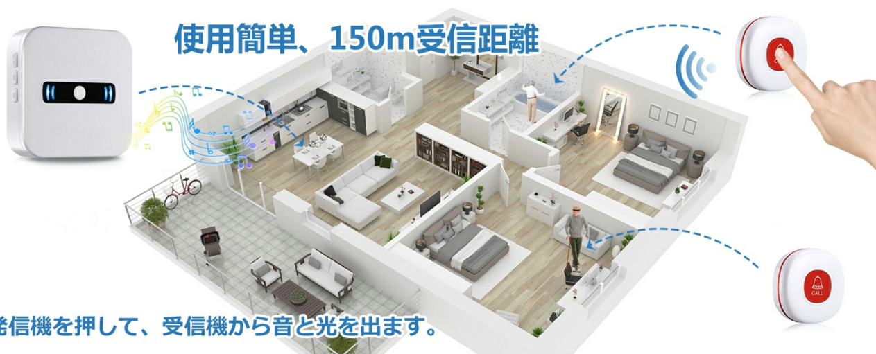
Image: The system provides a wide communication range of up to 150 meters, covering multiple rooms and floors within a residence.

The system boasts a communication range of up to 150 meters (492 feet) in open areas, making it effective across multiple rooms or floors in a typical home or office environment.