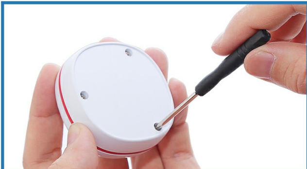
STEP1: ドライバーを使って3本のネジをこじ開けます。