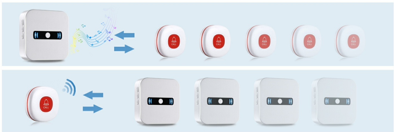
Image: The system's expandability, allowing for up to 30 additional transmitters or receivers.