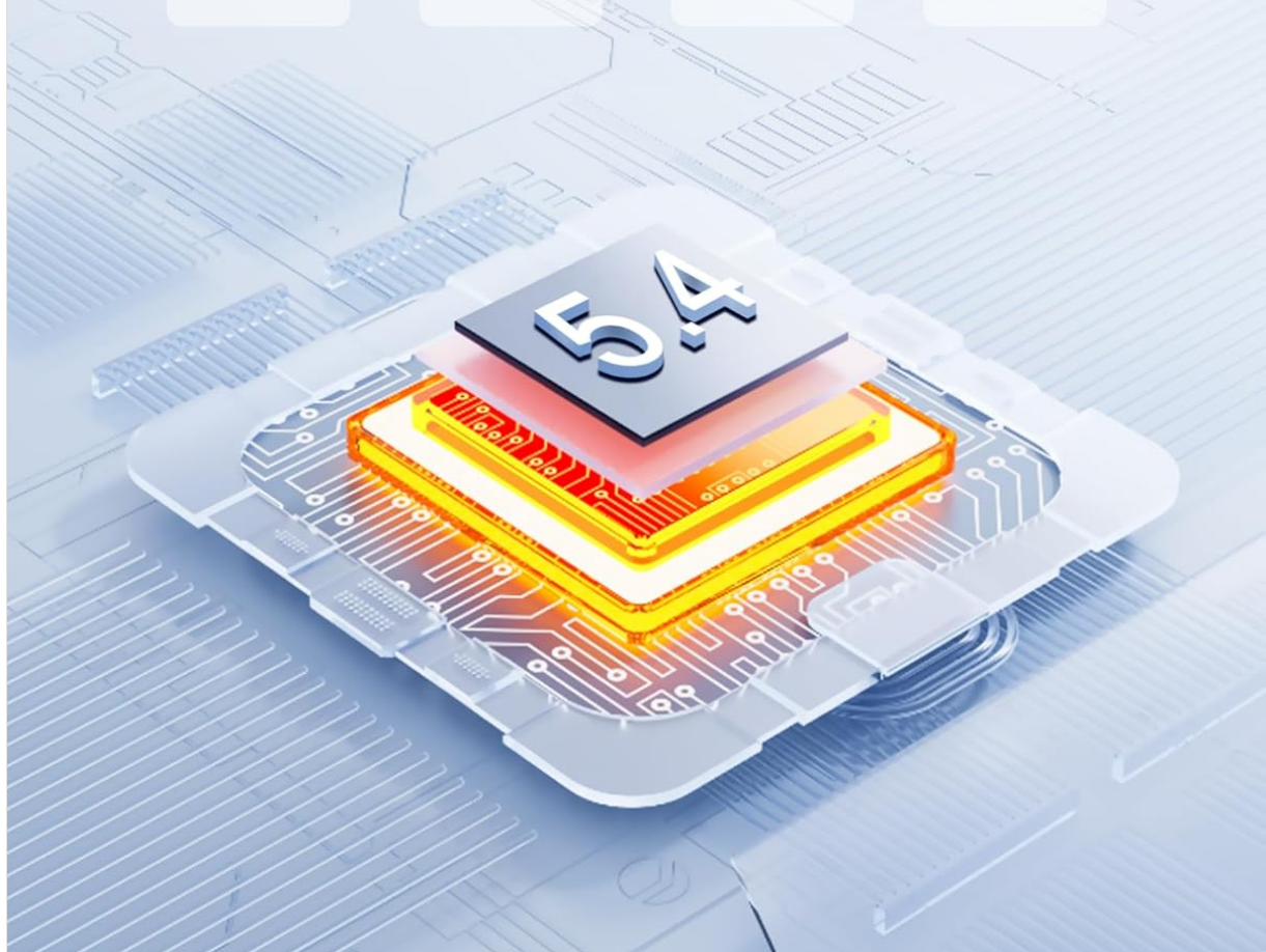
Image: A diagram highlighting the key features of the high-performance Bluetooth 5.4 chip: Low Latency, High Performance, Plug and Play, and High Transmission Rate.