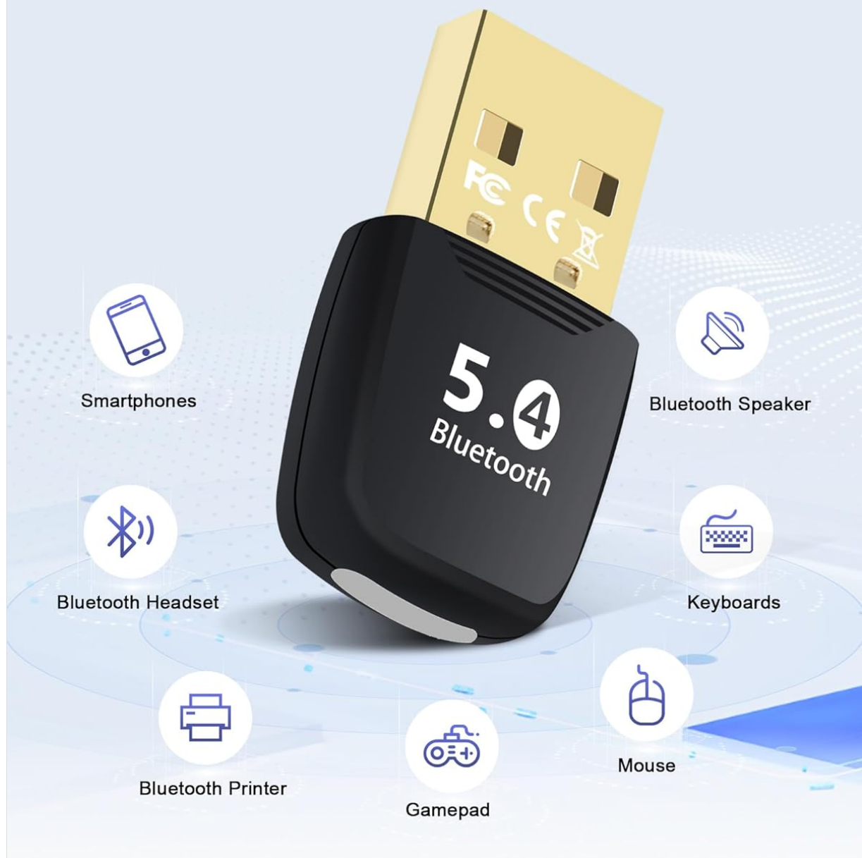
Image: The RUIZHI Bluetooth 5.4 Dongle-Adapter shown with icons representing various compatible devices such as smartphones, Bluetooth speakers, headsets, keyboards, printers, gamepads, and mice, indicating simultaneous connection support.