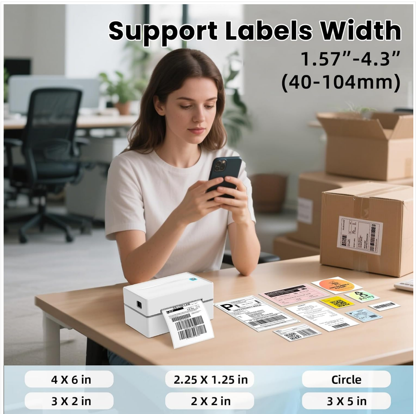
Figure 3: Label Width Support. This image illustrates the printer's compatibility with various label sizes, ranging from 1.57" to 4.3" wide, including 4x6 inch shipping labels, 3x2 inch, 2.25x1.25 inch, 2x2 inch, 3x5 inch, and circular labels.