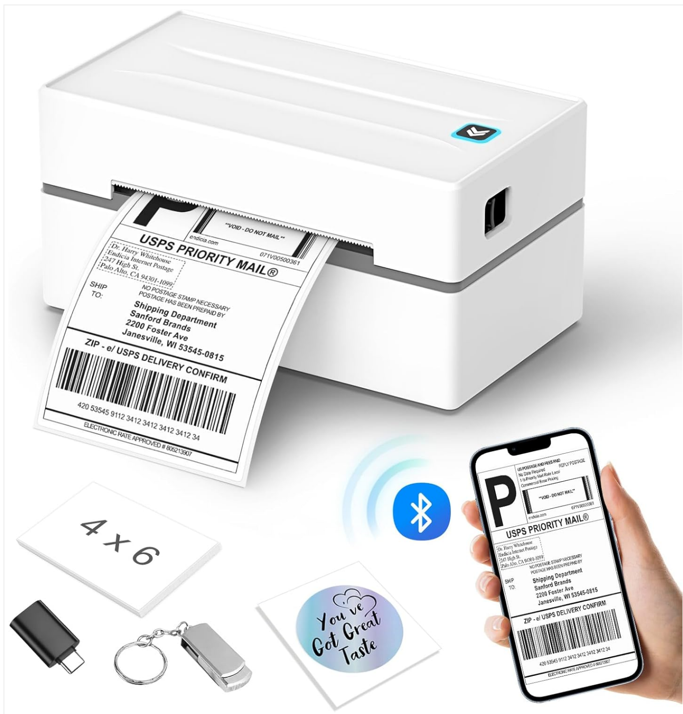
Figure 1: Anycash Y812 Bluetooth Thermal Label Printer. This image shows the compact white printer actively printing a shipping label, alongside a smartphone demonstrating mobile label creation and a stack of 4x6 labels.