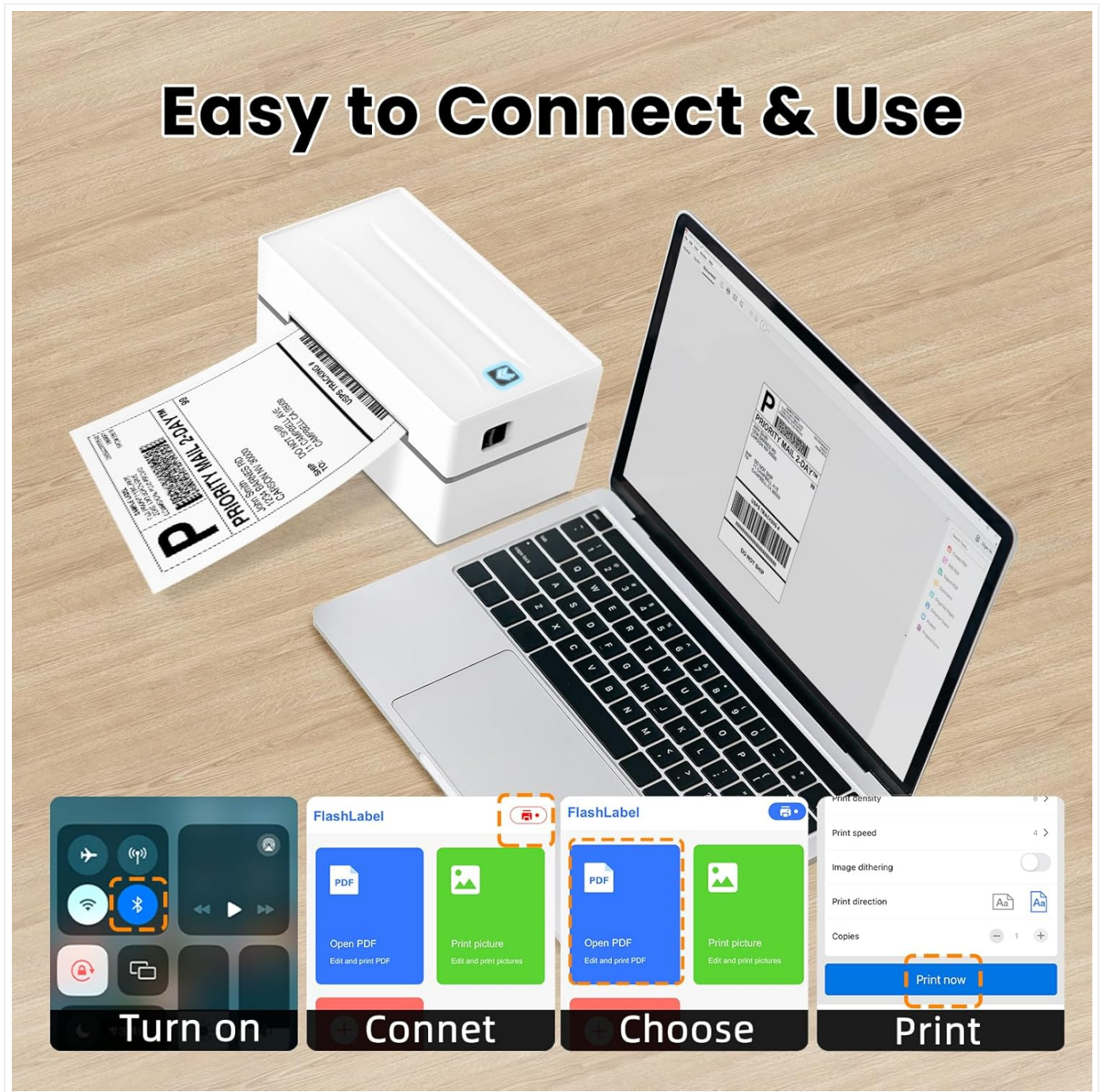
Figure 4: Bluetooth Connection Steps. This image provides a visual guide to connecting the printer via Bluetooth using the FlashLabel app, showing steps from turning on Bluetooth to initiating print.