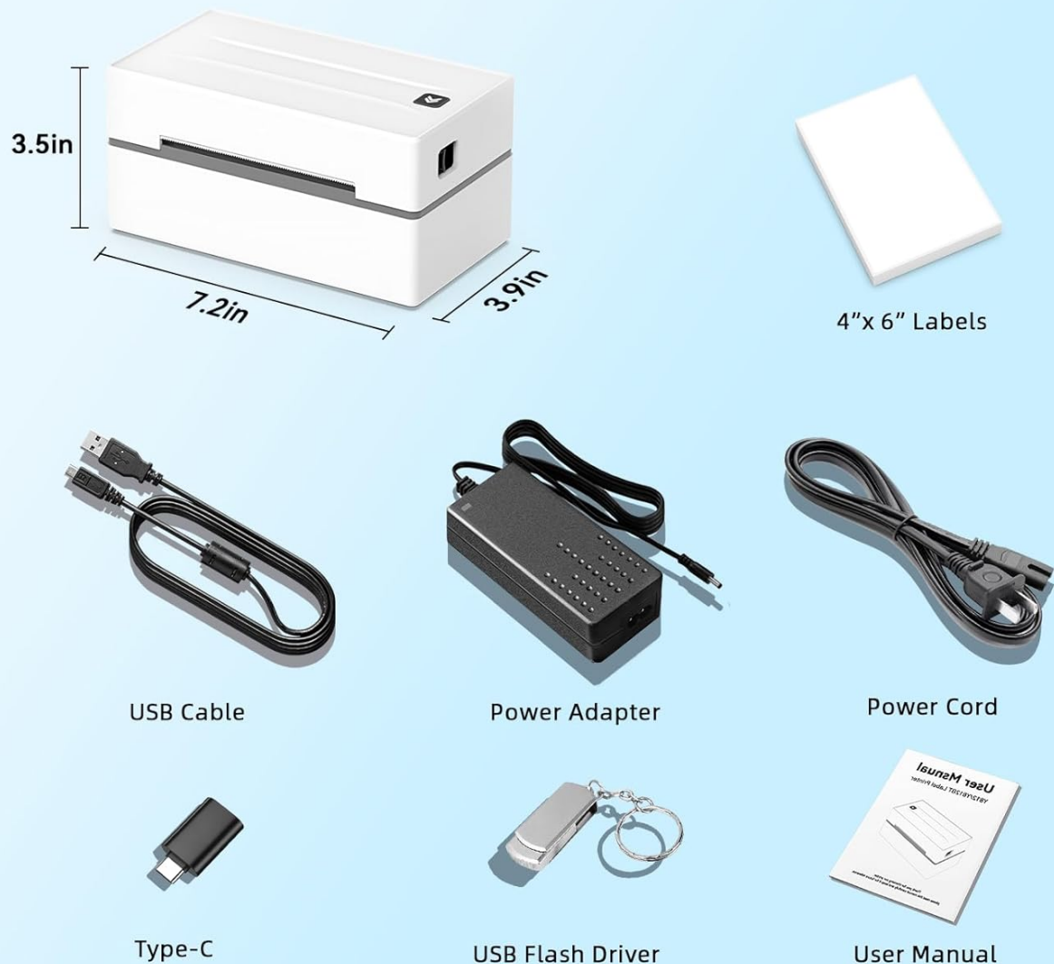
Figure 2: Package Contents. This image displays the Y812 printer, 4x6 labels, USB cable, power adapter, power cord, Type-C adapter, USB flash drive, and the user manual.