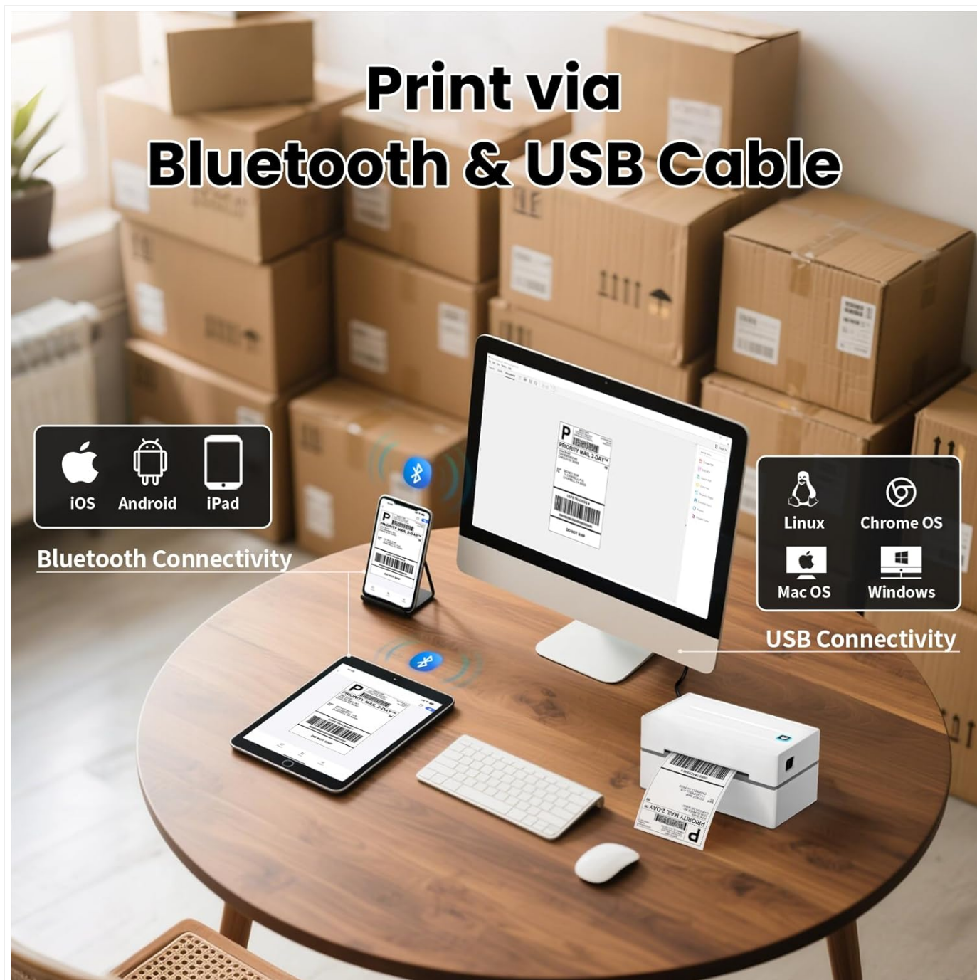
Figure 5: Connectivity Options. This image illustrates the dual connectivity of the printer, showing Bluetooth connection to iOS/Android devices and USB connection to Windows, Mac OS, Linux, and Chrome OS computers.