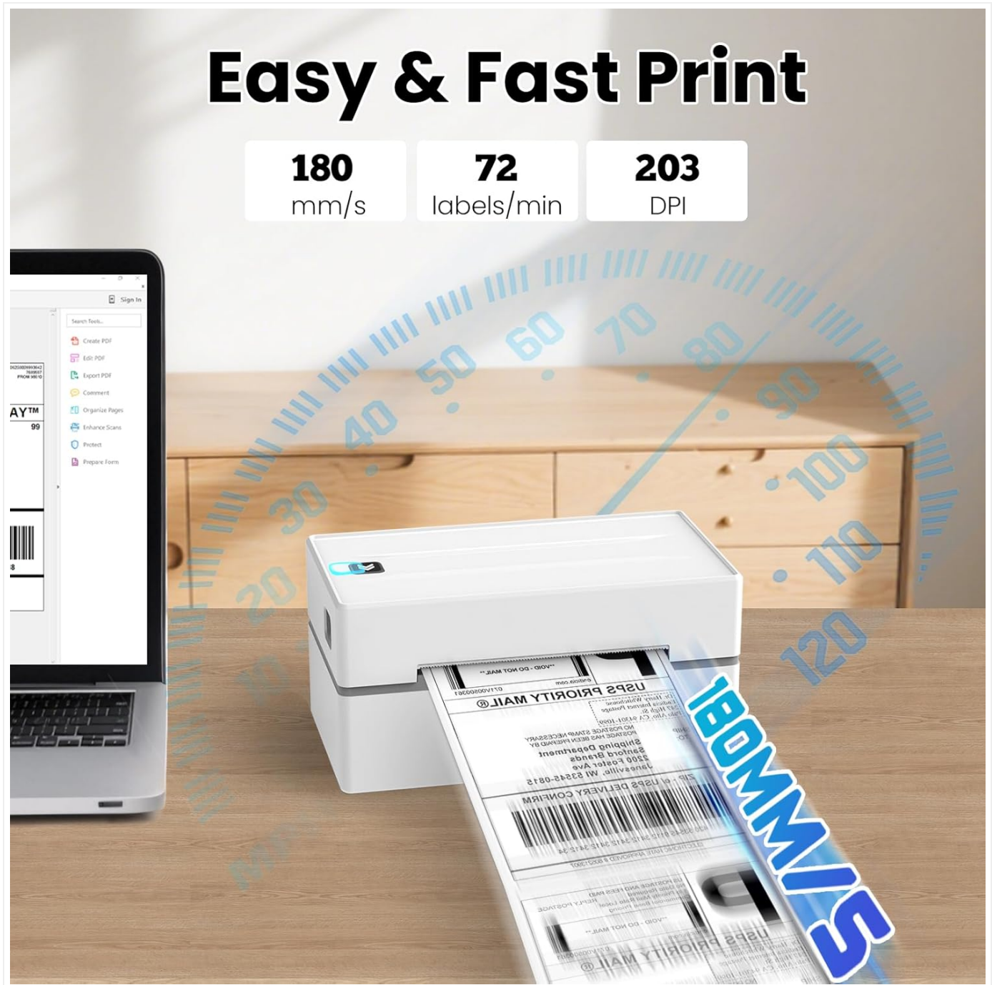
Figure 6: High-Speed and Clear Printing. This image highlights the printer's performance with indicators for 180 mm/s print speed, 72 labels/min output, and 203 DPI resolution.

The Y812 thermal label printer boasts a high printing speed of 180mm/s, capable of printing approximately 72 labels per minute with a clear 203 DPI resolution.