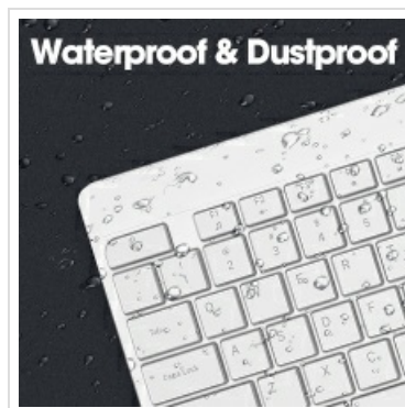
Figure 6: Waterproof Keyboard Design

The keyboard features a waterproof design, offering protection against accidental spills. To clean, gently wipe the surfaces of the keyboard and mouse with a soft, damp cloth. Avoid using harsh chemicals or abrasive materials. Ensure the devices are completely dry before use.