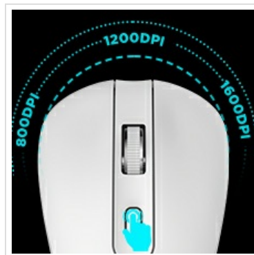
Figure 4: Mouse DPI Settings