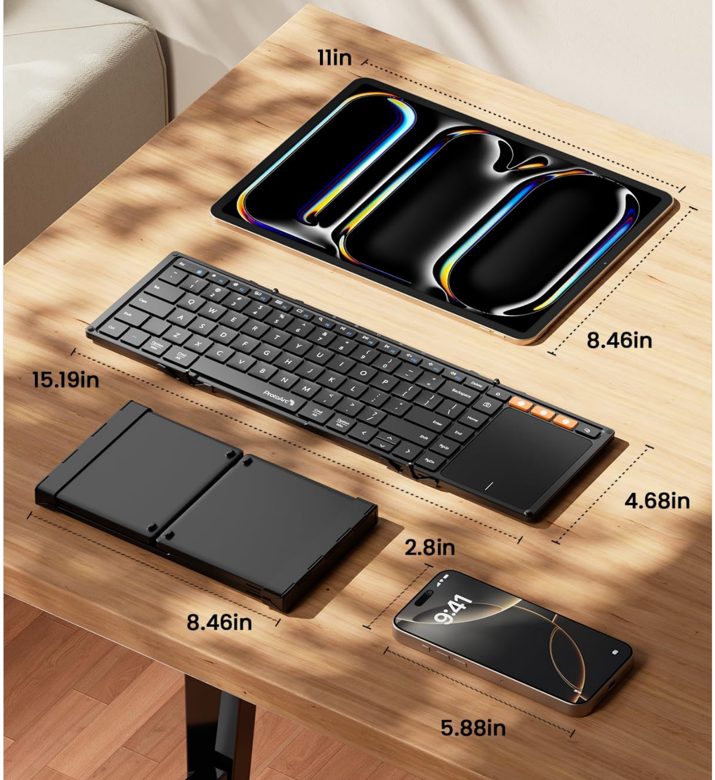
Image: Visual representation of the keyboard's tri-fold mechanism, displaying its unfolded and folded dimensions, with a smartphone for scale.