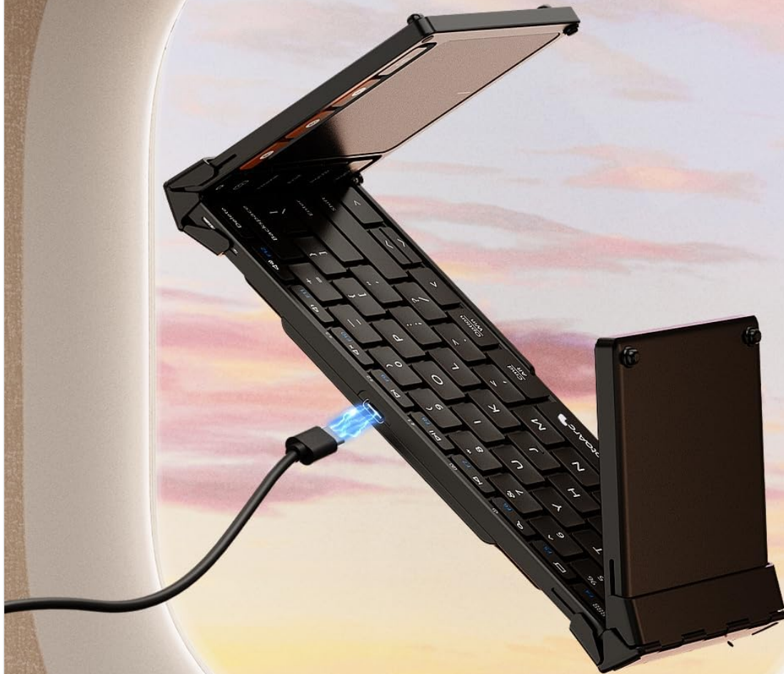
Image: The ProtoArc keyboard connected to a USB-C charging cable, with visual indicators for its long standby time (150 days) and quick charge time (2 hours).