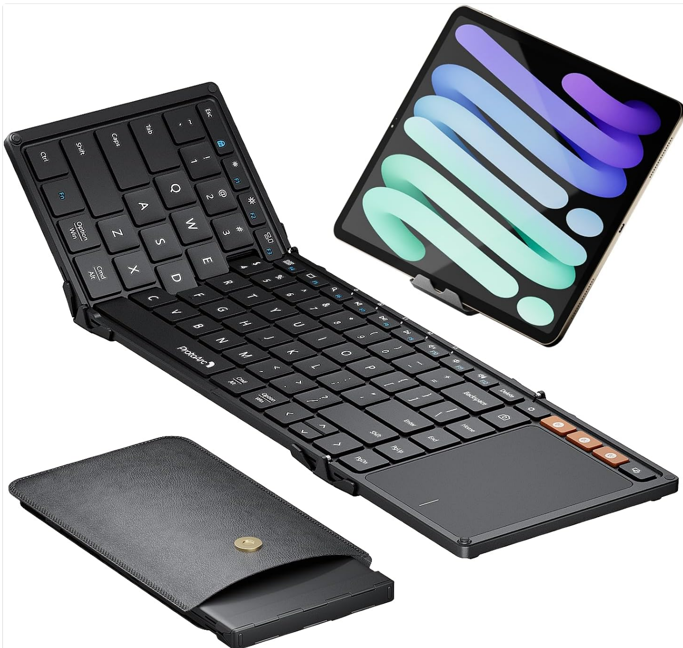
Image: The ProtoArc XK01 TP Foldable Keyboard, unfolded and ready for use, alongside a tablet on a stand and its protective carrying pouch.