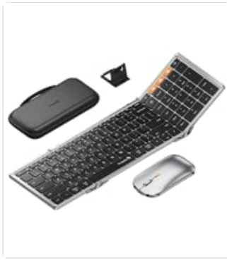
Image: All items included in the ProtoArc XK01 TP package: the foldable keyboard, USB-C charging cable, PU storage pouch, phone stand, and the user manual.