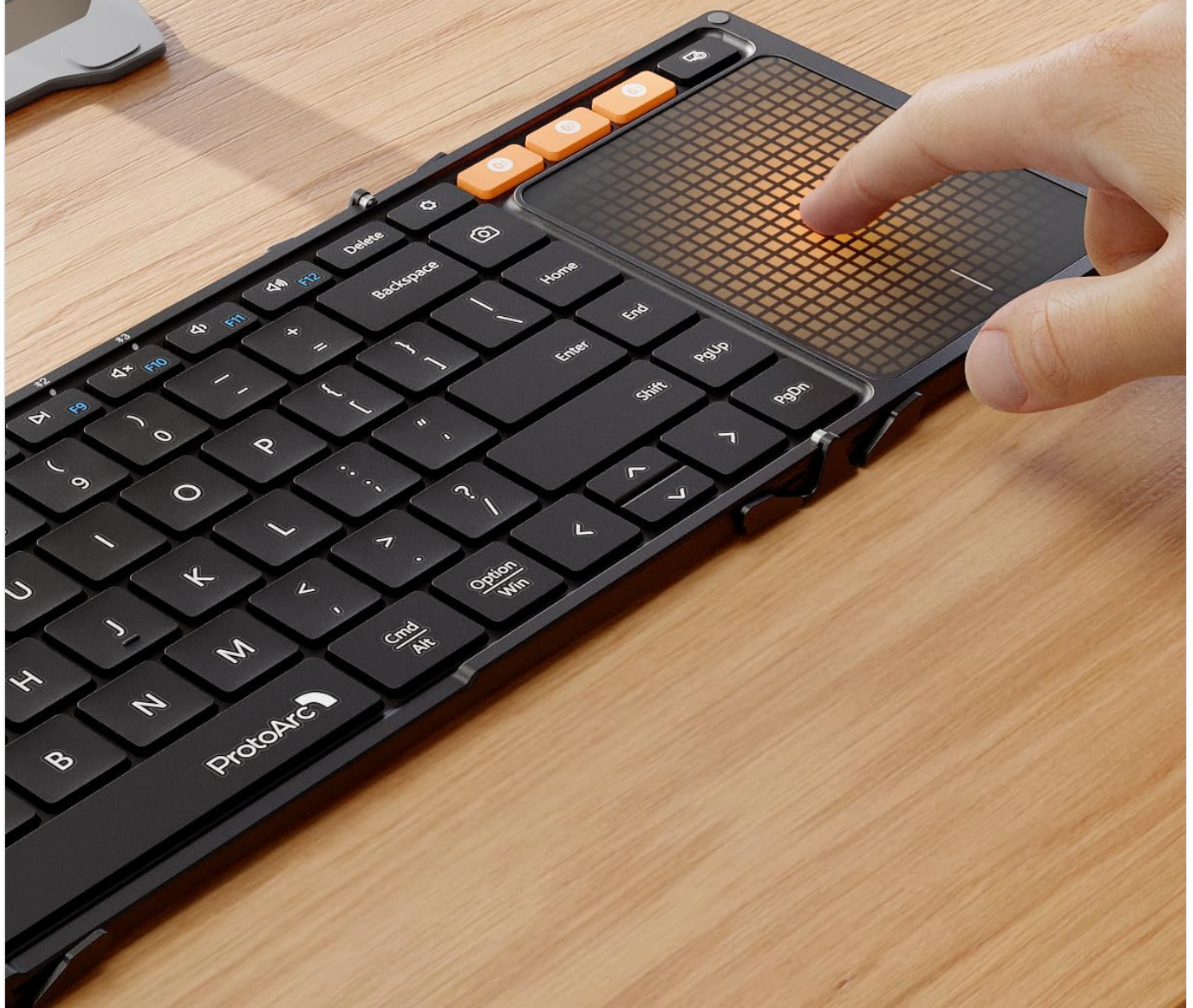
Image: A close-up view of the keyboard's large, smooth trackpad, highlighting its responsive surface for precise navigation.

Precise navigation, scroll without delay