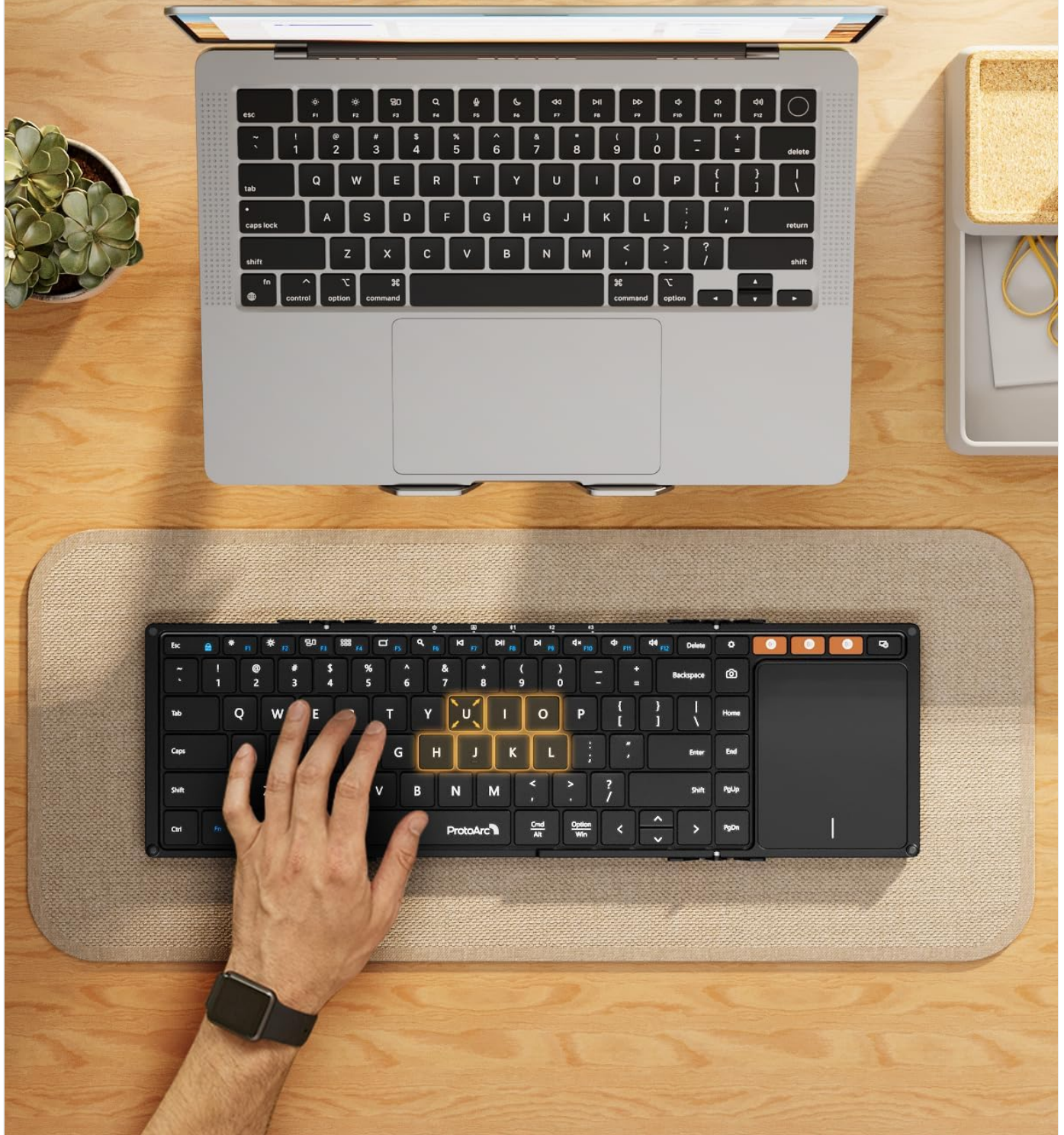
Image: An overhead shot comparing the ProtoArc keyboard's layout and key size to a standard laptop keyboard, emphasizing its full-size keys.