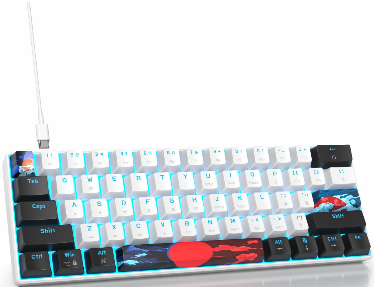
Image: The surmen 60% Mechanical Gaming Keyboard in White-Ice Blue, showcasing its compact design and backlighting.